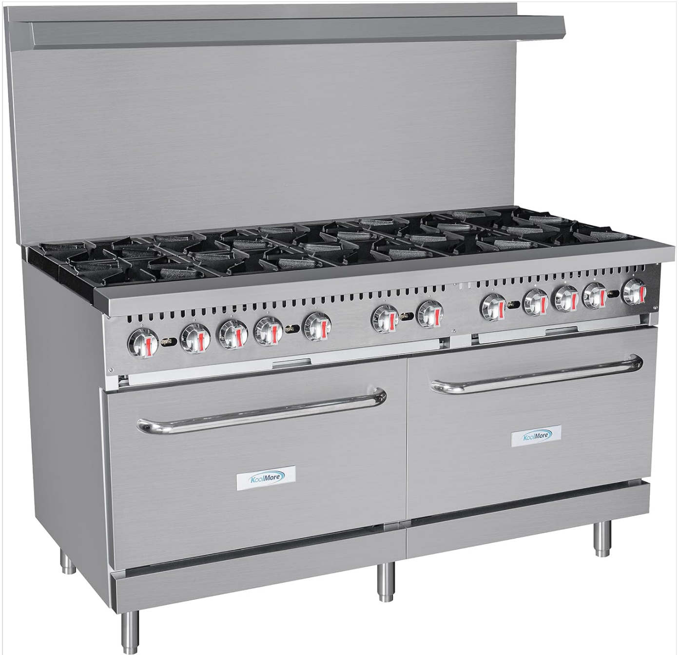
Image Description: A detailed view of the heavy-duty cast iron grates covering the ten open-top burners, designed for commercial use.