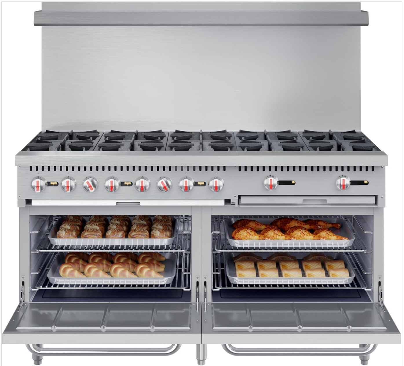
Image Description: The commercial range with both oven doors open, showcasing the interior with multiple racks. One oven contains baked goods like croissants, and the other contains roasted chicken and other items, demonstrating its capacity.