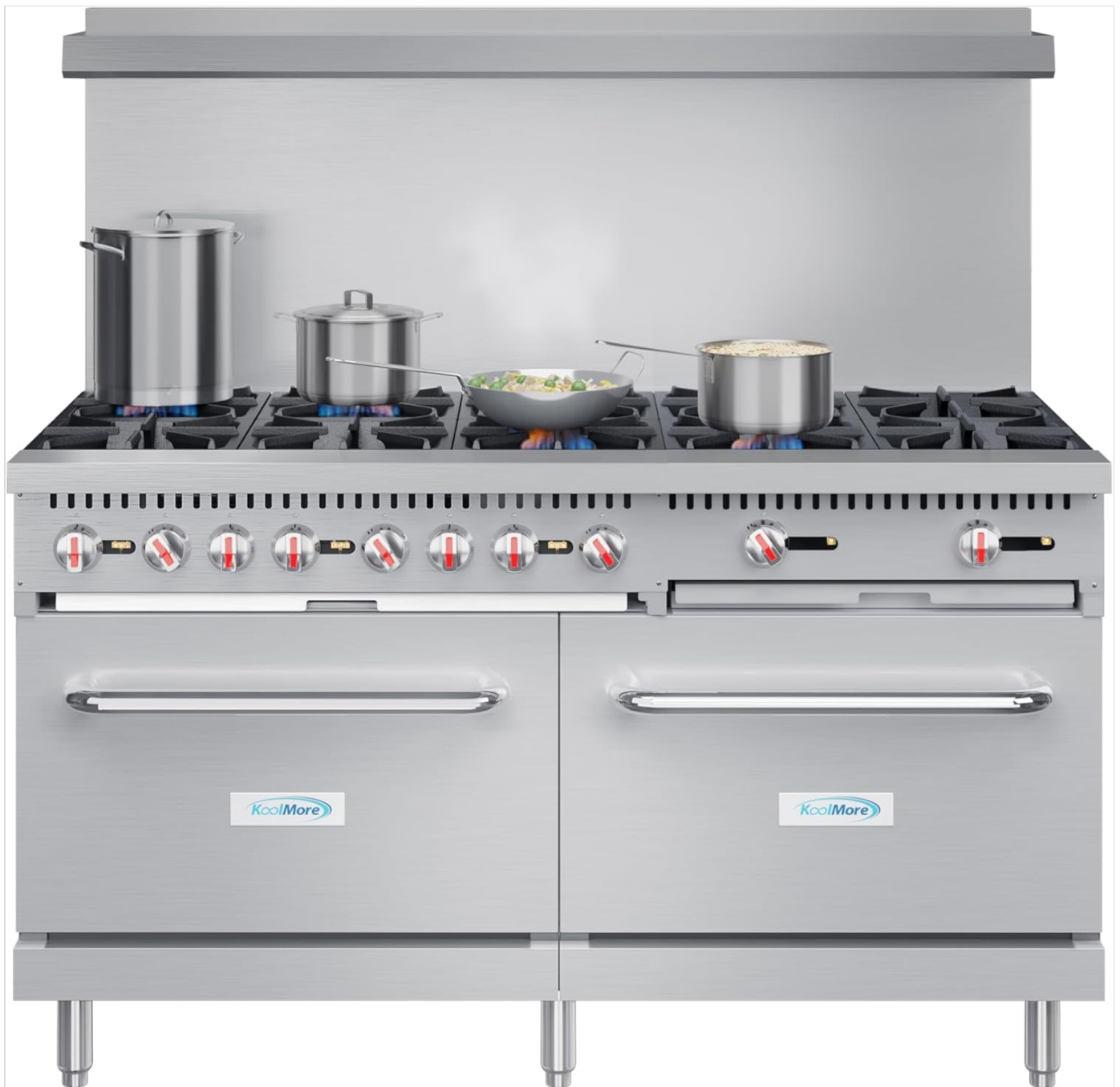
Image Description: A front view of the KoolMore KM-CR60-LP commercial range. It features ten open-top burners with active flames under various cooking vessels, and two oven compartments below. The appliance is made of stainless steel.