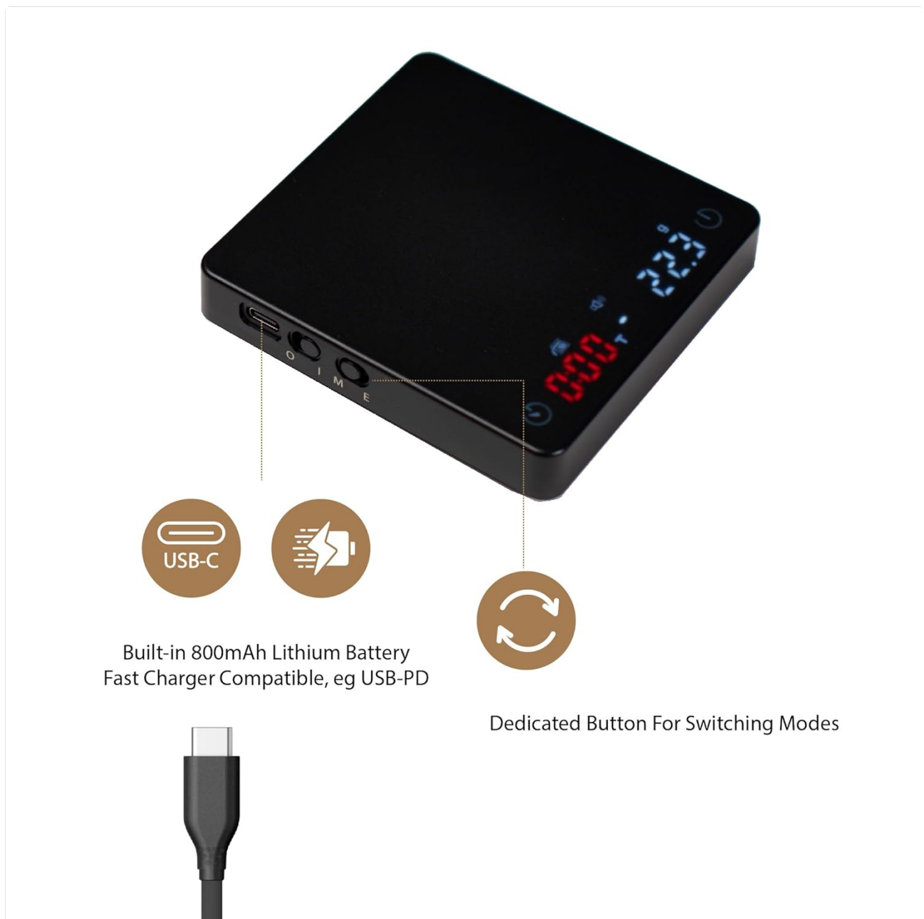
Figure 1: Side view of the MiiCoffee Nano Coffee Scale, highlighting the Type-C charging port and mode selection buttons. The charging port is strategically placed on the left side to avoid steam from espresso machines.