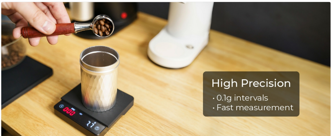
Figure 3: The scale displaying a precise weight measurement with a coffee container, illustrating its high precision in 0.1g intervals and fast measurement capability.