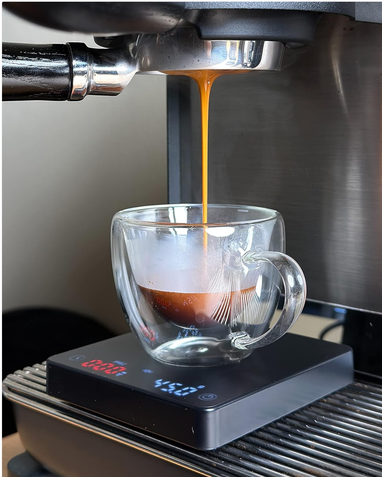
Figure 5: An espresso shot being brewed directly onto the MiiCoffee Nano Coffee Scale, demonstrating its compact size and real-time measurement during extraction.

Place your espresso cup on the silicone pad on the scale. The scale will automatically tare to zero. Begin your espresso extraction. The timer will automatically start when the first drops of espresso hit the cup. Monitor the weight and time to achieve your desired espresso yield.