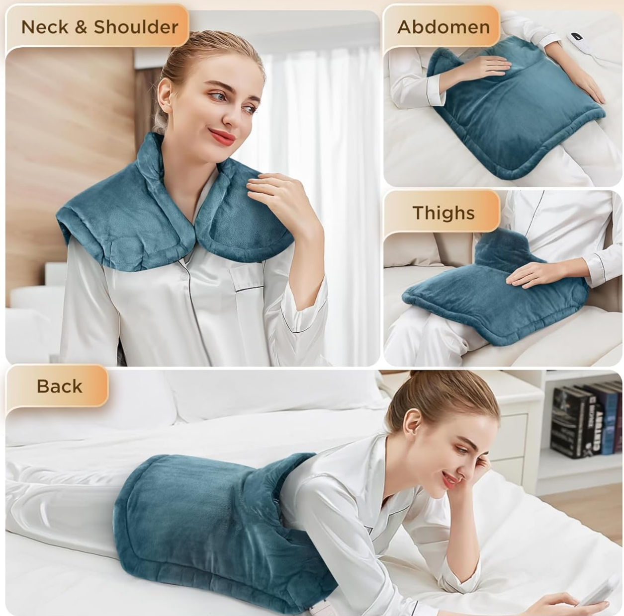
Figure 6: The heating pad can be used on various body parts for targeted warmth.