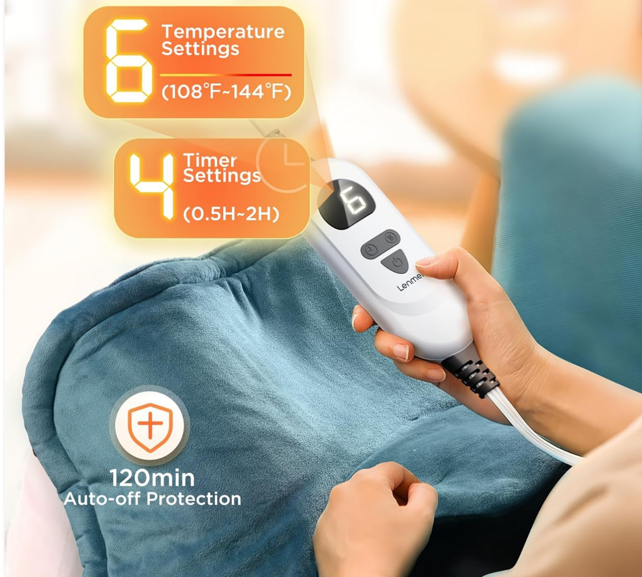
Figure 5: The LED controller allows easy selection of 6 heat levels and 4 auto-off timer options.