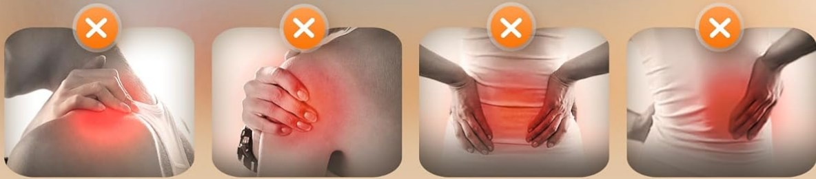
Figure 3: Graphene infusion allows heat to penetrate deeper into muscle tissues for enhanced relief.