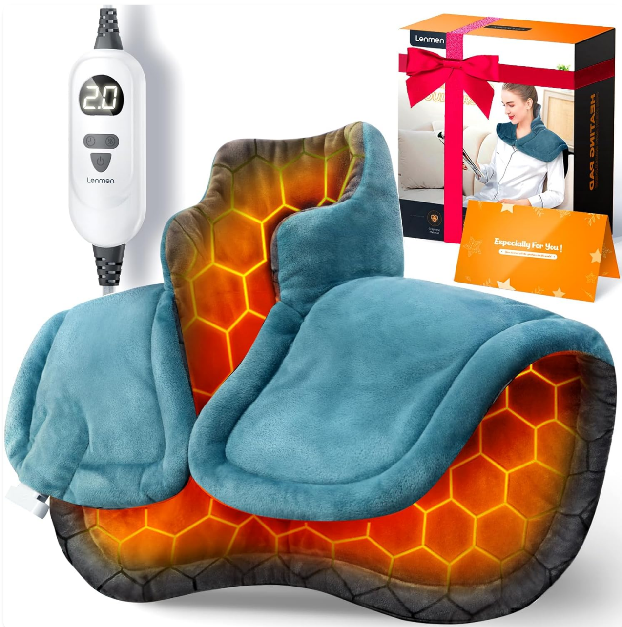
Figure 1: Lenmen Graphene-Infused Heating Pad with controller and gift box.