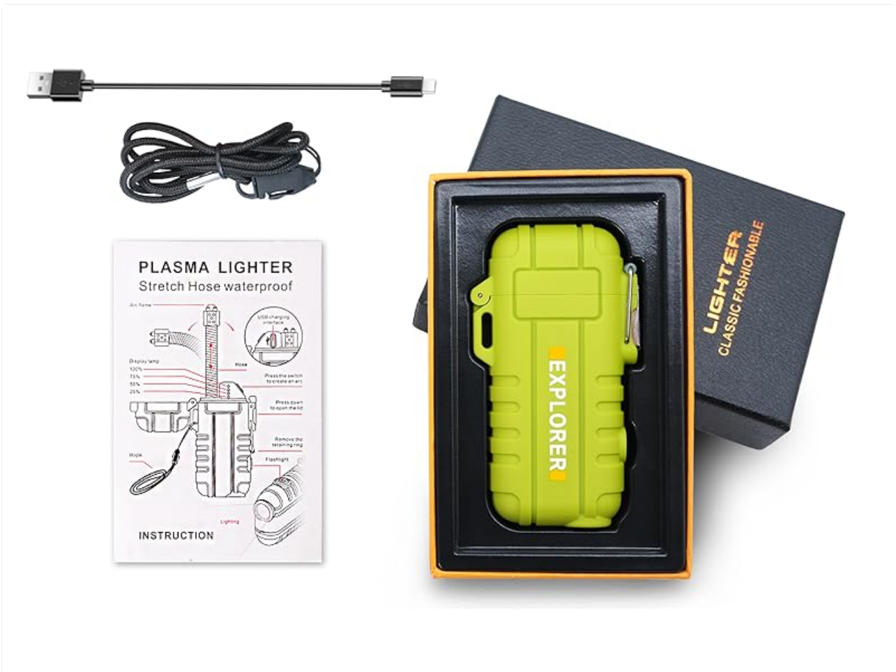
Image: Contents of the Laffizz Lighter package, including the lighter, charging cable, and instruction manual.