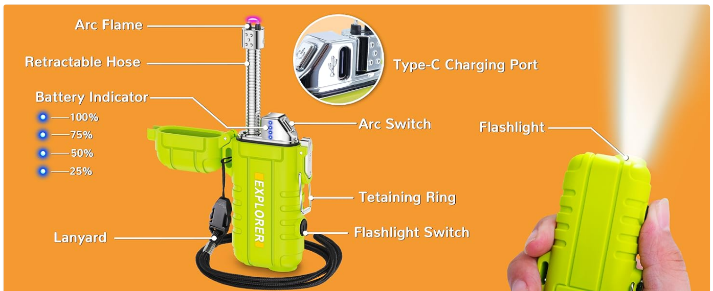
Image: Detailed diagram illustrating the various components of the Laffizz Waterproof Lighter.