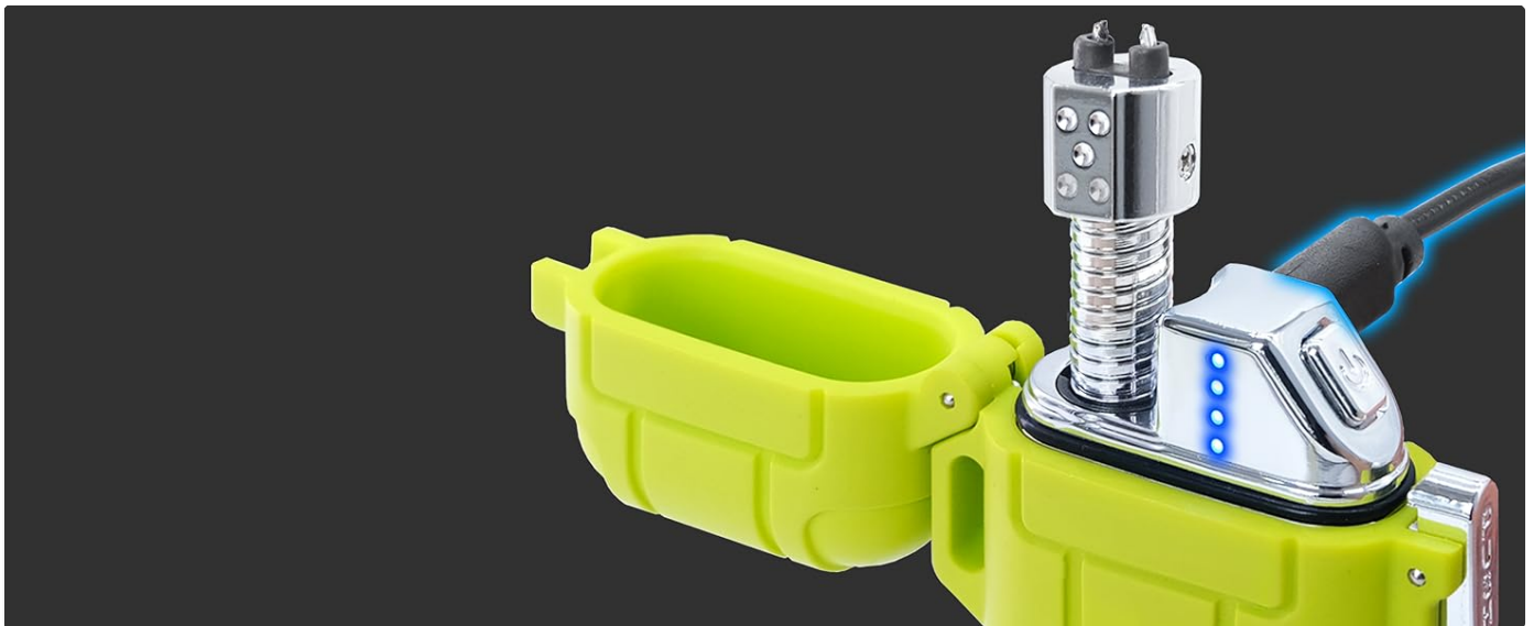
Image: The lighter being charged via its Type-C port, with the LED battery indicator showing charge status.