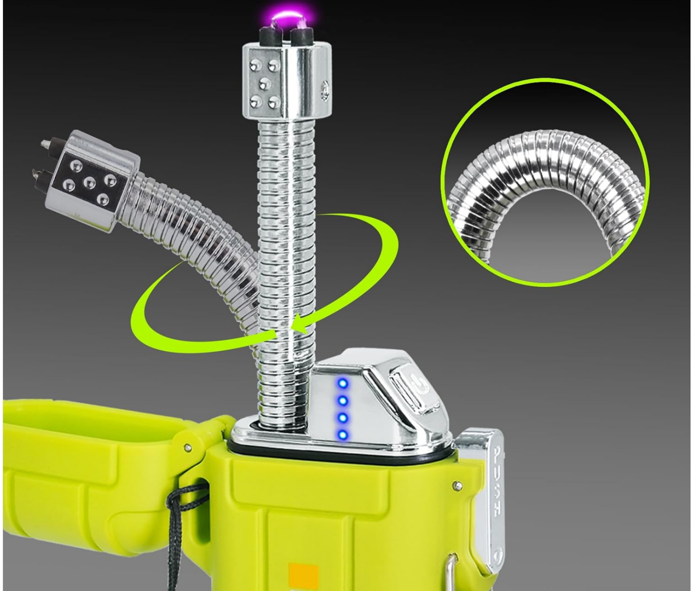
Image: Illustration of the lighter's 360-degree flexible neck design.