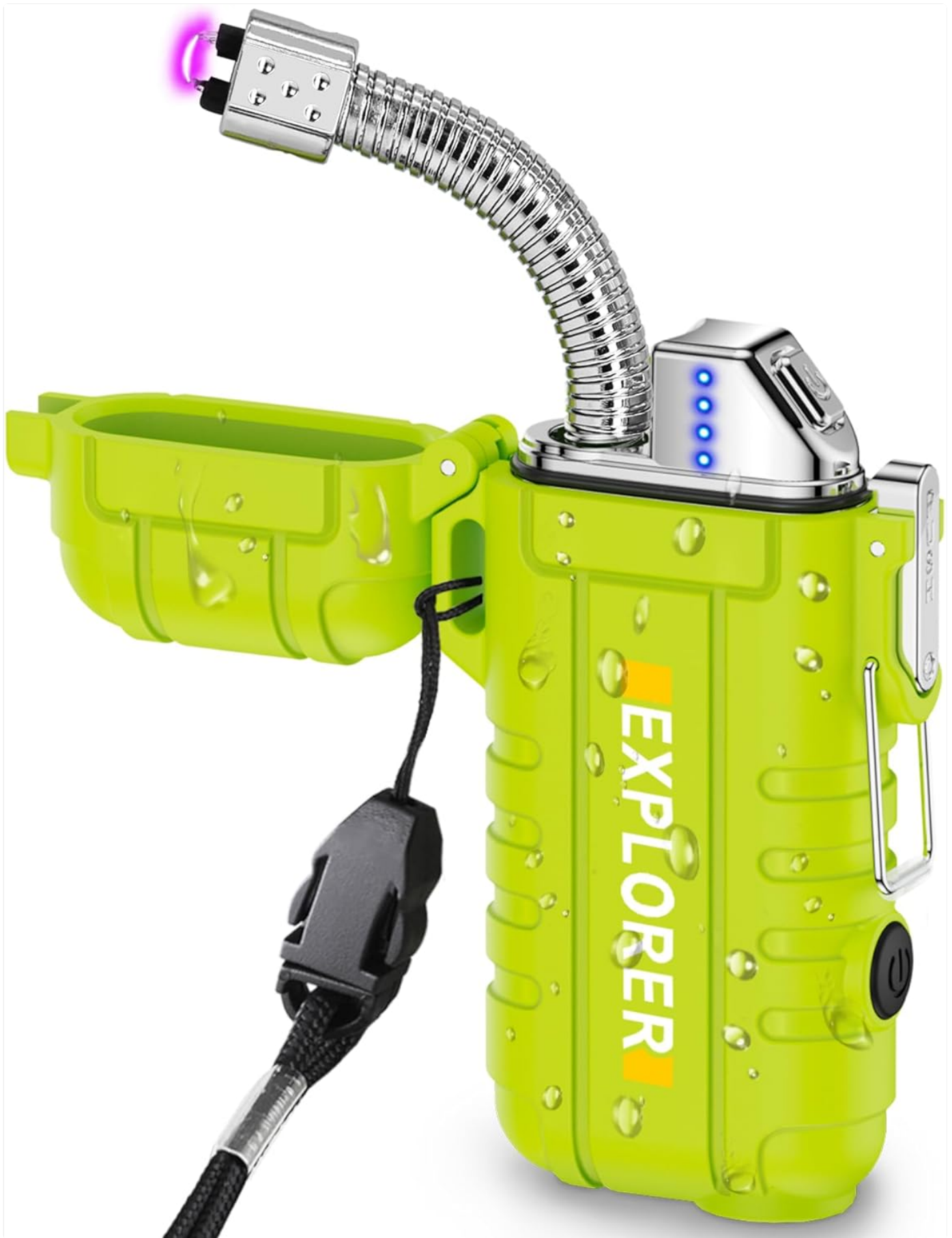
Image: The Laffizz Waterproof Lighter, showcasing its flexible neck and robust design.