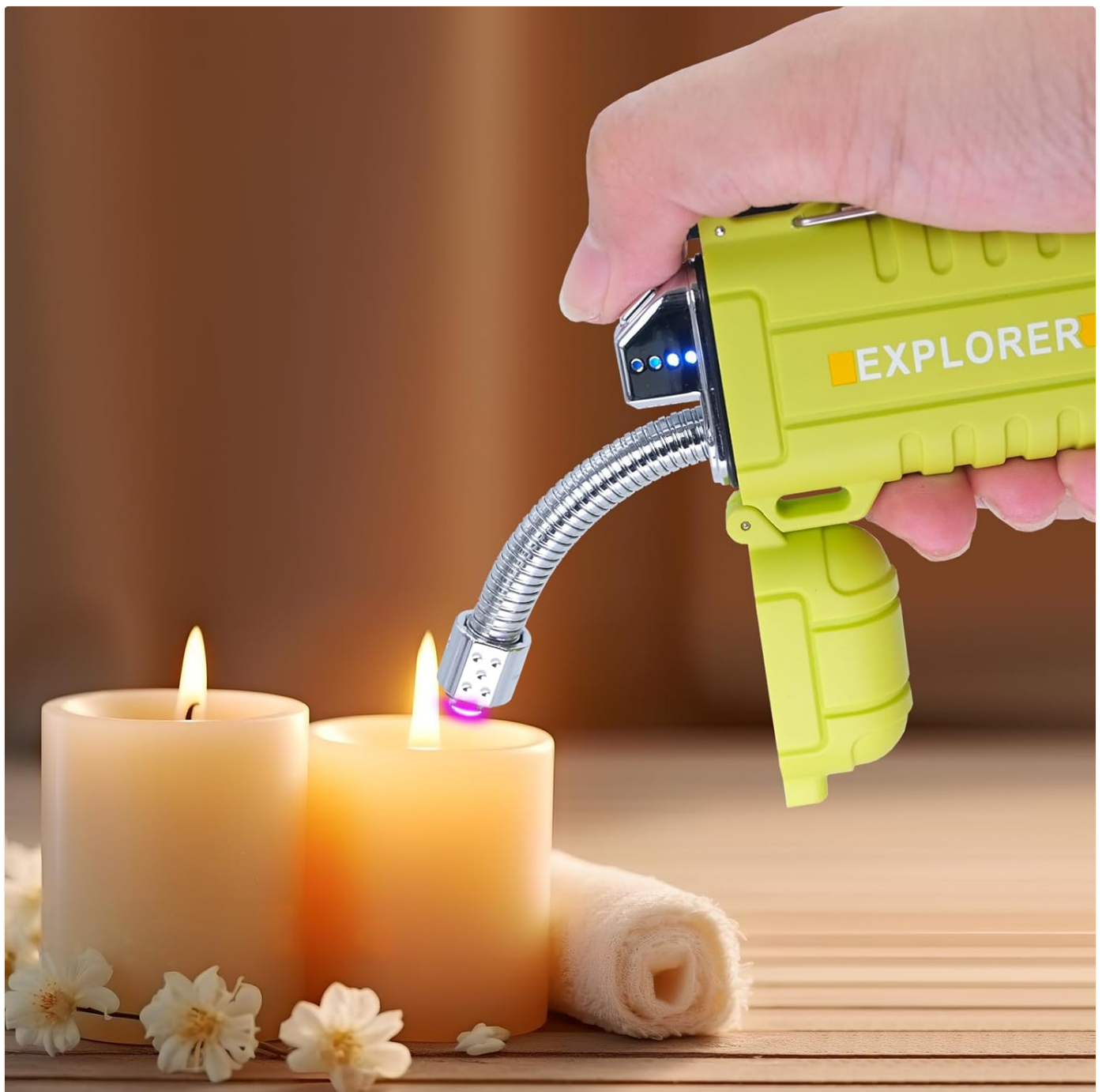
Image: The lighter in use, demonstrating its ability to light a candle with the flexible neck.

Image: Step-by-step visual guide on operating the lighter, from opening to ignition.