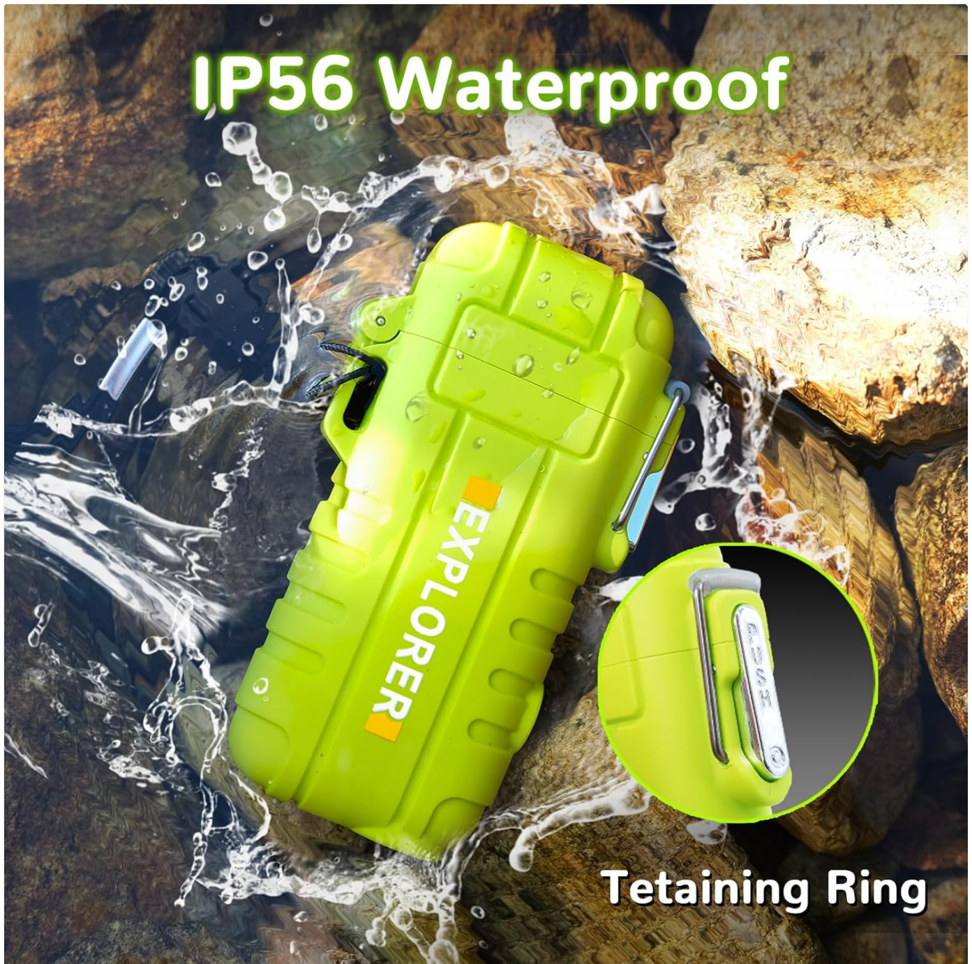
Image: The lighter submerged in water, highlighting its IP56 waterproof capability when properly sealed.