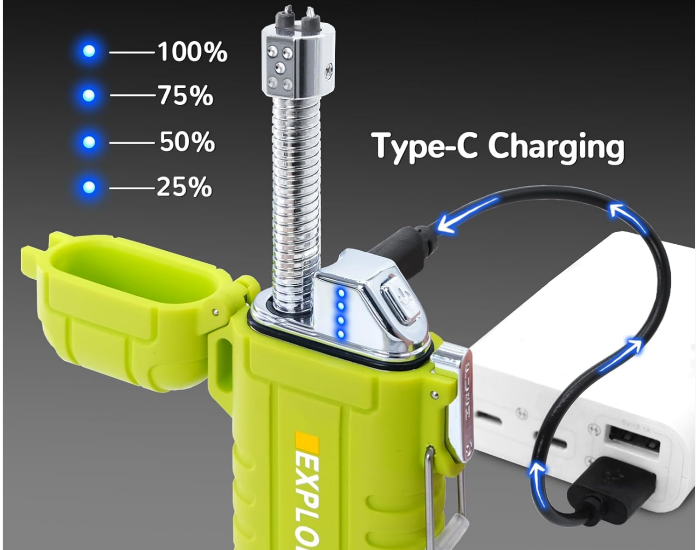
Image: Close-up of the LED battery indicator, detailing the charge levels.