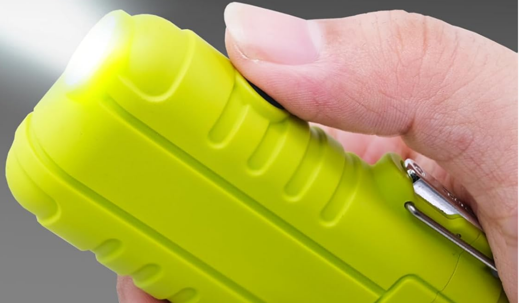
Image: The lighter's flashlight demonstrating its three modes: High, Low, and Strobe.