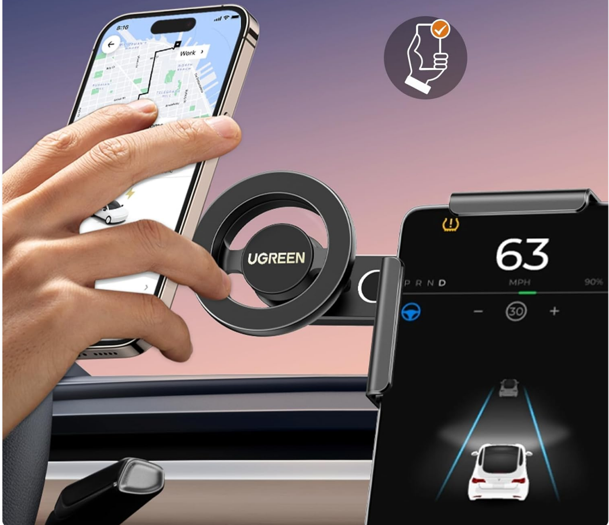
Image 4.2: A hand demonstrating the ease of one-handed attachment of a smartphone to the magnetic holder.