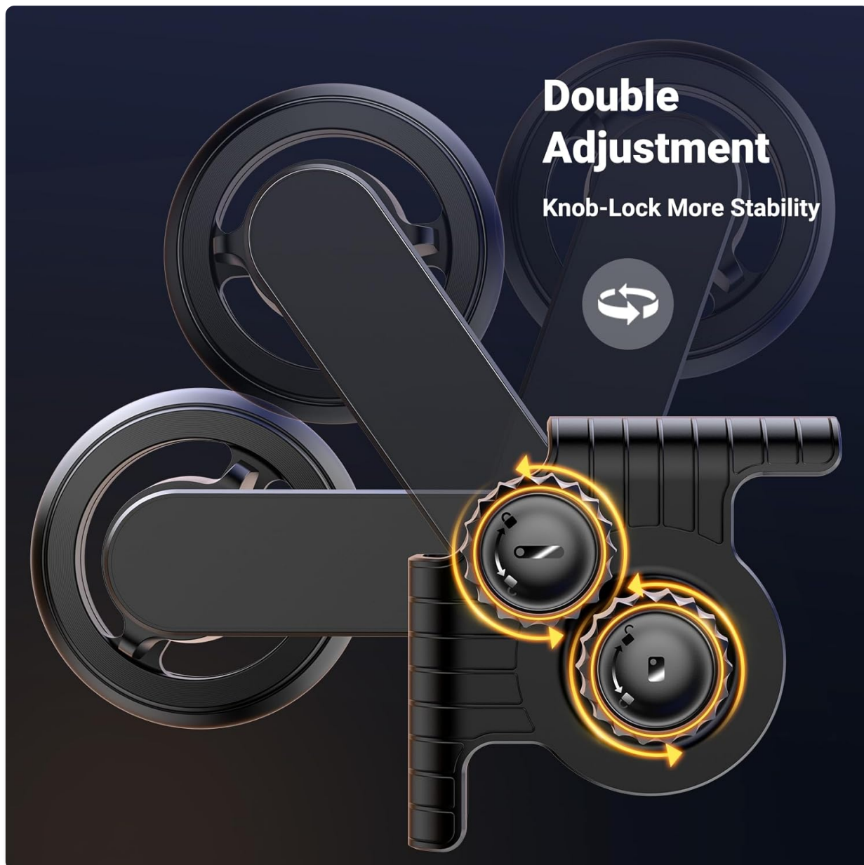
Image 3.1: Detail of the double adjustment knobs on the UGREEN holder, used to secure it to the Tesla screen.

5. Attach Your Phone: Gently bring your phone close to the magnetic head of the holder. The magnets will snap it securely into place.