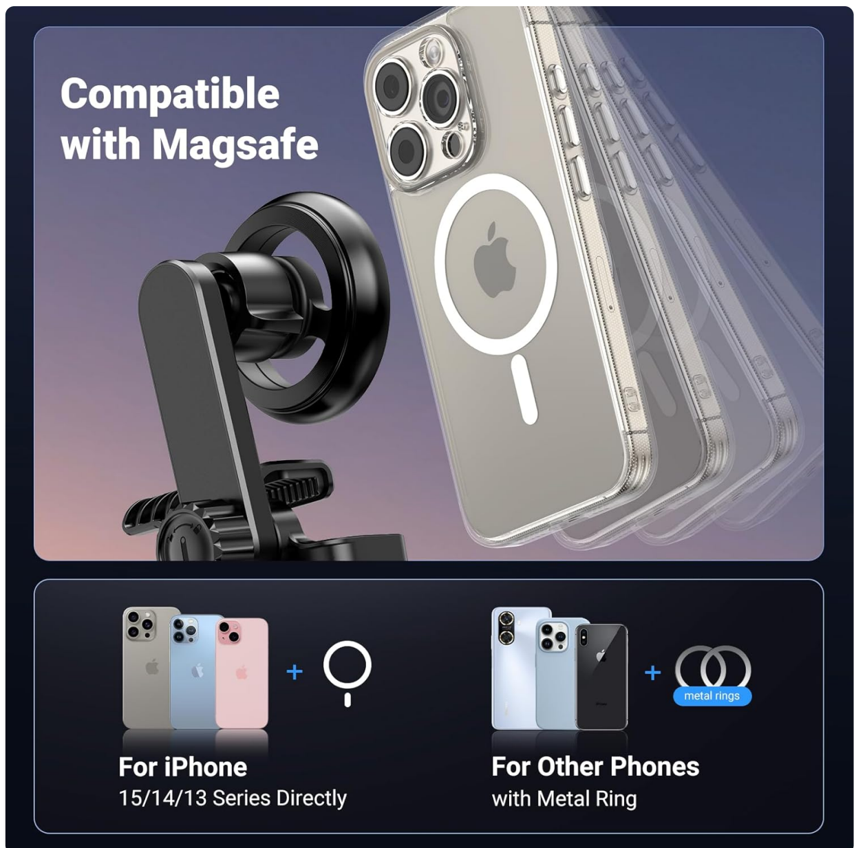
Image 3.2: Illustration of MagSafe compatibility for iPhones and how to use metal rings for other smartphone models.