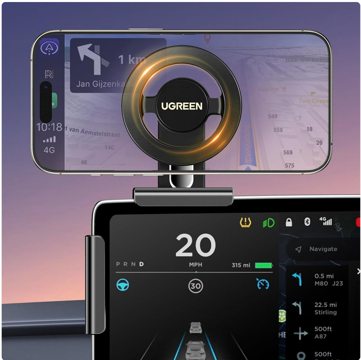
Image 4.1: A smartphone mounted horizontally on the holder, showing a navigation map, demonstrating flexible viewing.