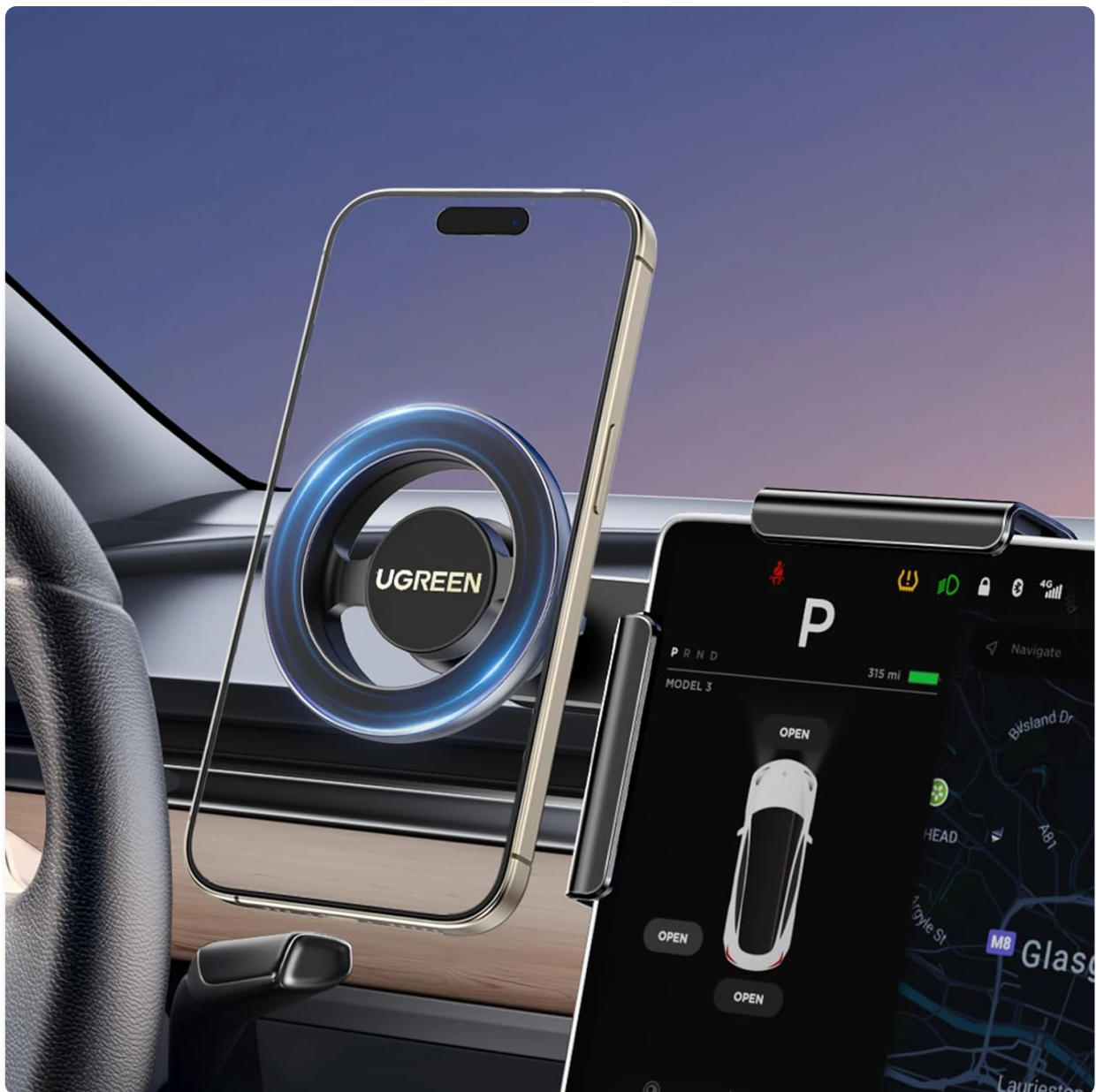
Image 1.1: UGREEN Magnetic Phone Holder securely mounted on a Tesla Model 3/Y central screen, displaying a smartphone with navigation.