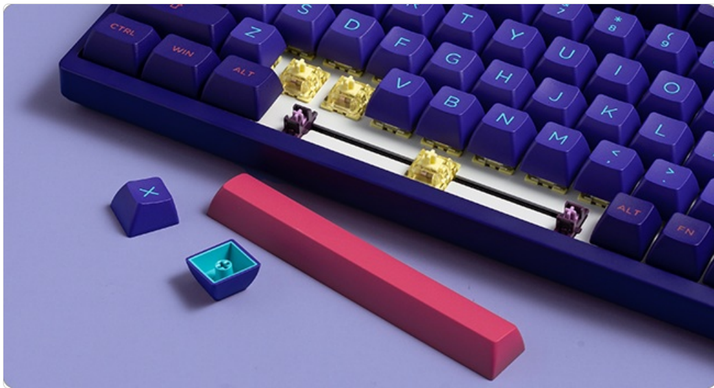
Figure 3: PBT Double-shot Keycaps construction.