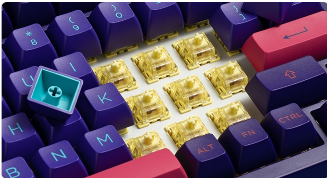
Figure 4: Mechanical switches visible after keycap removal.