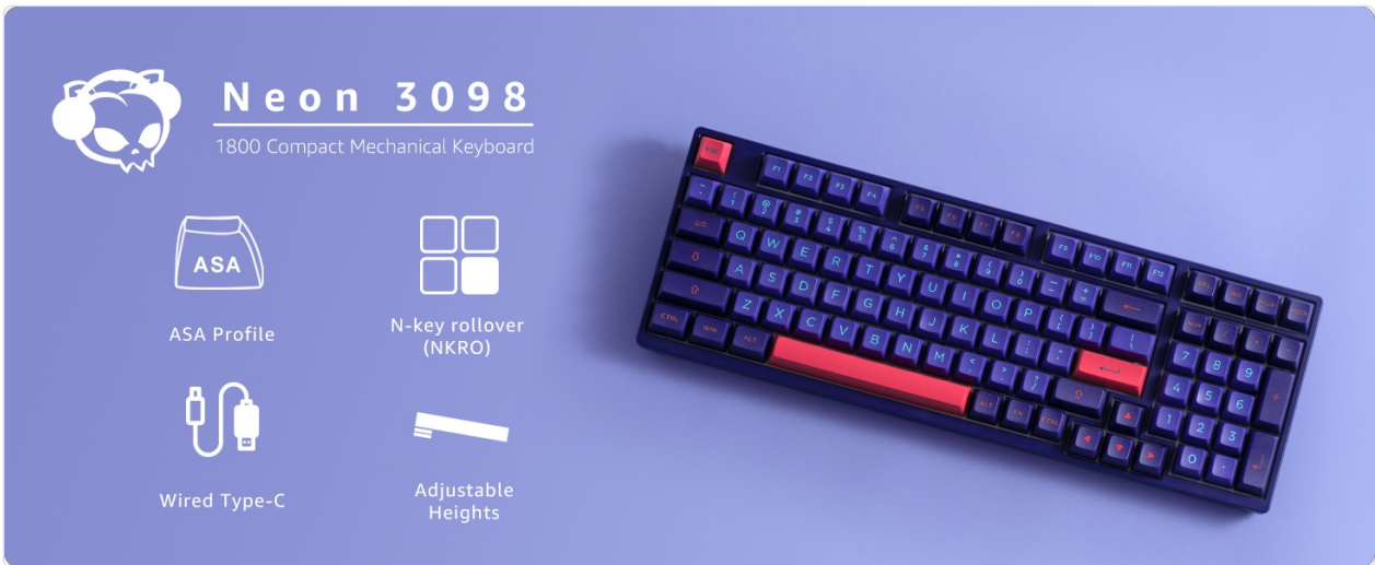
Figure 1: Akko 3098 Mechanical Keyboard with key features highlighted.

This manual provides detailed instructions for the Akko 3098 Mechanical Keyboard. Designed for both Mac and Windows users, this keyboard features a compact 98-key layout, durable PBT double-shot keycaps, and hot-swappable switches for a customizable typing experience. Please read this manual thoroughly to ensure proper setup and operation.