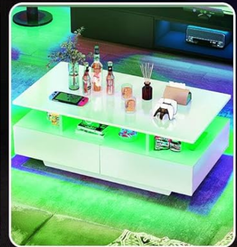
Image: A visual representation of the remote control and examples of the coffee table illuminated in different colors and brightness levels.