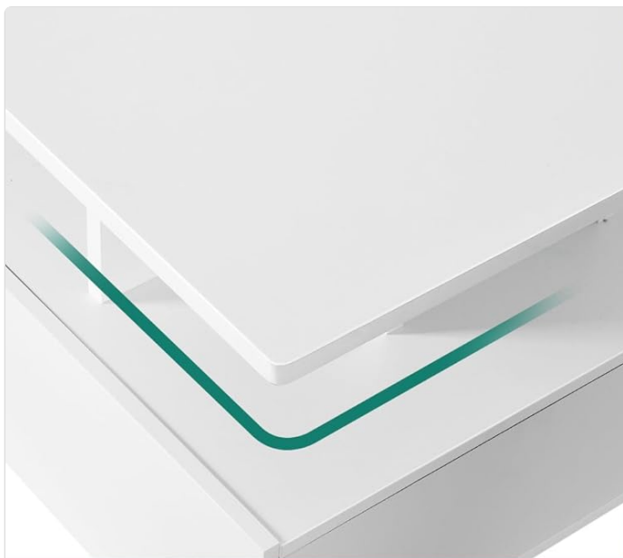
Round Edge for Collision Prevention