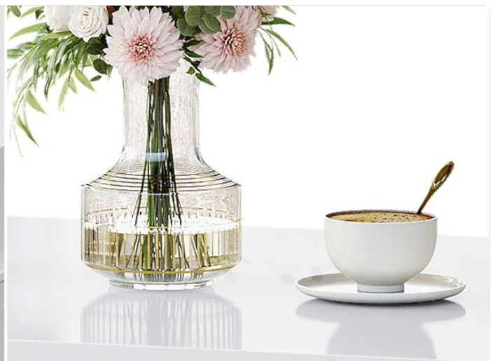
Easy-to-clean High-gloss Finish