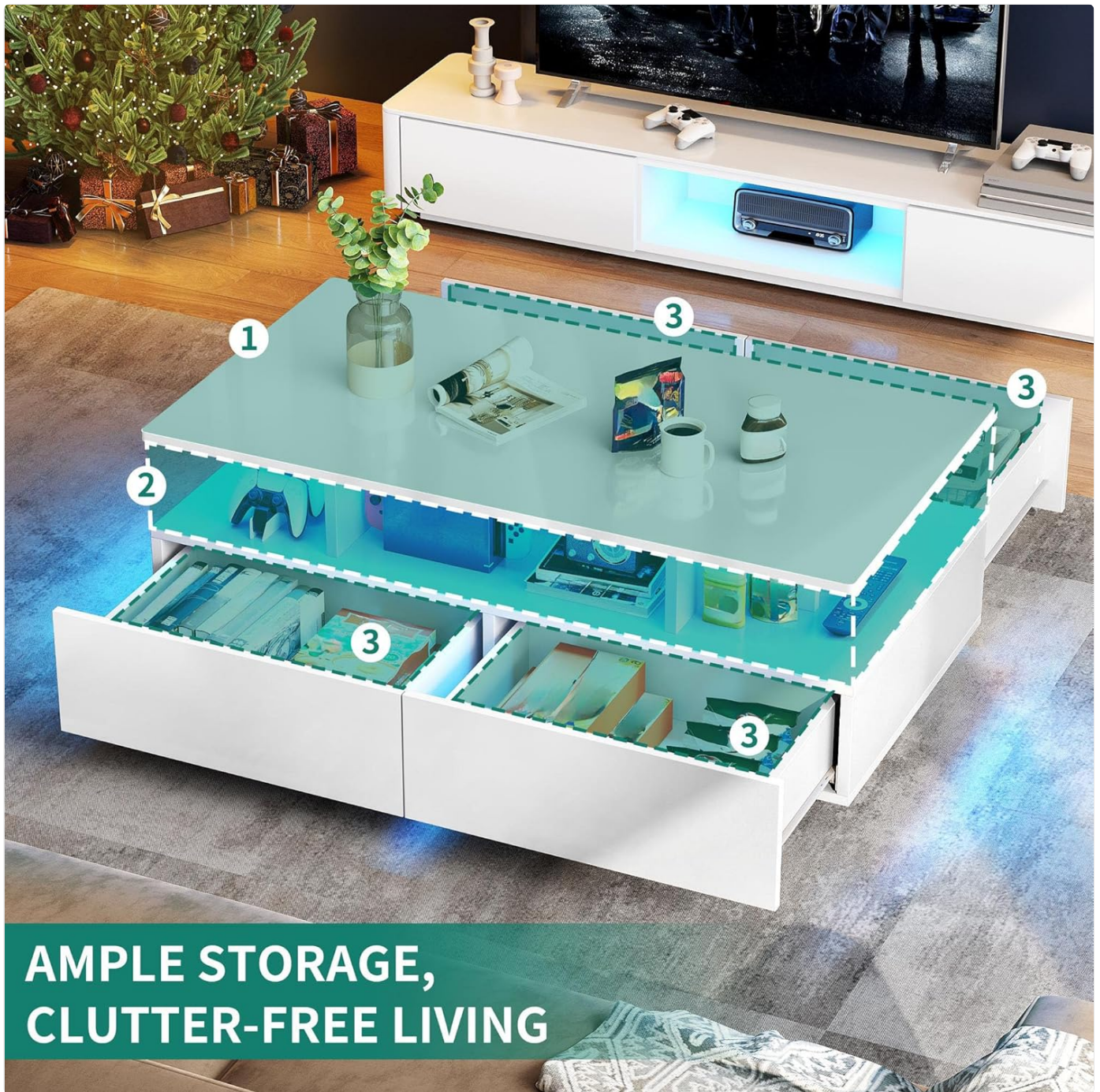
Image: An exploded view of the coffee table showing various panels and drawers, indicating the components included.