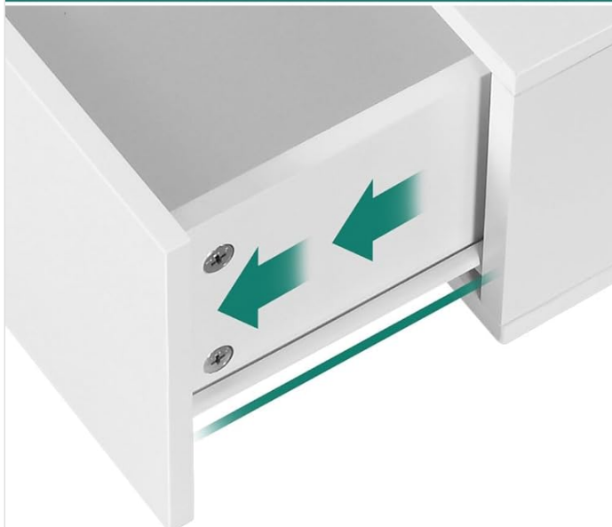
Smooth and Silent Slide