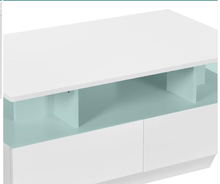
Extra Open Storage