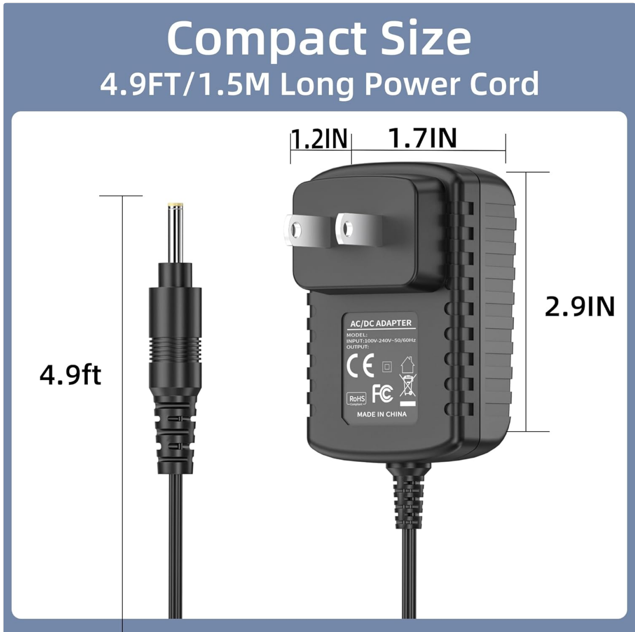
Image 5.1: Details of the power cord's standard plug, durable cable, and output connector.