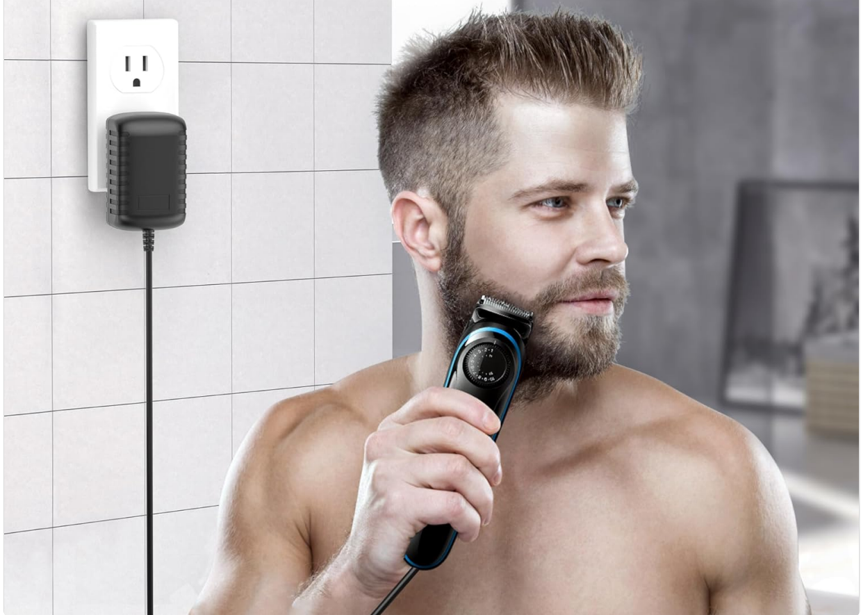
Image 3.1: The JALOSOFO charger connected to a Braun trimmer and a wall outlet during use.