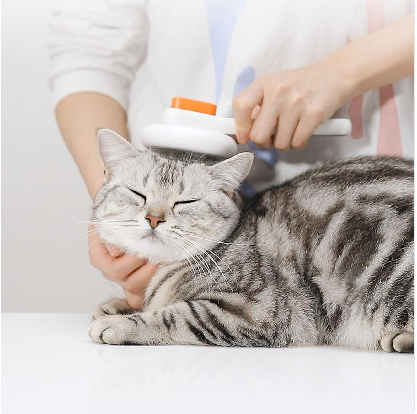
Image: A deshedding brush being used on a cat, illustrating its ability to reach deep into the undercoat to remove loose fur effectively.