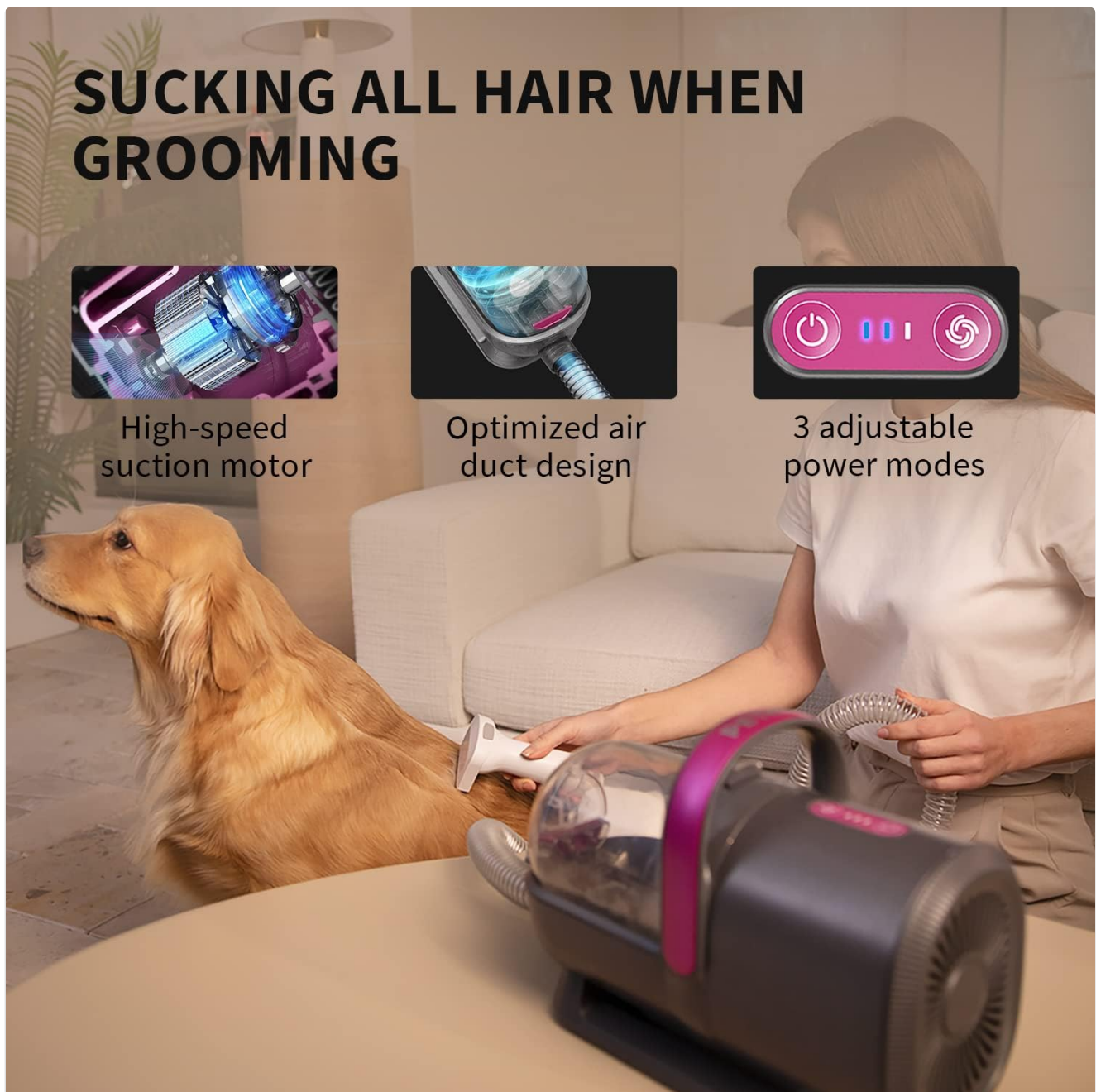
Image: The PETKIT grooming vacuum in action, demonstrating its high-speed suction motor, optimized air duct design, and three adjustable power modes for efficient hair collection during grooming.