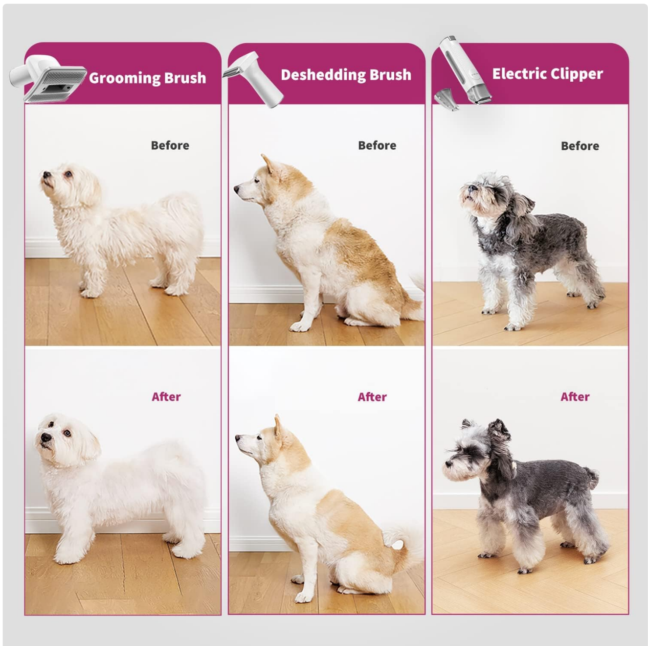
Image: A comparison showing the "Before" and "After" appearance of pets groomed using the Grooming Brush, Deshedding Brush, and Electric Clipper, demonstrating the effectiveness of each tool.