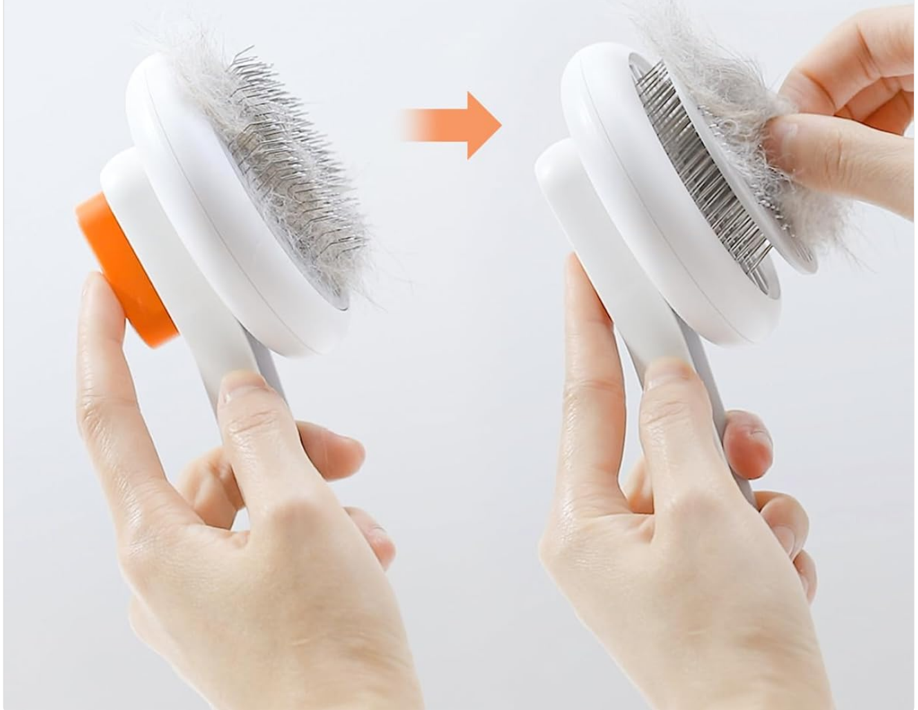
Image: A demonstration of the one-click hair removal feature on the grooming brush, showing how collected fur is easily pushed off the bristles for quick cleaning.