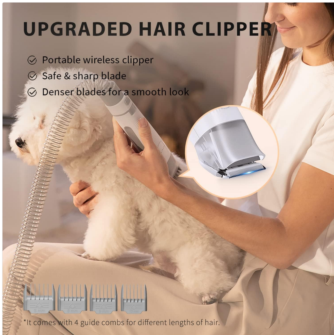
Image: A user demonstrating the upgraded portable wireless hair clipper on a small dog, highlighting its safe and sharp blades, and denser blades for a smooth cut. Four guide combs are shown below.

The upgraded hair clipper features precision-cut blades for a smooth and comfortable grooming experience without pulling your pet's hair. It is portable and wireless for ease of use.