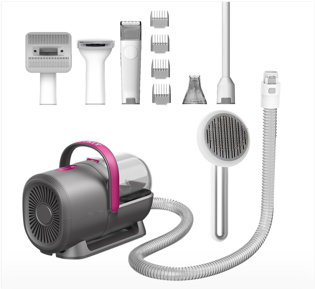
Image: All components of the PETKIT Pet Grooming Vacuum Kit, including the main vacuum unit, grooming brush, deshedding tool, paw trimmer, fur clipper, and various guide combs.

Your PETKIT Pet Grooming Vacuum Kit includes the following items: