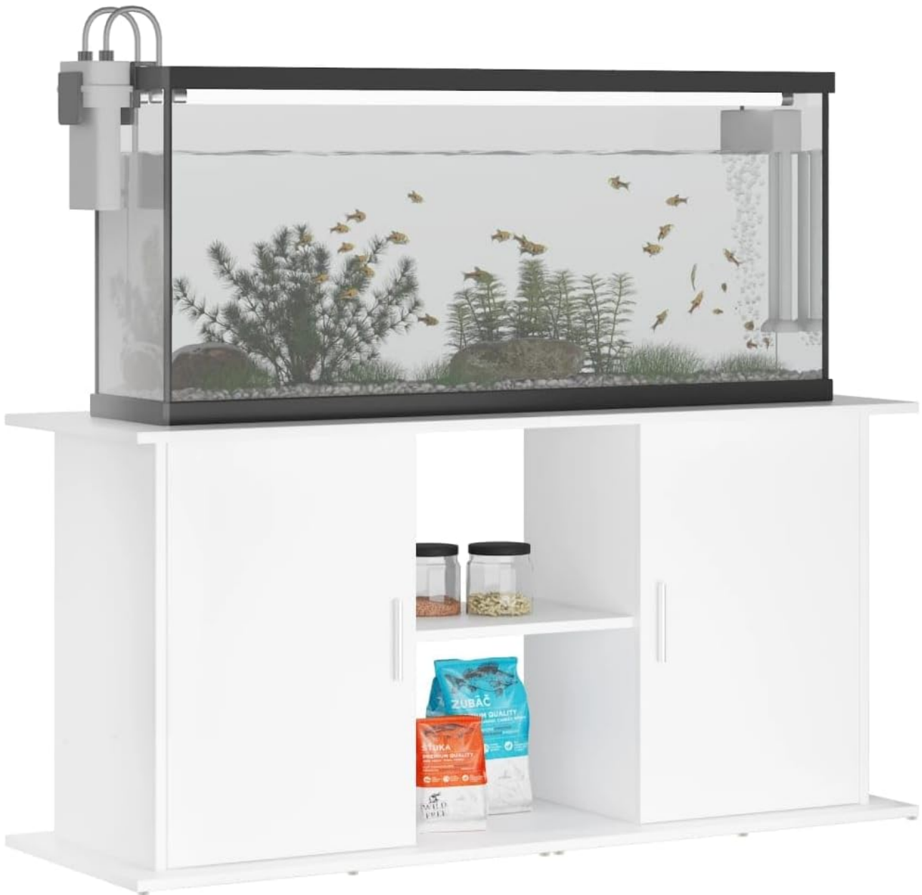
Image description: The white aquarium stand with an aquarium placed on its top surface. The stand's central open shelf is visible, holding various items like jars and bags, demonstrating its storage capability.