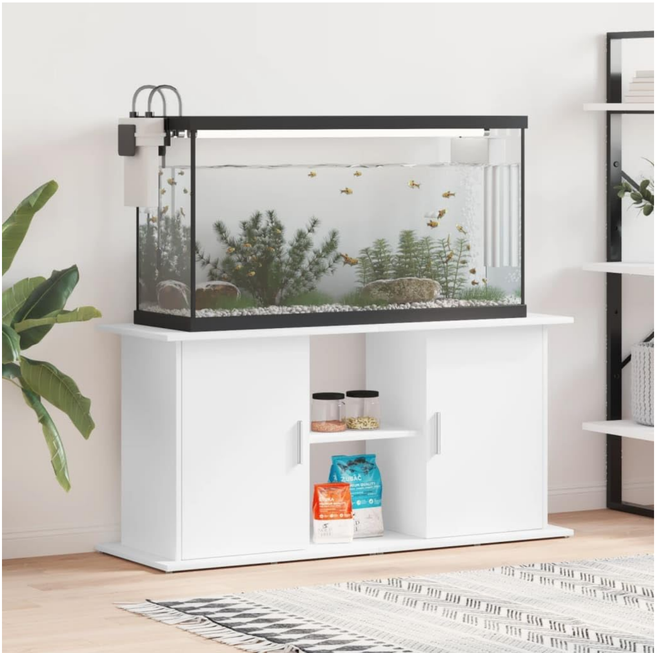
Image description: The white aquarium stand with an aquarium on top, integrated into a modern living room setting. A green plant and a patterned rug are visible, demonstrating how the stand fits into a home environment.