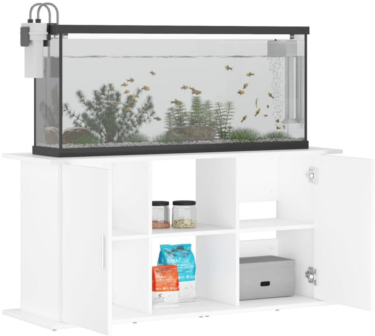
Image description: The white aquarium stand with an aquarium on top. One of the side cabinet doors is open, revealing internal shelving, while the central open shelf is also visible, highlighting the stand's storage compartments.