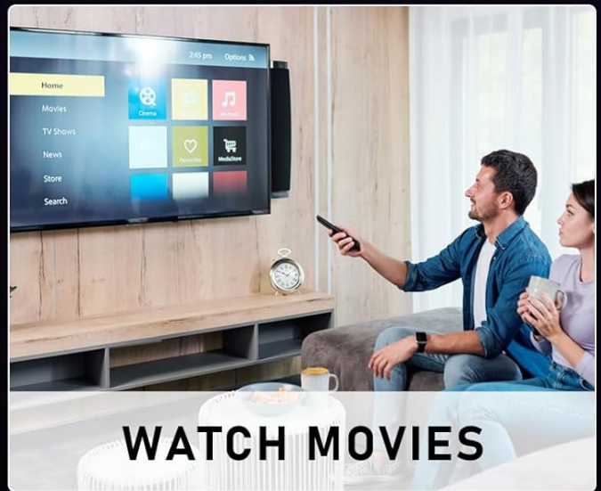
Image: A collage depicting various application scenarios: music sharing, playing games, conducting meetings, and watching movies, demonstrating the device's versatility.