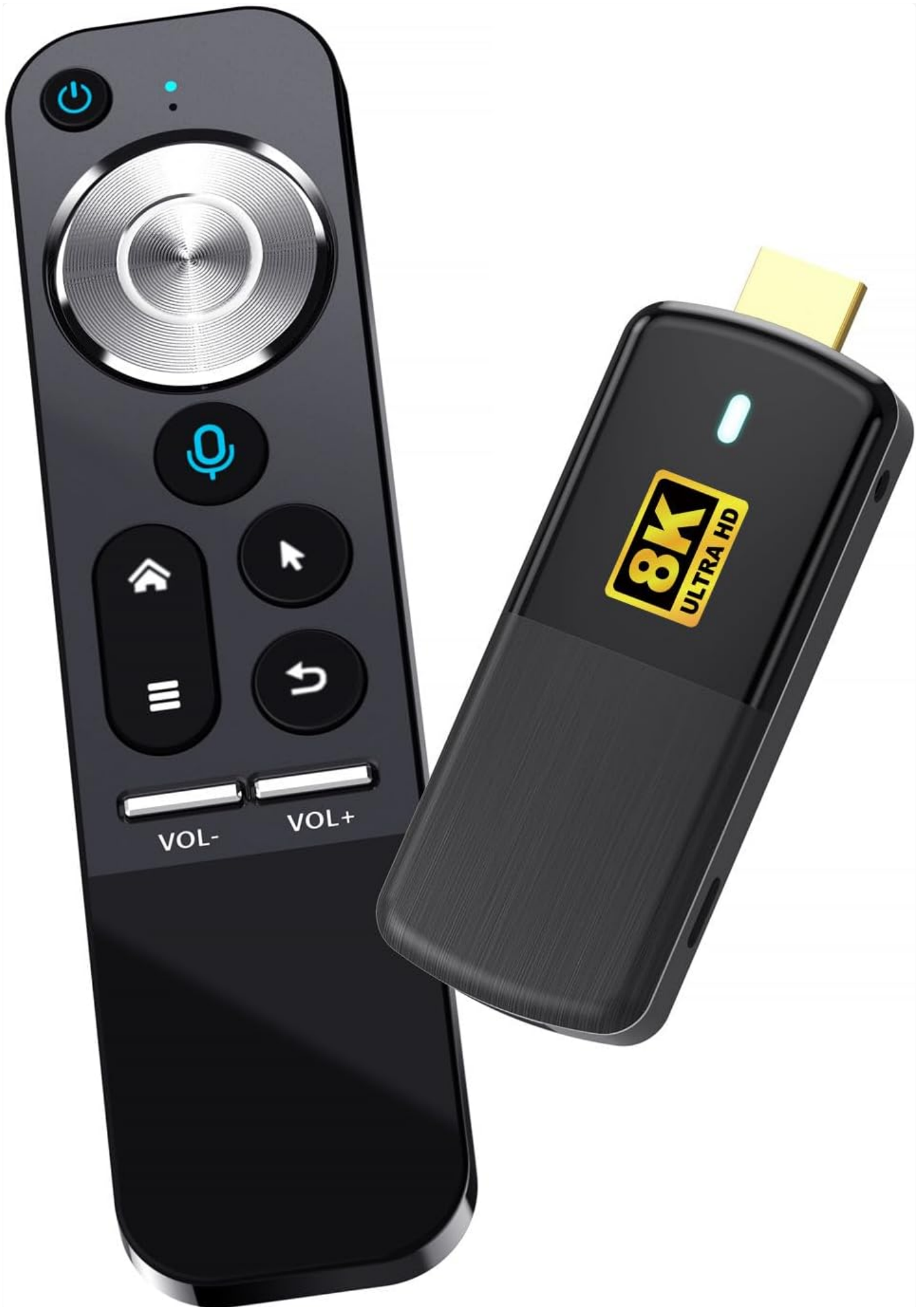
Image: The H96MAX M3 TV Box (stick form factor) and its accompanying remote control, showcasing their sleek design.