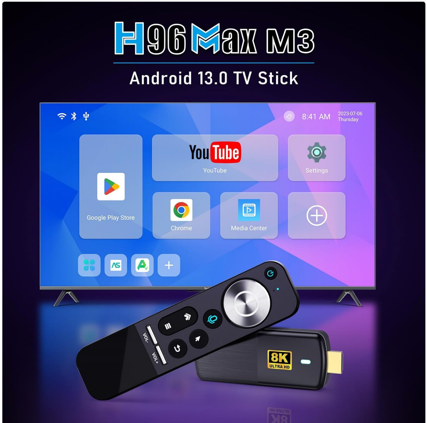
Image: The H96MAX M3 Android 13.0 TV Stick, its remote, and the product packaging, illustrating the complete set.