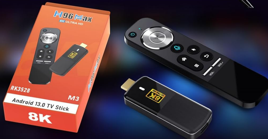
Image: The H96MAX M3 TV Box connected to a television, displaying the Android 13.0 interface with various streaming applications.