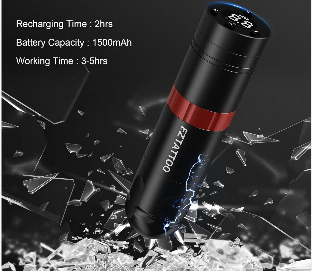
Image 5: Details on recharging time, battery capacity, and working time.