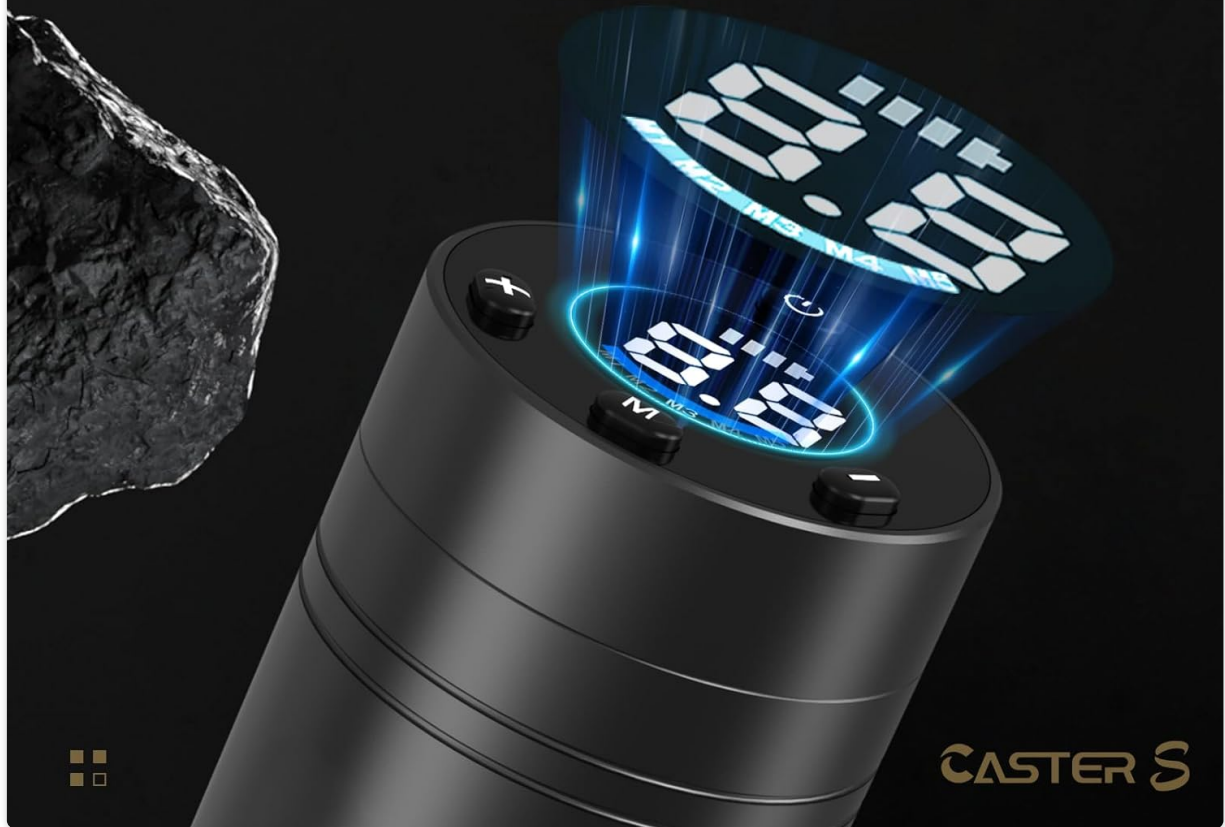
Image 7: Close-up of the machine's display, illustrating the memory function with 5 modes.

Better recording of tattoo artists' habits