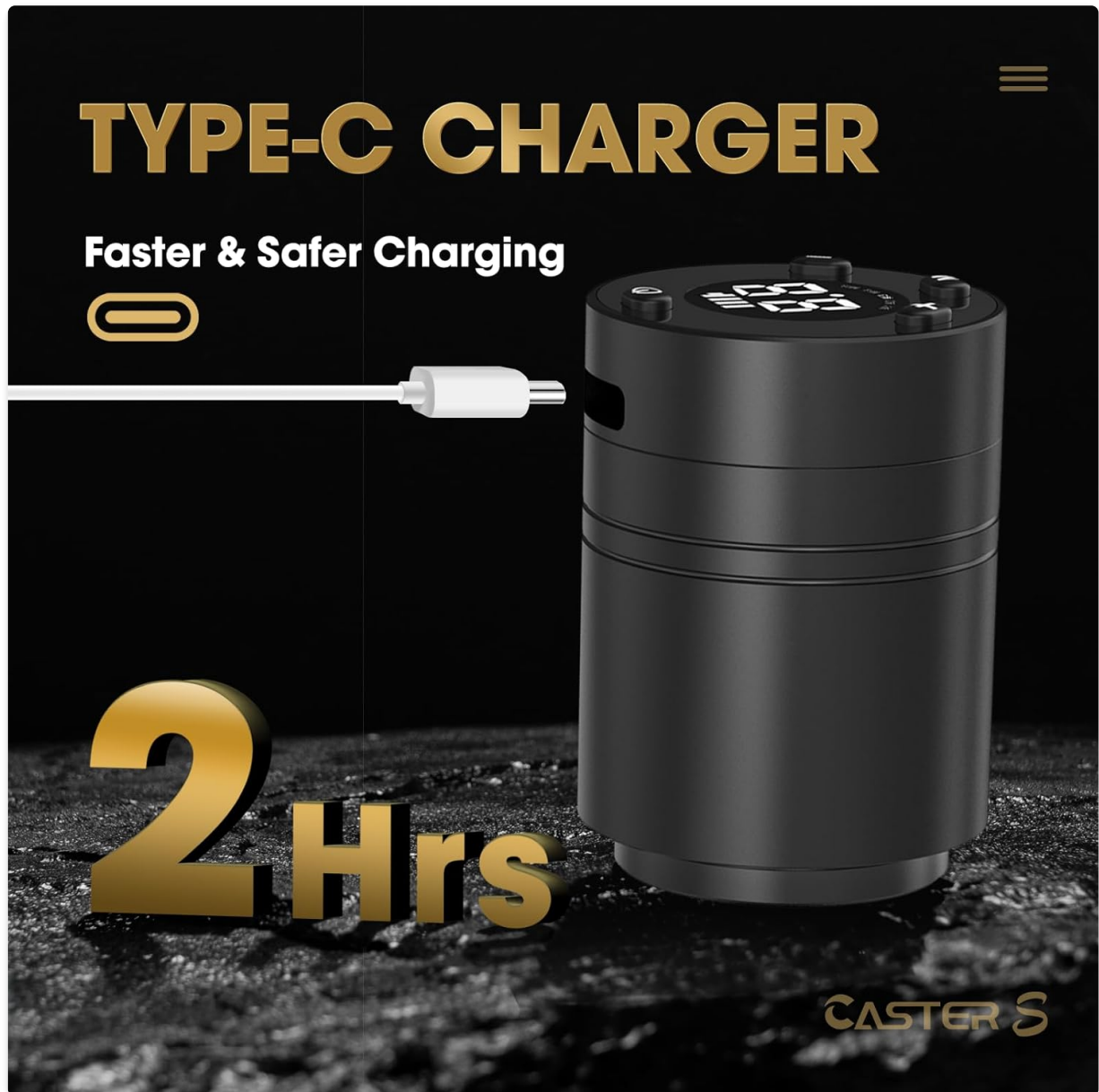
Image 4: Illustrates the Type-C charging port and cable connection for efficient charging.