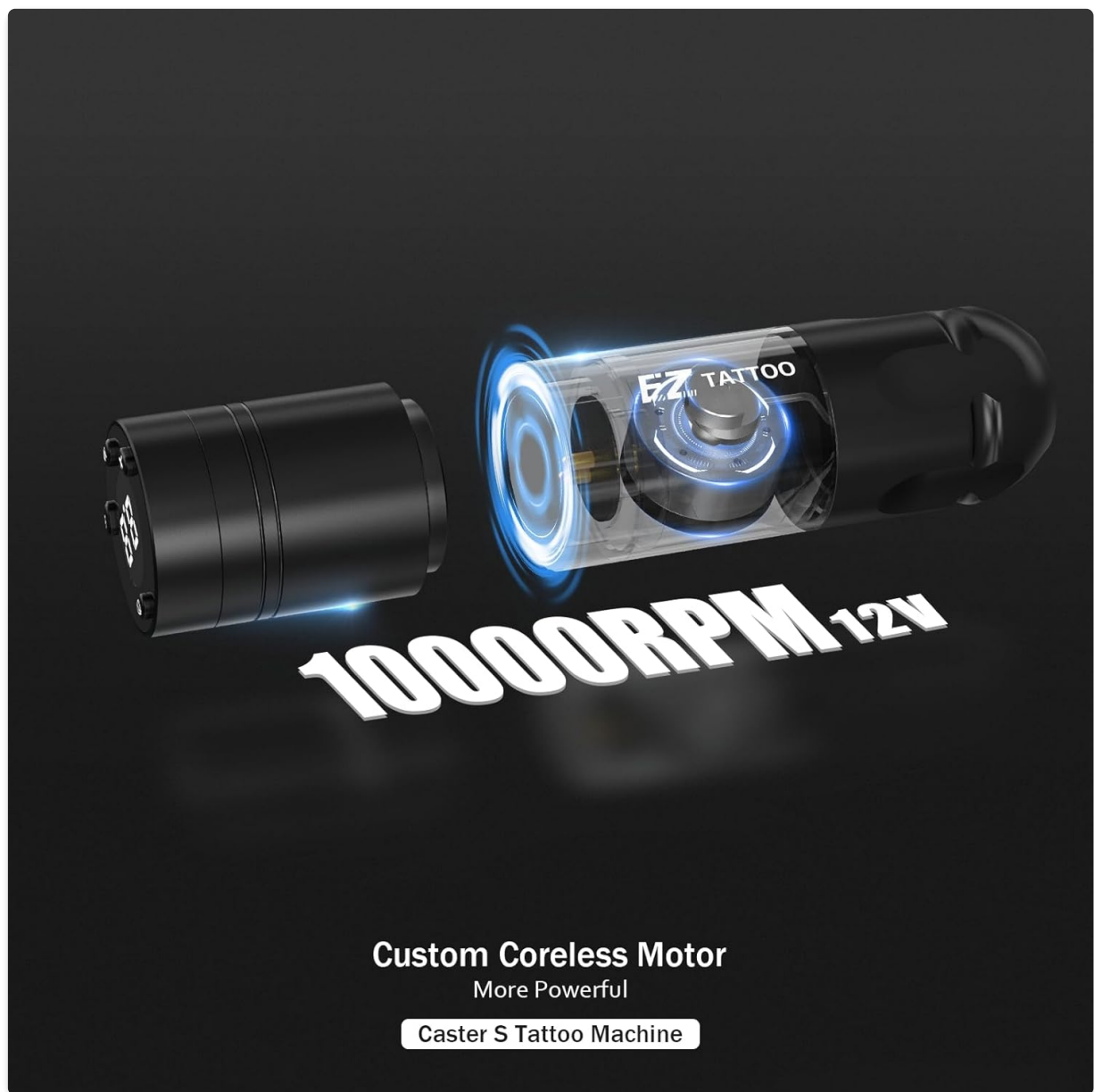
Image 3: Internal view illustrating the custom coreless motor, emphasizing its power.