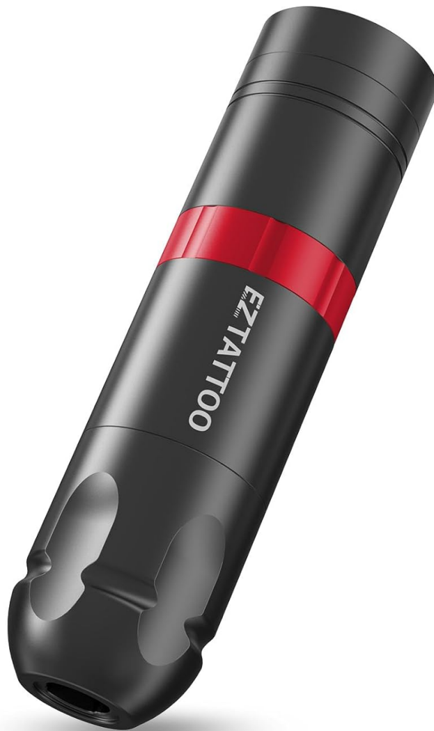
Image 1: The EZTAT2 Caster S Wireless Rotary Tattoo Machine, showcasing its sleek design.