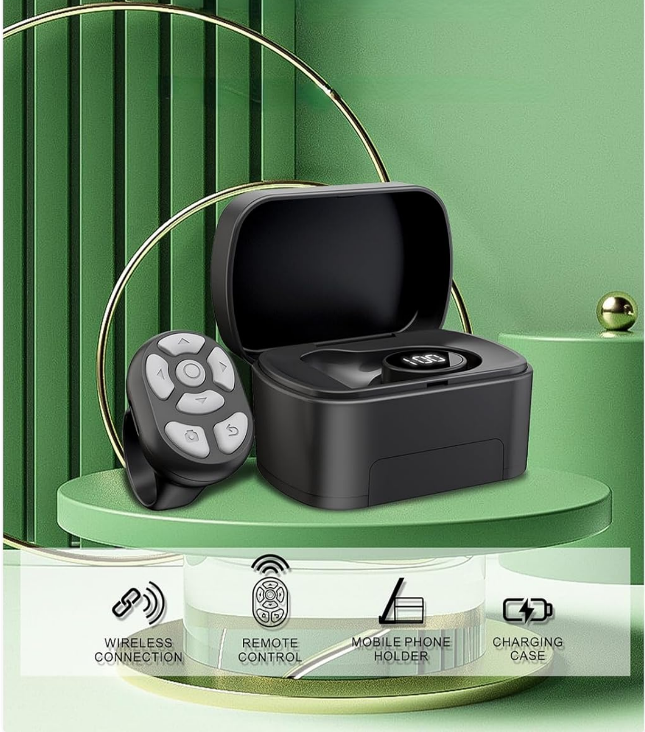
Image: The Yoidesu Bluetooth Remote Control Page Turner and its charging case.

Remote control of various applications, freeing your hands