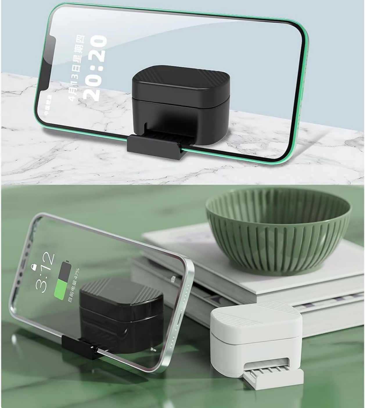
Image: The remote control and charging case displayed with various smartphones and tablets, demonstrating broad compatibility.

Sophisticated design, simplicity, convenience and speed