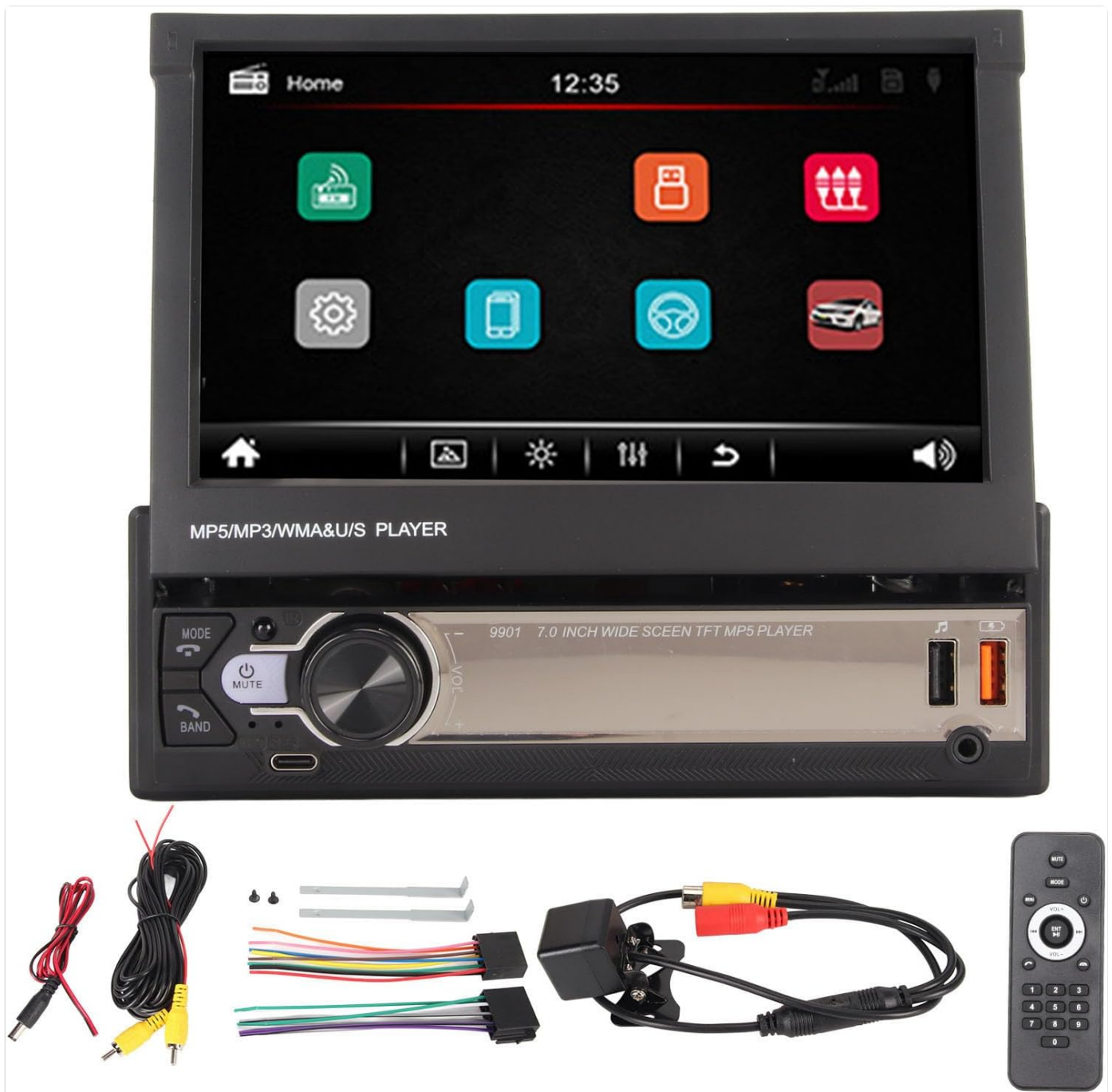
Figure 2.1: The car MP5 player with its screen extended, shown alongside all included accessories: wiring harnesses, remote control, and the reversing camera.