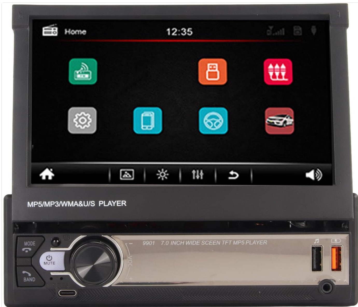
Figure 1.1: Front view of the Topiky Car MP5 Player with the screen extended, displaying the home interface.