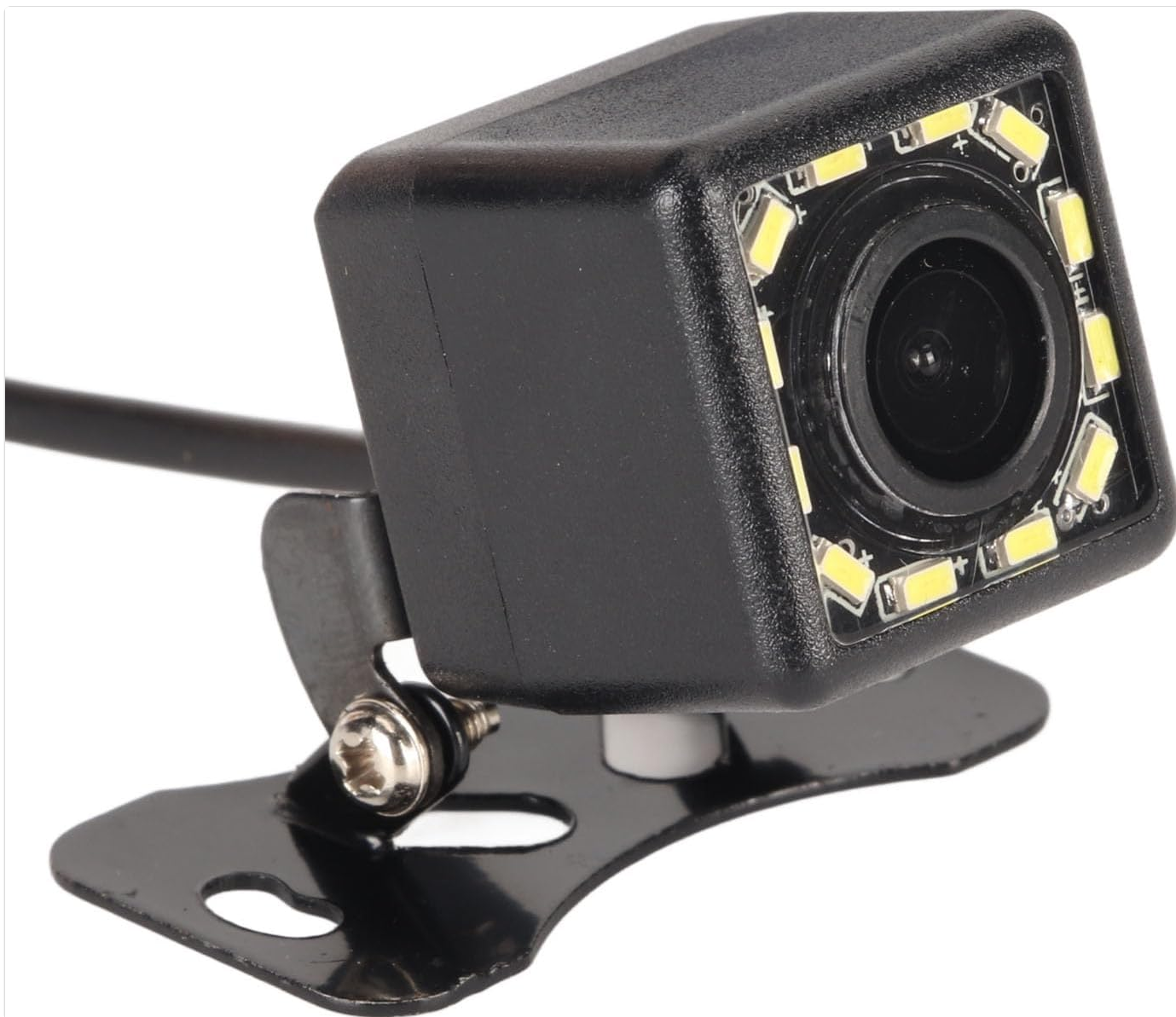
Figure 3.4: Close-up view of the included 12-LED reversing camera.