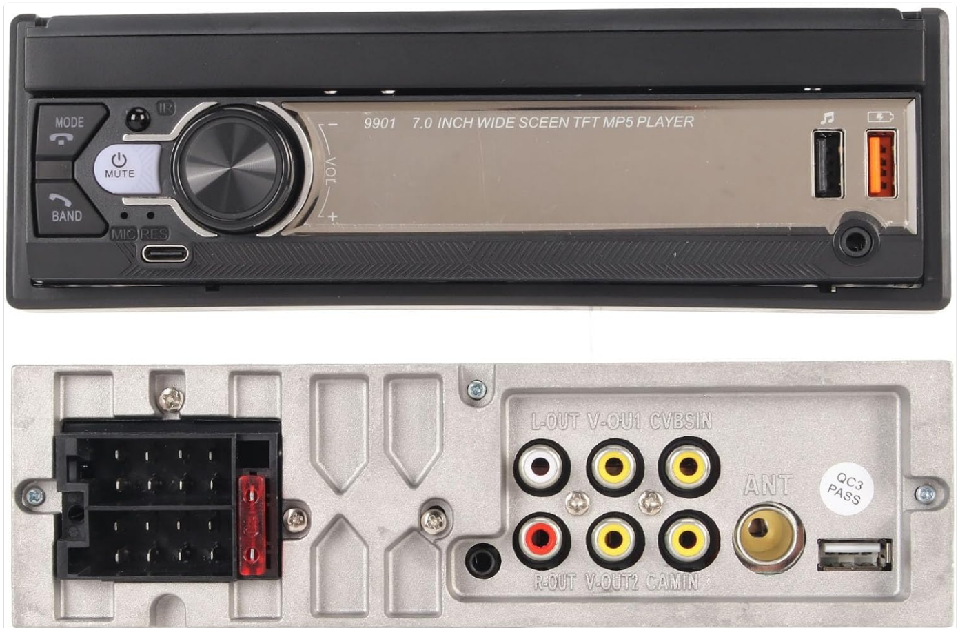
Figure 3.3: Front view of the car MP5 player with the screen retracted, and a separate image of the rear panel showing all connection ports.