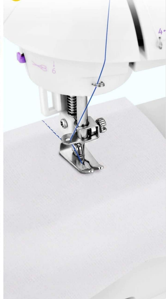
Image: Demonstration of the machine's capability to sew straight lines, illustrating its performance on both thick (4-layer cloth) and thin (silk-like) fabrics.