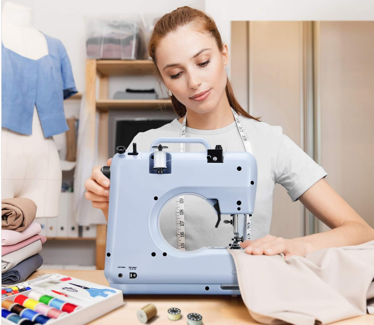
Image: User demonstrating the Magicfly Mini Sewing Machine in use, highlighting its compact size and ease of operation.

Perfect for many sewing projects and play your imagination.