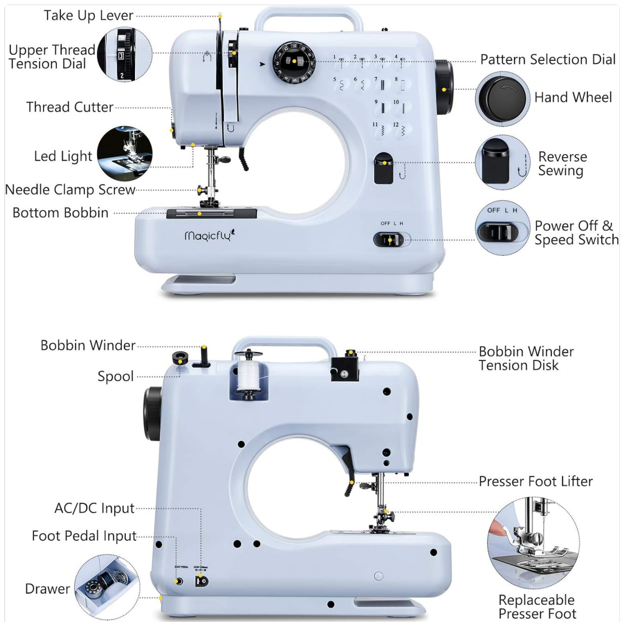
Image: Detailed diagram illustrating the various components of the Magicfly Mini Sewing Machine, including the take-up lever, tension dial, thread cutter, LED light, needle clamp screw, bobbin winder, and power/speed switch.