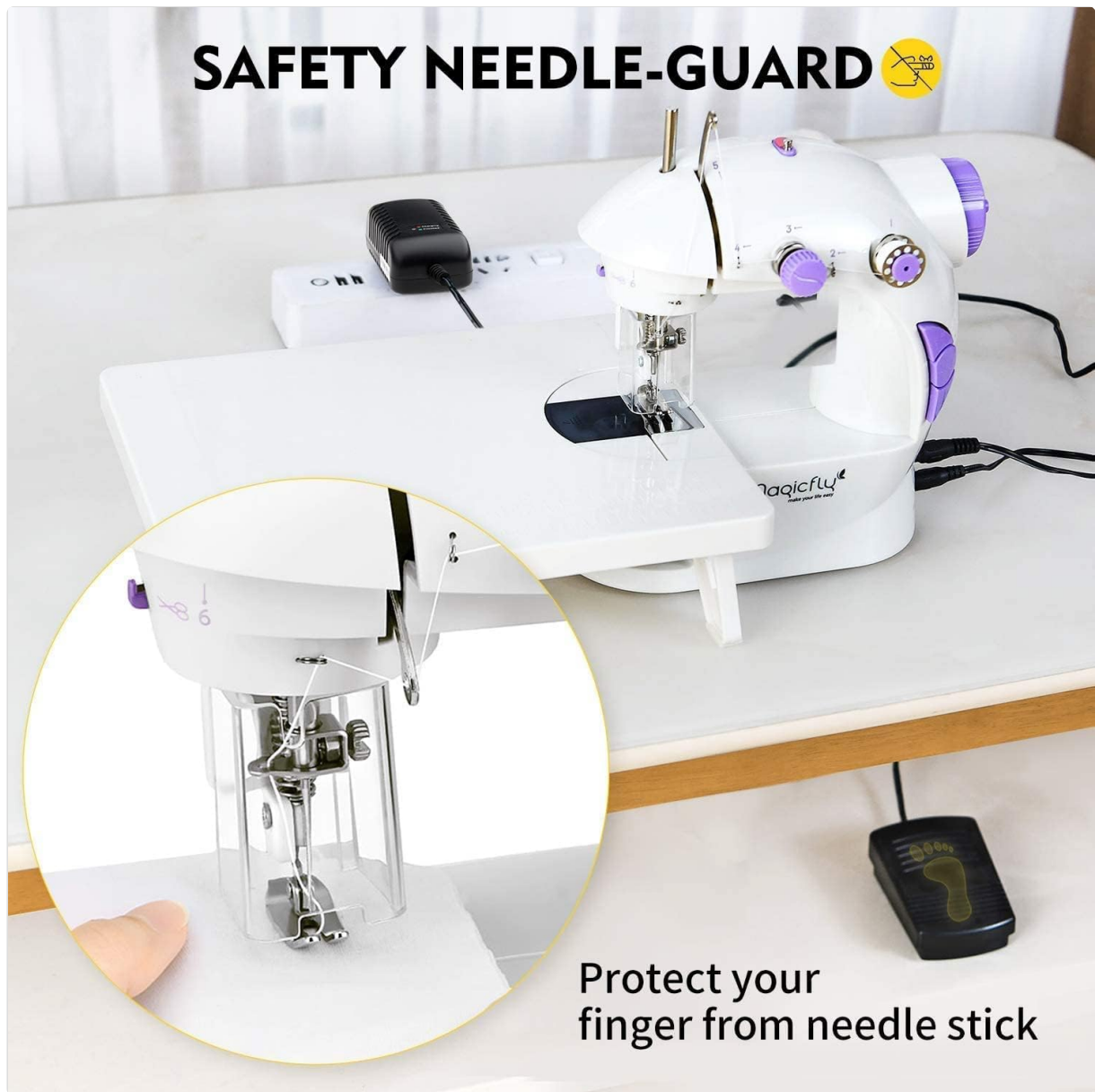
Image: The safety needle guard feature, designed to protect fingers from accidental contact with the needle during sewing.