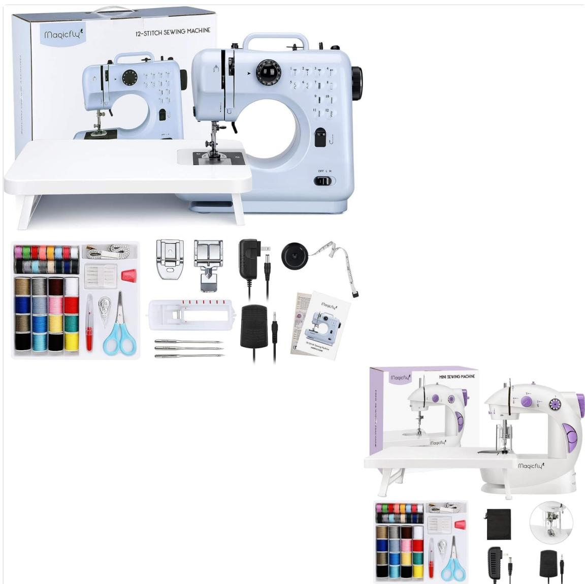
Image: The Magicfly Mini Sewing Machine shown with its extension table properly attached, illustrating the expanded work area.

Align the pegs on the extension table with the corresponding holes on the sewing machine's free arm. Gently push to secure the table in place. This provides a larger work surface for bigger projects.