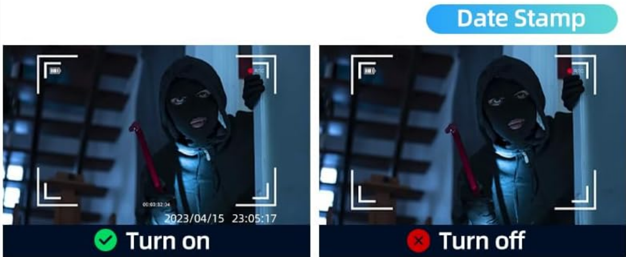
Figure 7: Loop recording ensures continuous operation, and a date stamp provides crucial time information on recordings.