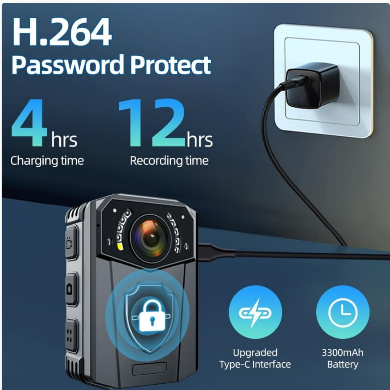
Figure 4: Charging the CAMMHD Z3 Body Camera and its battery performance.

The CAMMHD Z3 Body Camera features a built-in 3300mAh battery. Connect the camera to the provided charger using the Type-C data cable. A full charge takes approximately 4 hours. The camera can record continuously for about 12 hours (at 1080P with the screen off) on a full charge.