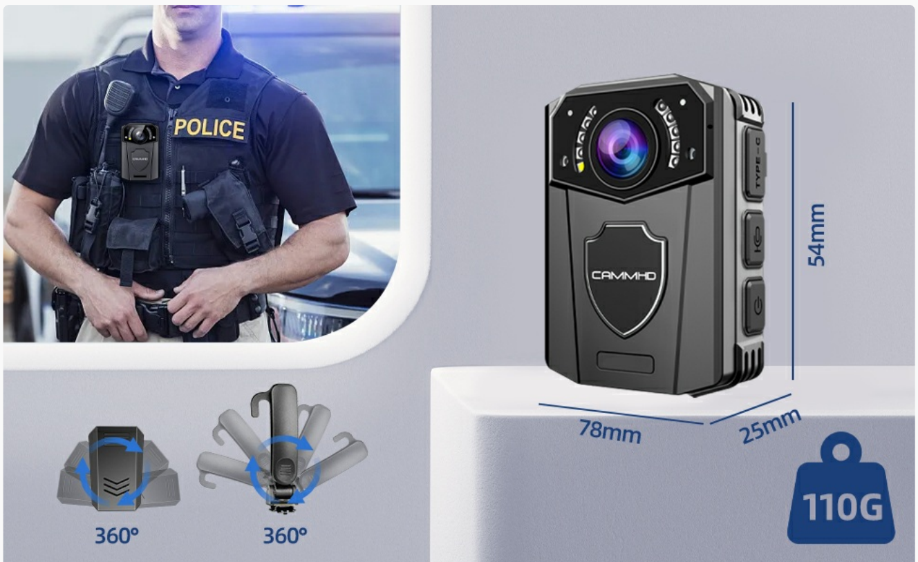
Figure 1: Overview of CAMMHD Z3 Body Camera features including 1440P video, H.264 encoding, 12-hour recording, night vision,

The CAMMHD Z3 is a high-performance body camera designed for reliable audio and video recording. It features 1440P video quality, night vision capabilities, and a robust 3300mAh battery for extended operation. With its compact design and versatile clips, it is suitable for various applications requiring portable and secure recording.