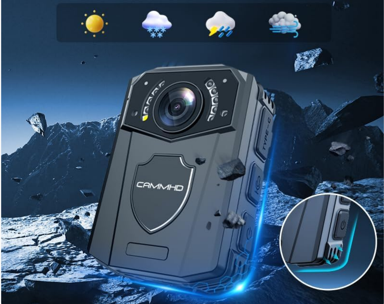
Figure 10: The CAMMHD Z3 is built with water resistance and drop resistance for durability.