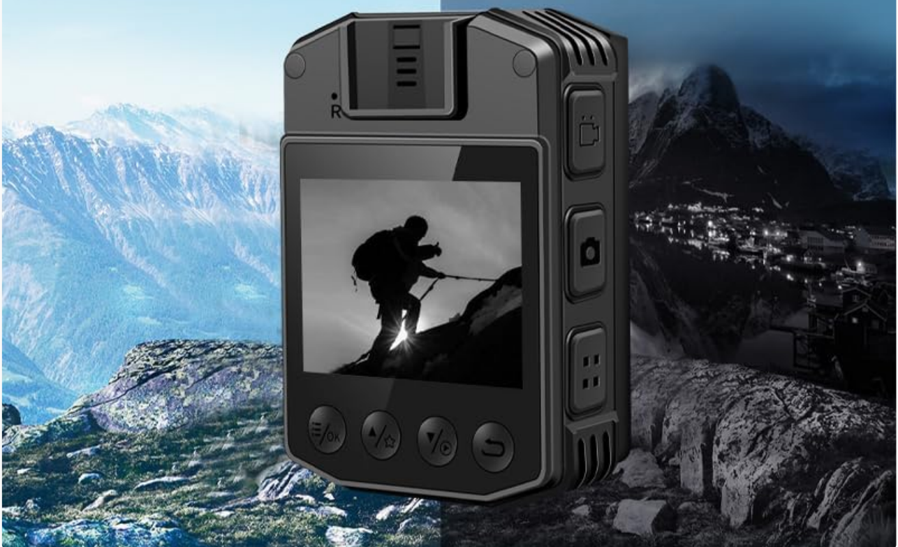
Figure 6: The CAMMHD Z3 offers 1440P HD video recording and flexible night vision options.