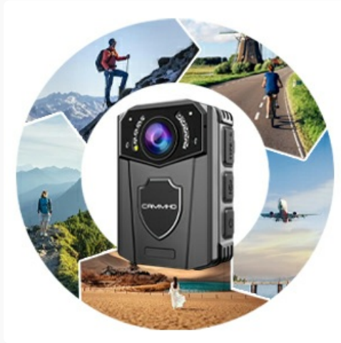
Figure 2: The CAMMHD Z3 Body Camera is versatile for multiple scenarios, including outdoor activities and professional use.