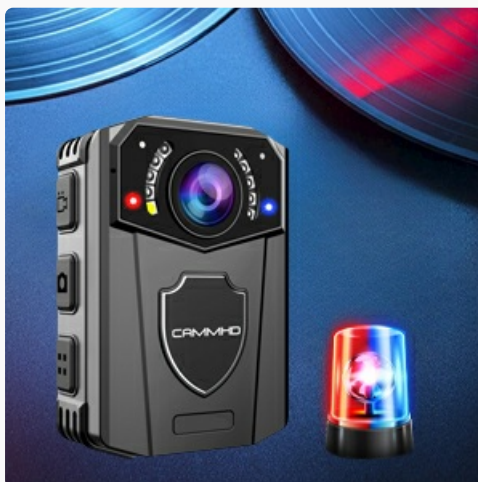
Figure 8: The CAMMHD Z3 features red and blue warning lights for enhanced visibility and signaling.