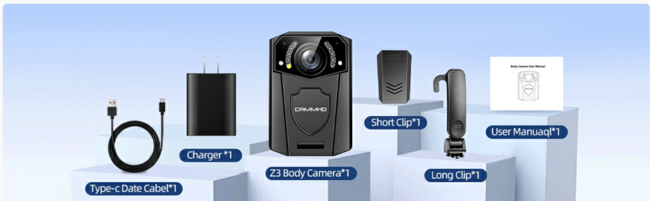
Figure 3: All components included in the CAMMHD Z3 Body Camera package.