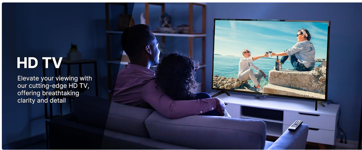
Figure 4.5: Elevate Your Viewing with HD TV.

A couple enjoying content on the Emerson TV, illustrating the breathtaking clarity and detail offered by its HD display, perfect for home entertainment.