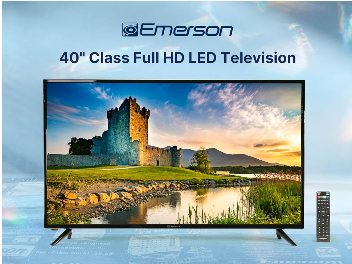
Figure 3.1: Front view of the Emerson ET-4000 TV with stand attached.

This image shows the sleek front profile of the Emerson ET-4000 TV, highlighting its slim bezels and the included stand for tabletop placement.