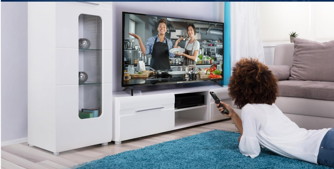
Figure 4.4: LED Backlighting for Vivid Colors.

Simplify your entertainment experience with the ultimate full-featured remote control