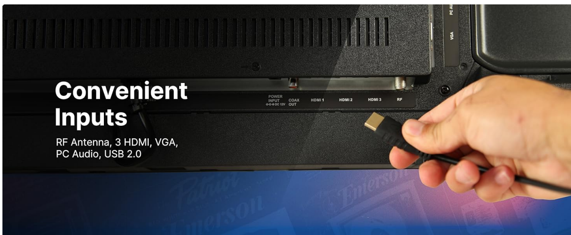
Figure 3.4: Convenient Input Ports.

A close-up view of a hand connecting an HDMI cable to one of the multiple HDMI inputs on the back of the Emerson TV, illustrating ease of device connection.