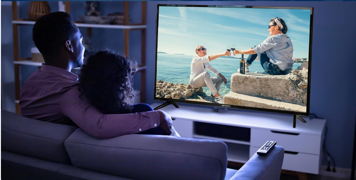
Figure 4.3: Full HD 1080p Resolution.

Elevate your viewing with our cutting-edge HD TV, offering breathtaking clarity and detail