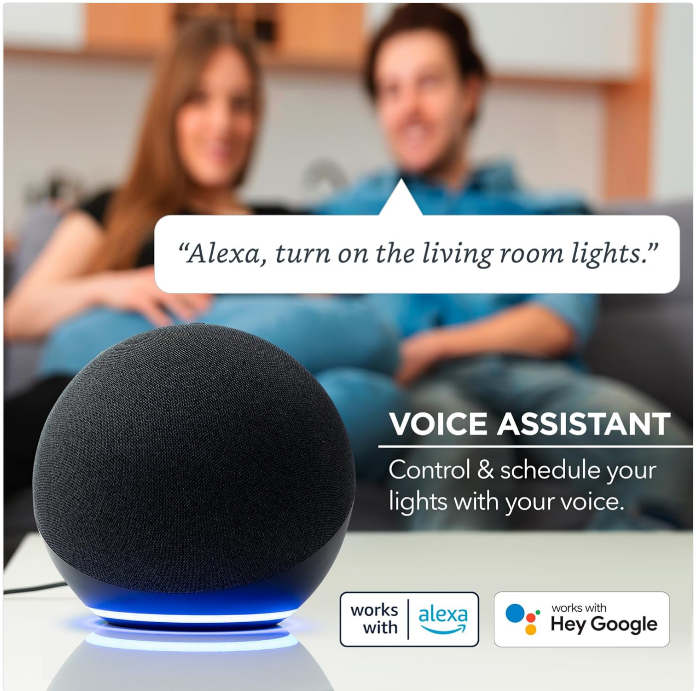
Image: Demonstrating voice control with Amazon Alexa.