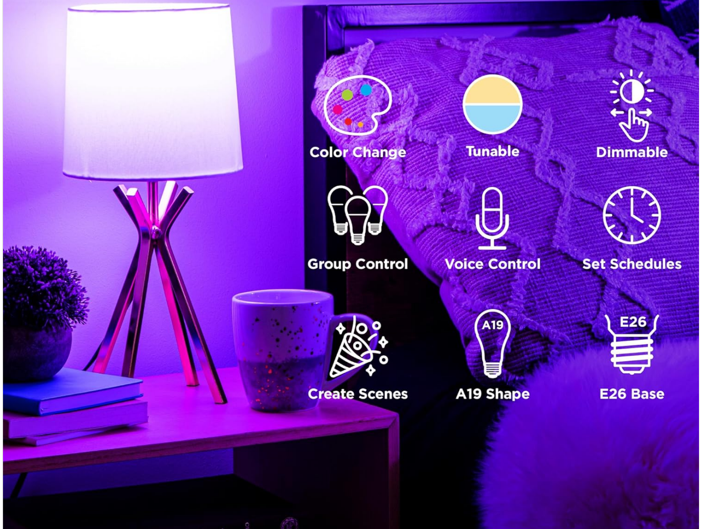
Image: Overview of the Merkury Smart A19 bulb's key functionalities.

Accent your space with bright multicolor LED light bulbs. Add color and vibrancy to any room!