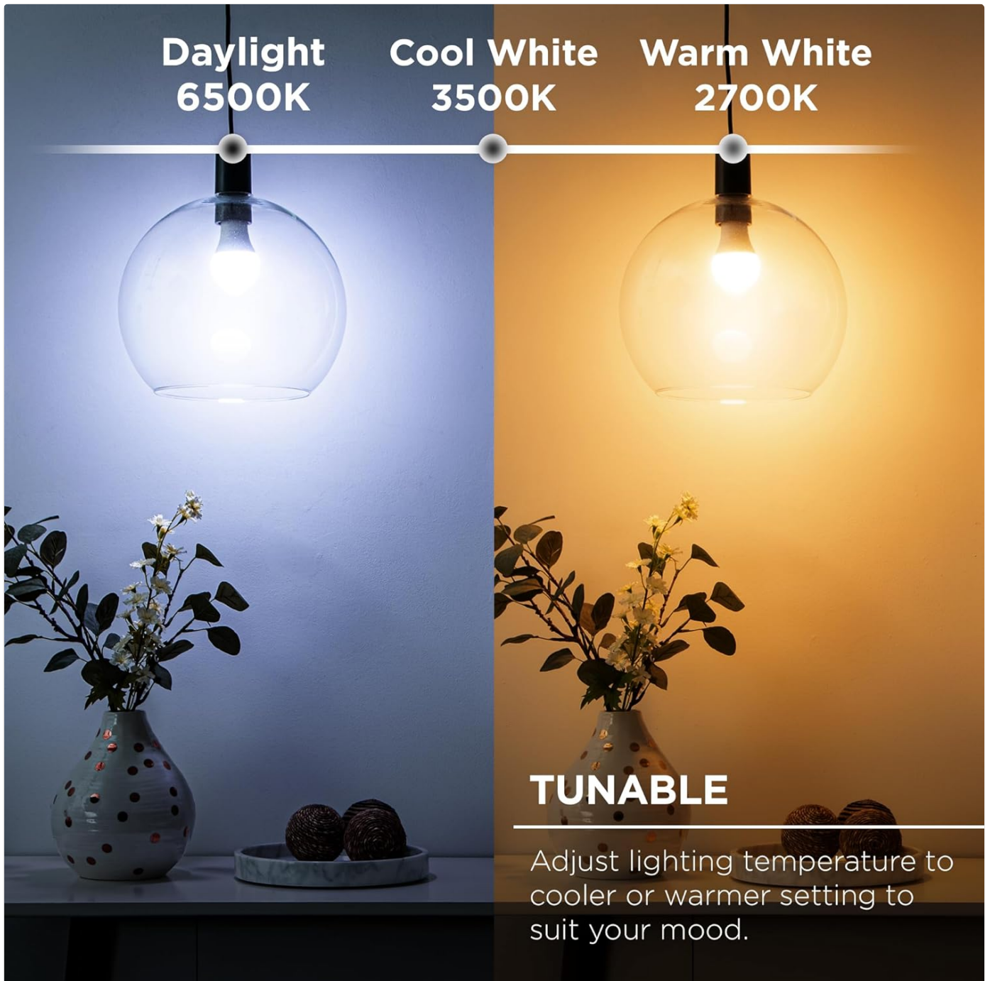
Image: Illustrating the tunable white light feature.