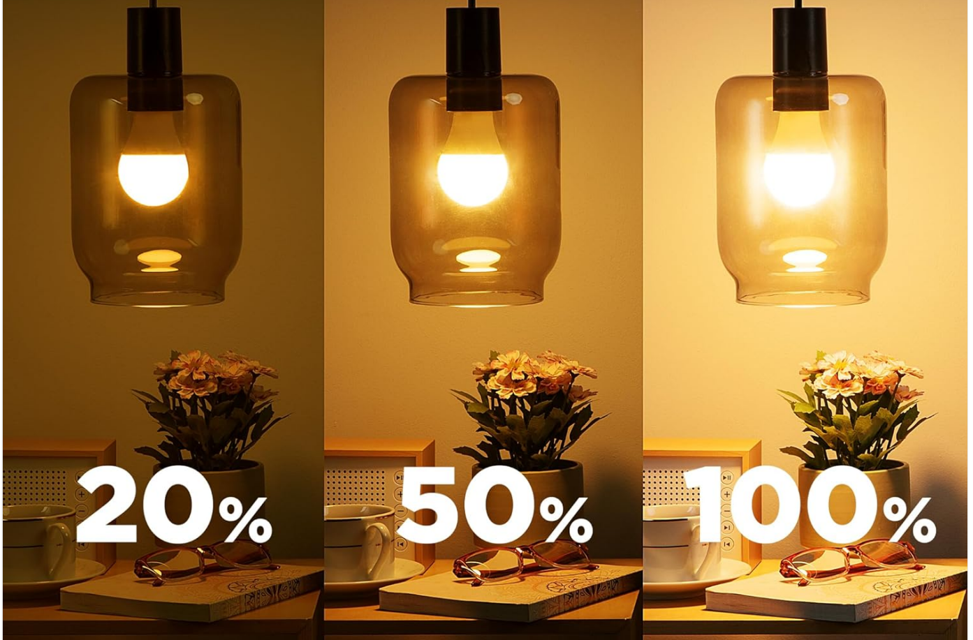
Image: Visual representation of the dimmable feature at various brightness levels.

Adjust the brightness from 1% to 100% conveniently for the perfect mood.