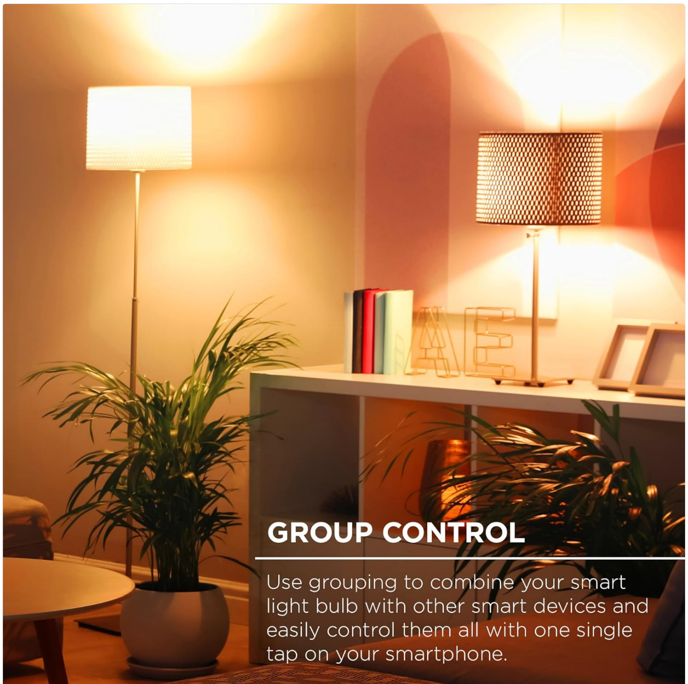
Image: Example of group control for multiple smart light bulbs.