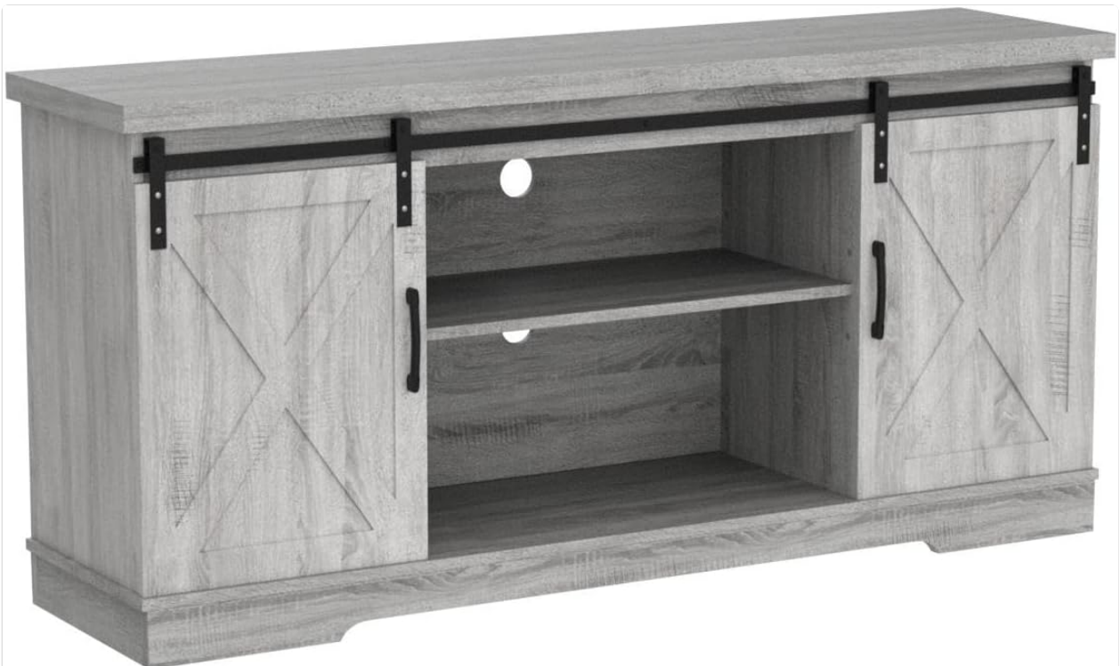
Image: Detailed dimensions of the TV stand (59" L x 15.7" W x 27.6" H) and weight capacities (300 lbs for top, 25 lbs for shelves).