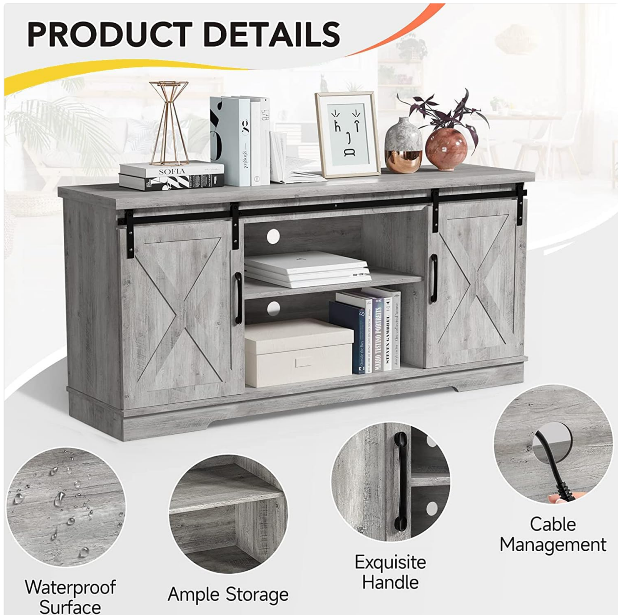
Image: Overview of product features, including the waterproof surface, which simplifies cleaning and maintenance.