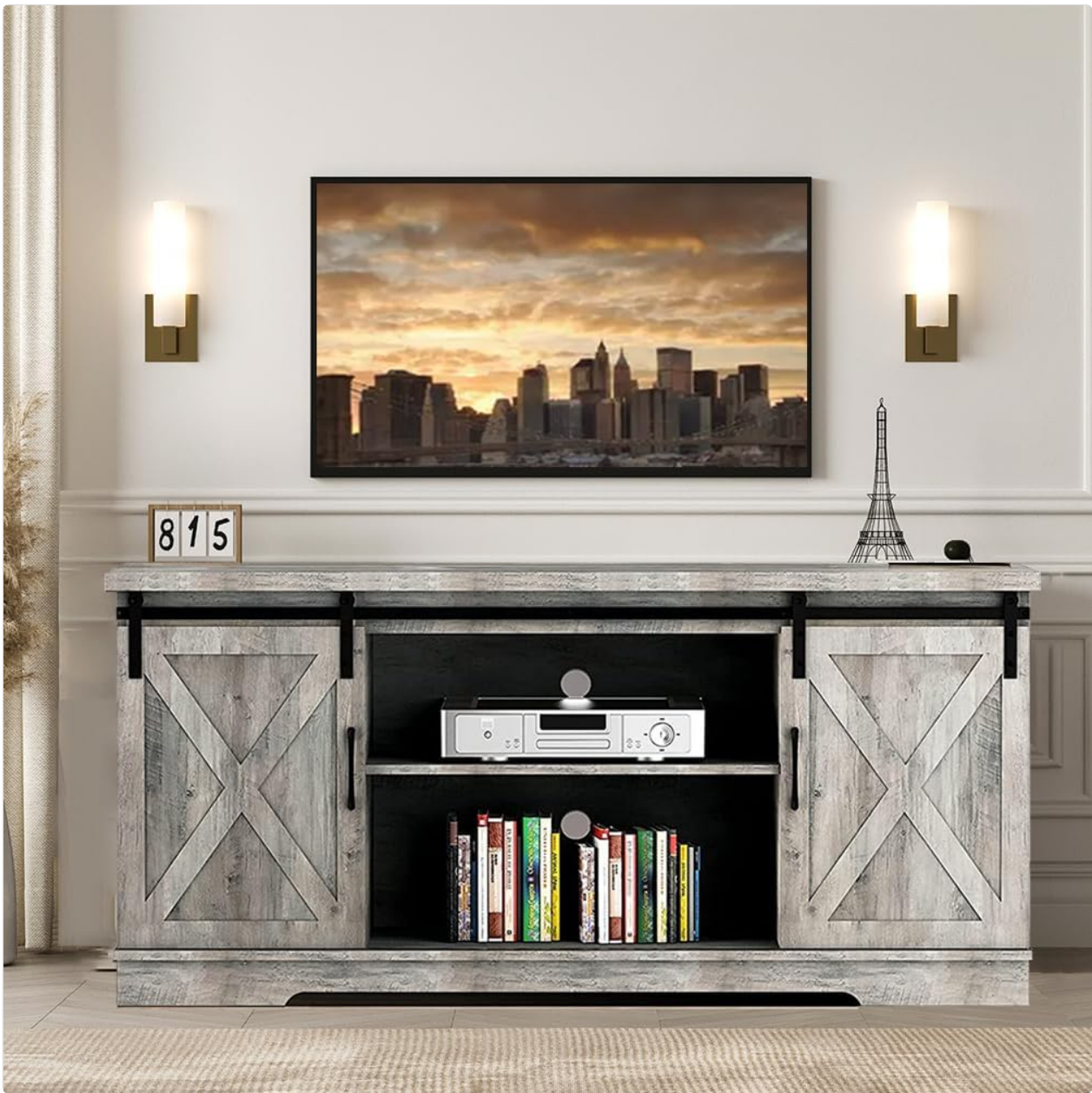
Image: The GAOMON Farmhouse TV Stand (Model JTV-001) featuring a grey finish and barn doors, suitable for TVs up to 65 inches.