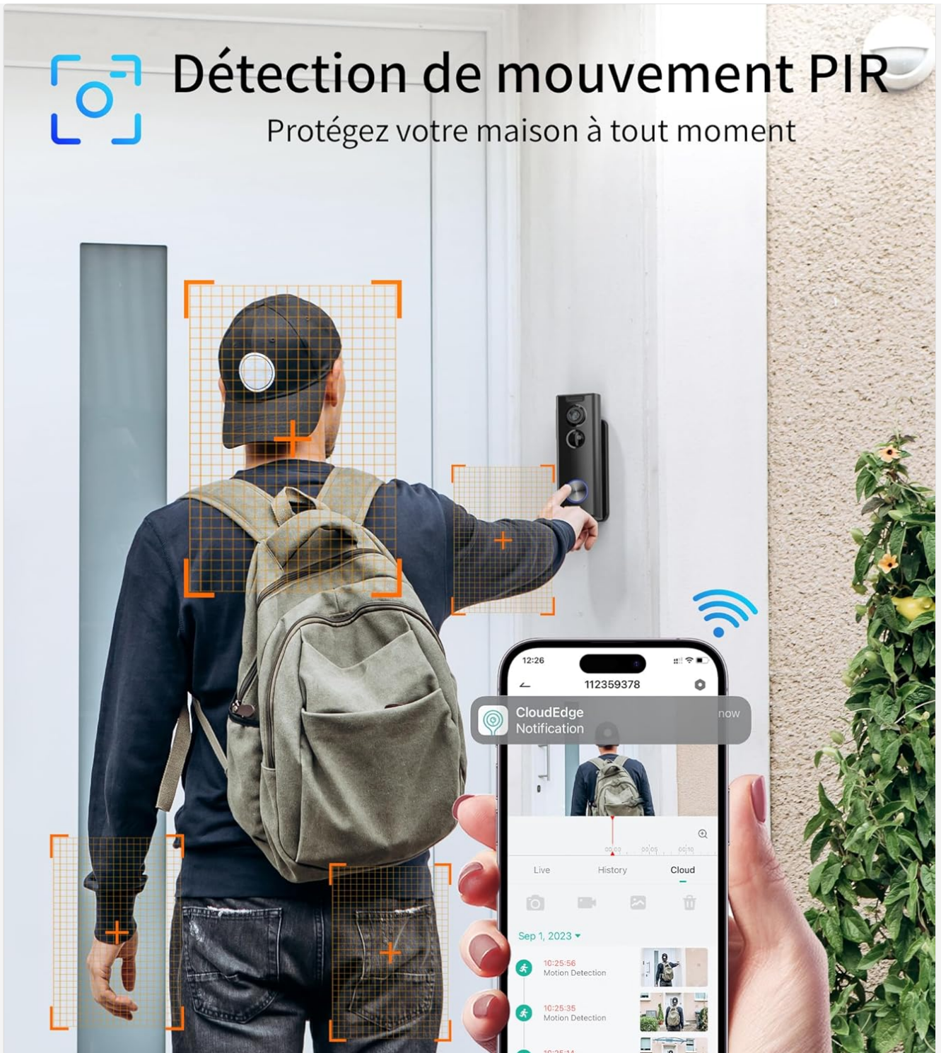
Image: A person approaching a door with the Ankway J10 Video Doorbell, illustrating the PIR motion detection feature and a smartphone notification from the CloudEdge app.