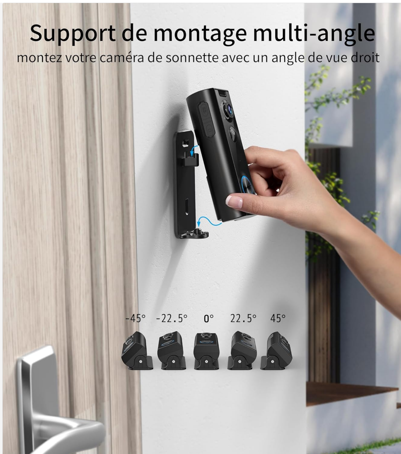
Image: Illustration of the multi-angle mounting bracket for the Ankway J10 Video Doorbell, showing adjustable angles from -45° to +45°.

montez votre caméra de sonnette avec un angle de vue droit