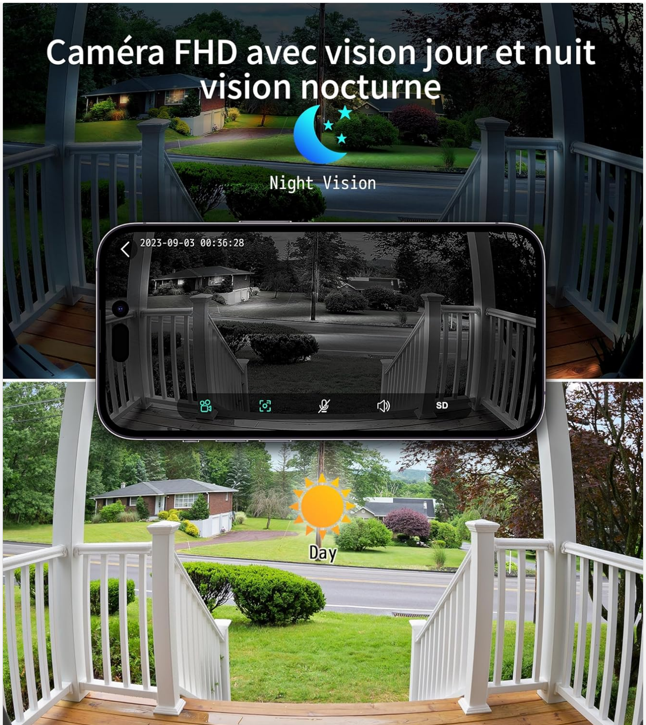
Image: A split view demonstrating the Ankway J10 Video Doorbell's day vision (color) and night vision (black and white infrared) capabilities.