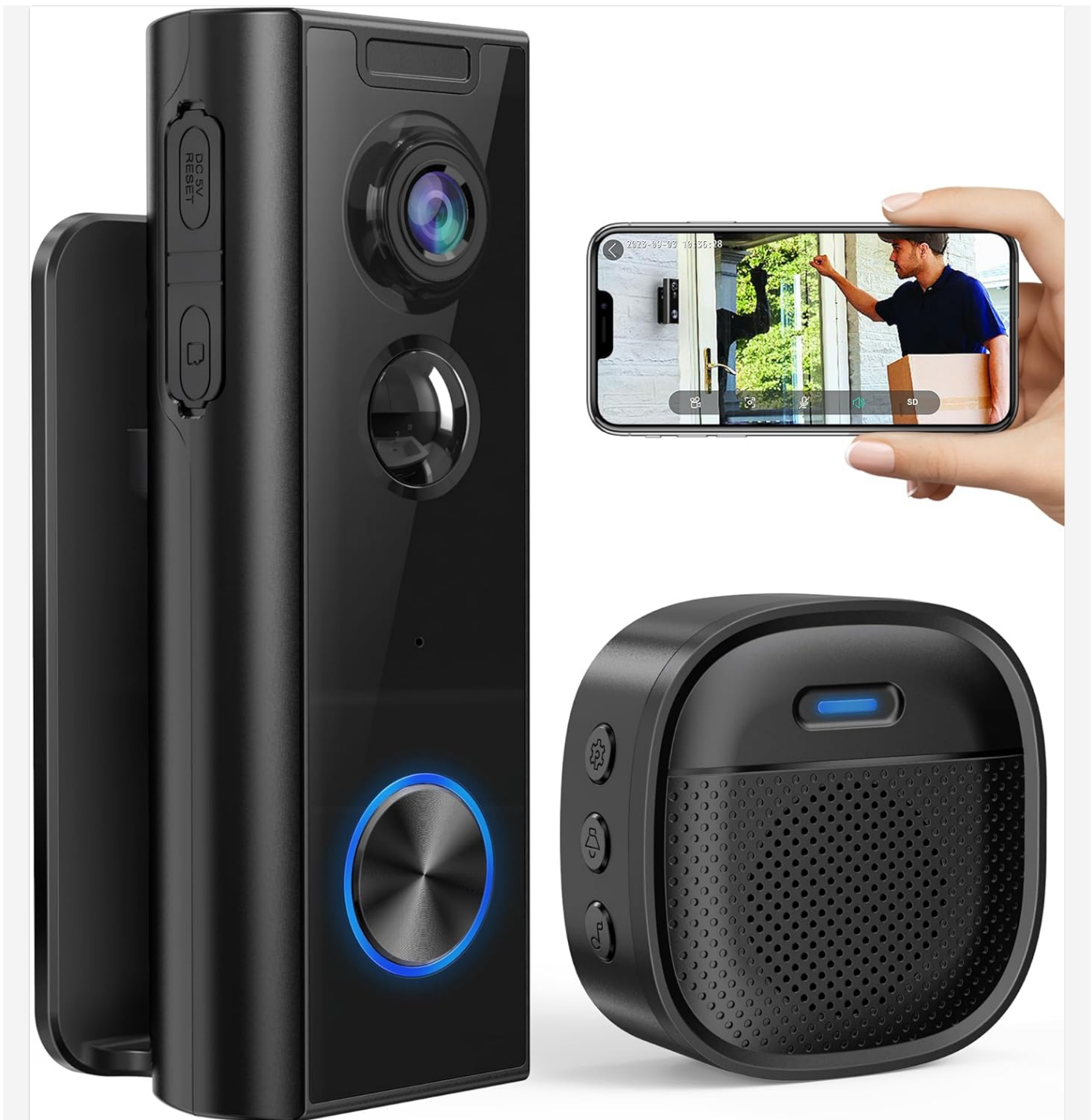
Image: The Ankway J10 Wireless Video Doorbell unit, its accompanying wireless chime, and a smartphone displaying the live video feed from the doorbell.