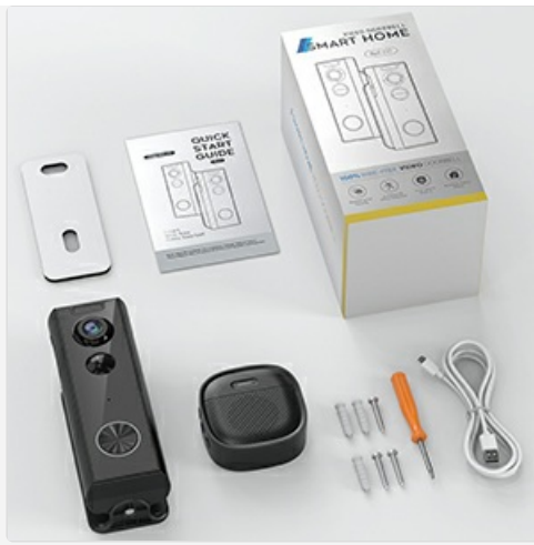
Image: Contents of the Ankway J10 Video Doorbell package, including the doorbell unit, wireless chime, charging cable, mounting hardware, and quick start guide.