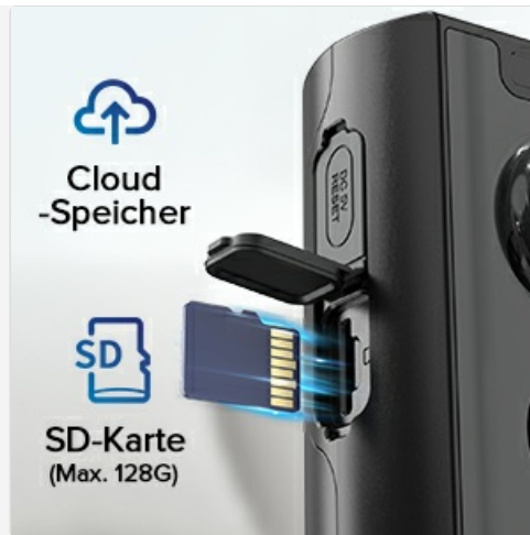
Image: A close-up of the Ankway J10 Video Doorbell showing the slot for a microSD card (up to 128GB) and icons representing cloud storage.