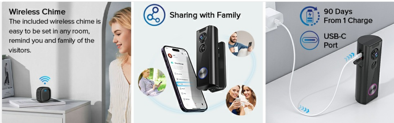
Image: The Ankway J10 Video Doorbell being charged via a USB-C port, highlighting its rechargeable battery feature.