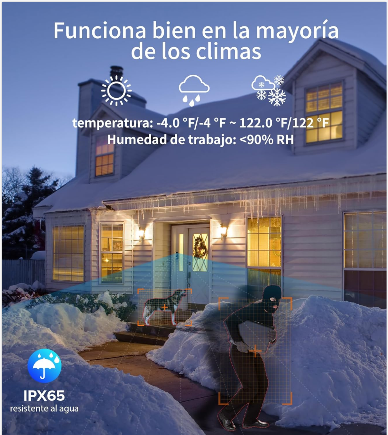
Image: The Ankway J10 Video Doorbell installed on a house during winter, demonstrating its IP65 weatherproof rating and ability to function in temperatures from -4°F to 122°F.

The Ankway J10 is IP65 weatherproof, designed to withstand various outdoor conditions, including rain and dust. However, extreme temperatures or prolonged exposure to direct water jets should be avoided.