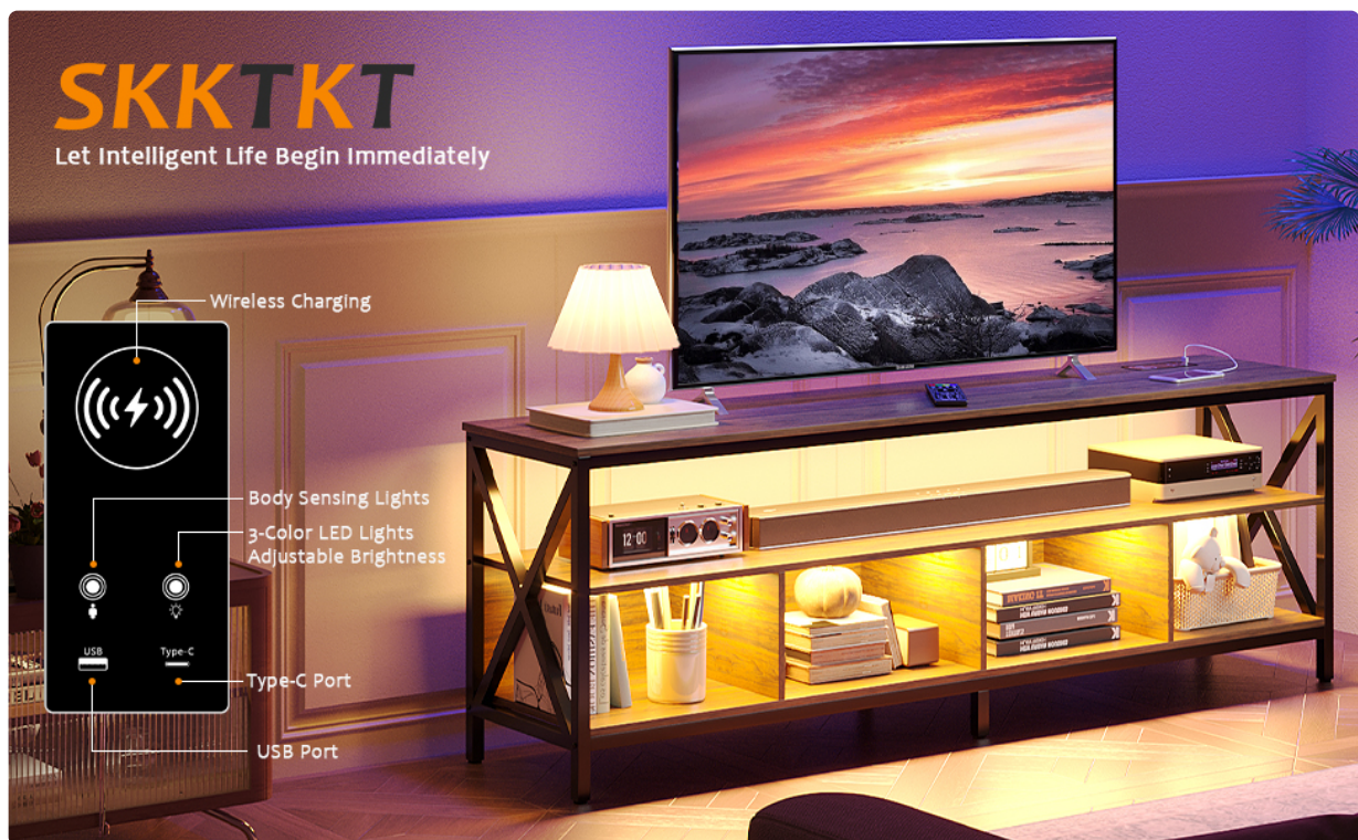
Figure 4: Smart control panel for LED lights and charging.