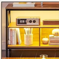
Large Open Storage Space