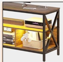
Sturdy Metal Frame