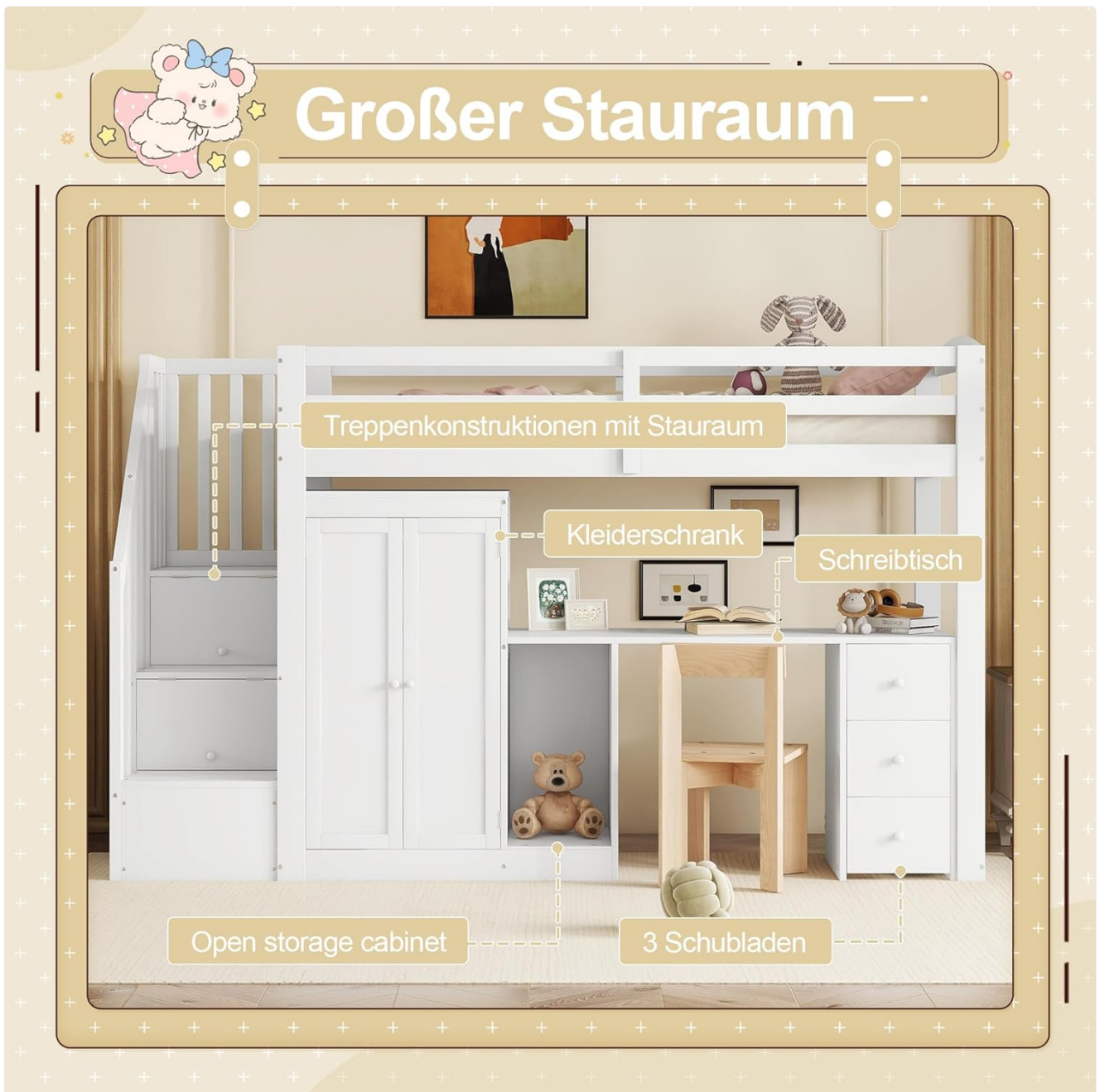
Image 3.1: An annotated diagram illustrating the various components of the Merax Loft Bed, including the staircase with storage, wardrobe, desk, open storage cabinet, and three drawers, highlighting its comprehensive storage capabilities.