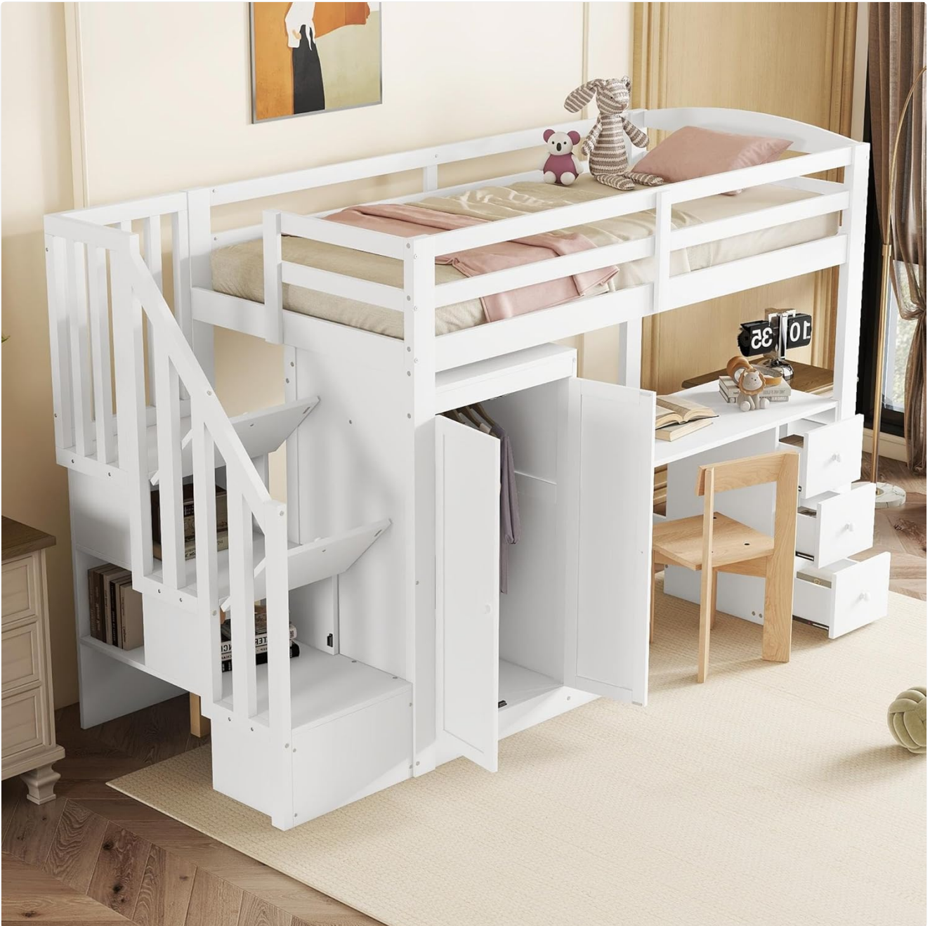
Image 4.1: A view of the Merax Loft Bed with the wardrobe doors open, revealing the hanging space, and the desk area clearly visible, demonstrating the integrated functionality for assembly reference.