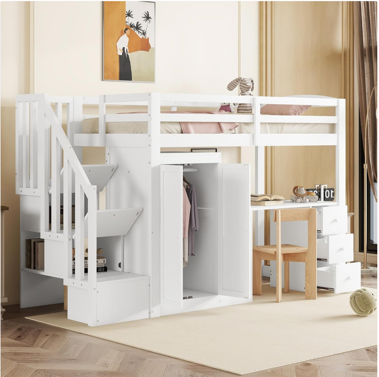
Image 5.1: This image provides another perspective of the Merax Loft Bed, showing the wardrobe with its doors open and the desk drawers pulled out, illustrating the accessibility and capacity of the storage features.