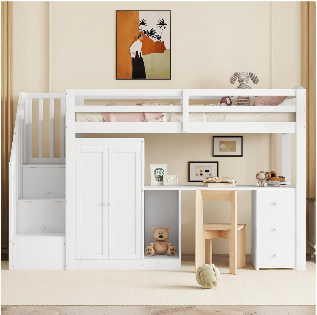
Image 1.1: The Merax Loft Bed, showcasing its integrated design with a bed platform, stairs with storage, a wardrobe, a desk, and drawers, all in a clean white finish.