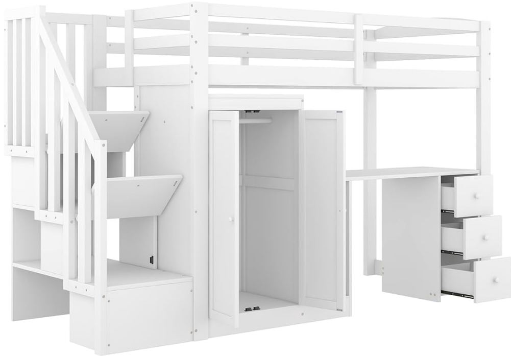
Image 2.1: This image highlights compliance with the EN 747-1:2024 safety standard, indicating the bed is designed with safety in mind, especially for families with children.