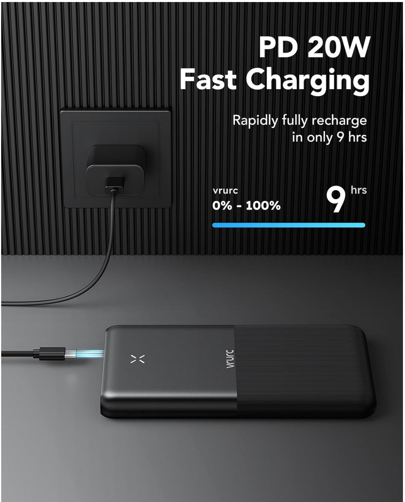
Figure 4.1: Charging the power bank using a wall adapter.