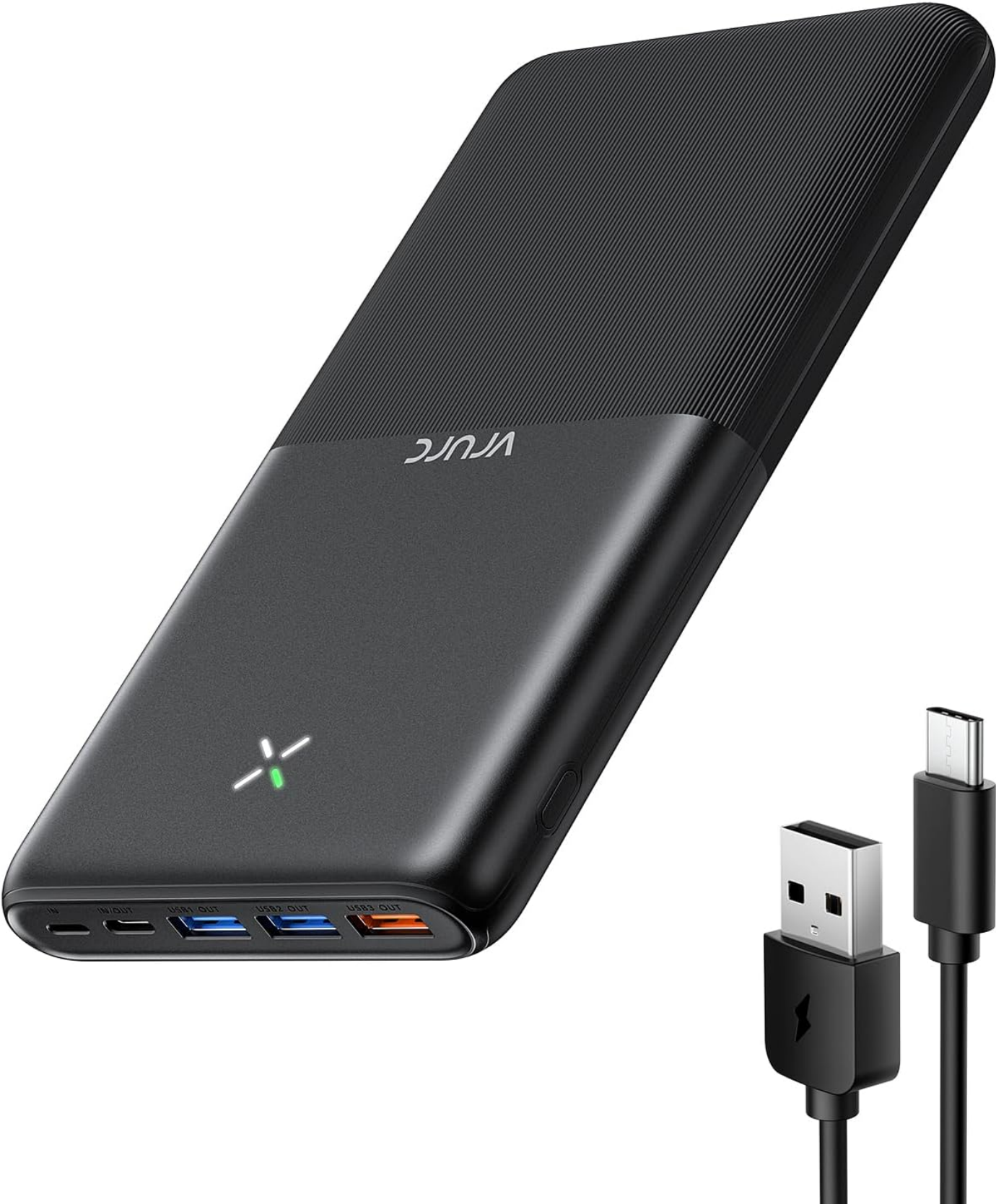
Figure 3.1: VRURC 30000mah Powerbank and included USB-C cable.