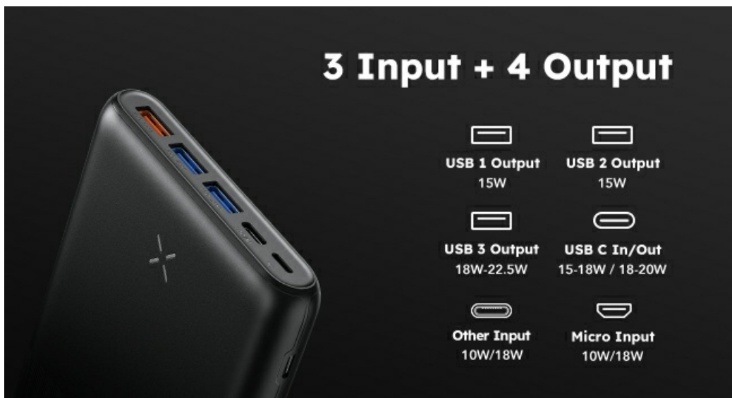
Figure 3.3: Detailed view of the power bank's input and output ports.