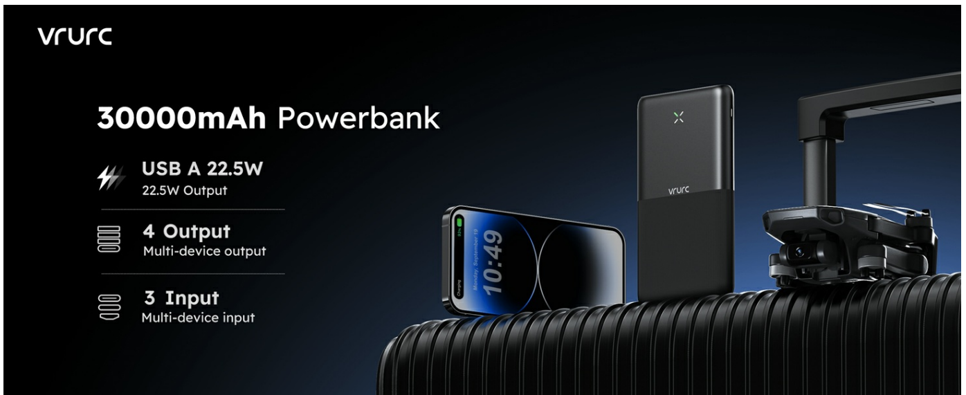
Figure 3.2: High capacity overview, illustrating multiple charges for various devices.