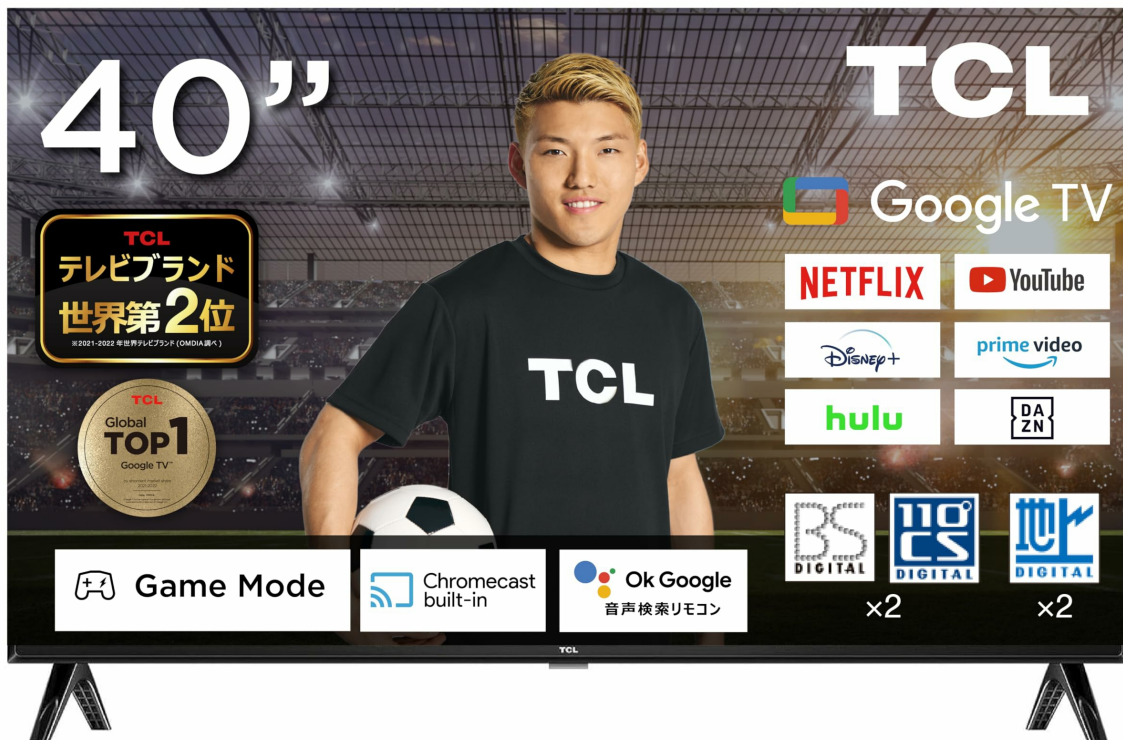
Figure 1: TCL 40L5AG 40-inch Google TV Smart Television. This image shows the front view of the television with its slim bezels and stand.