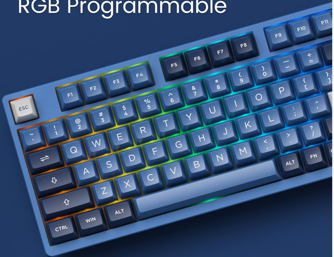
Figure 5: Customizable RGB Backlighting