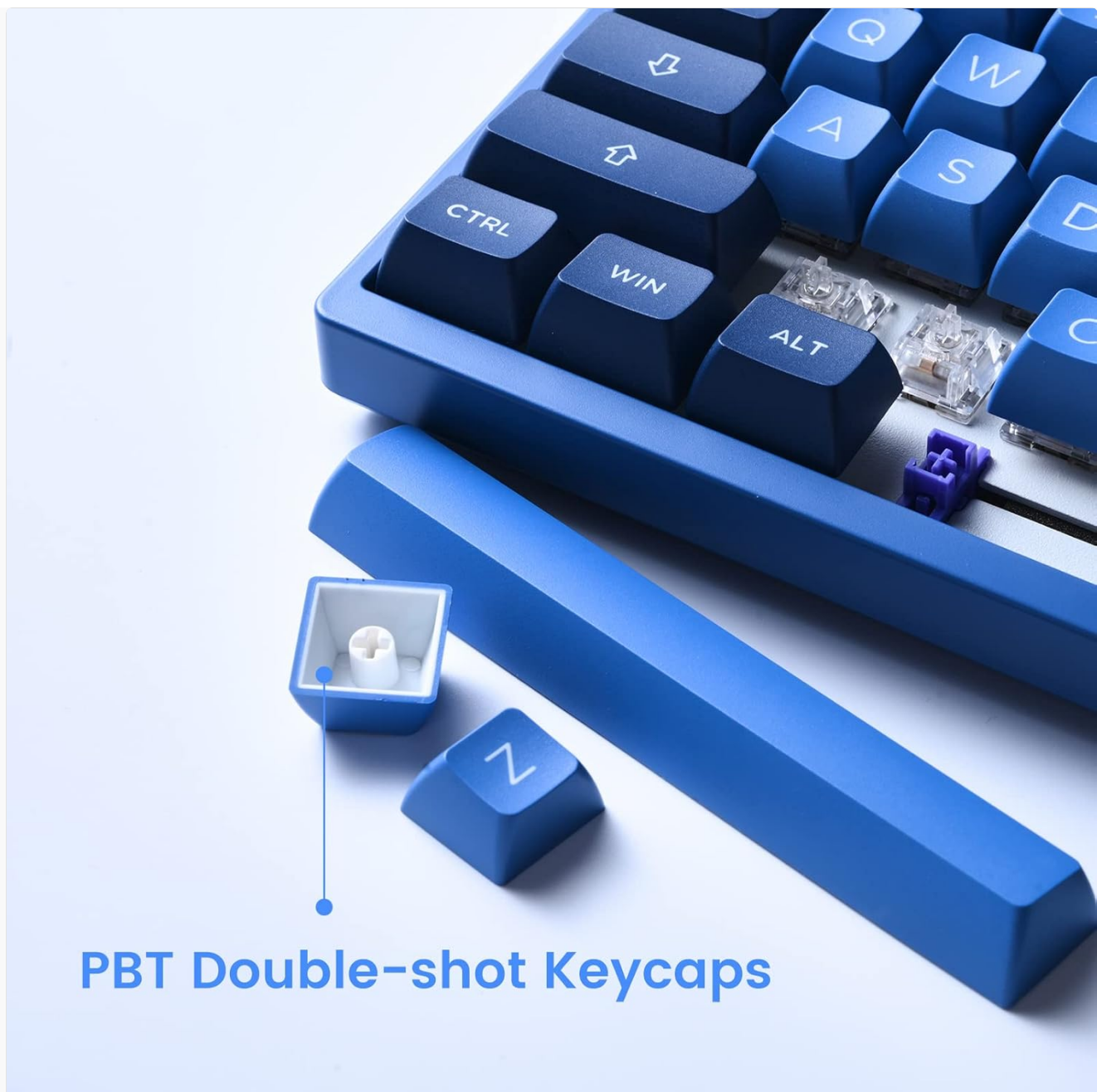
Figure 4: Durable PBT Double-shot Keycaps