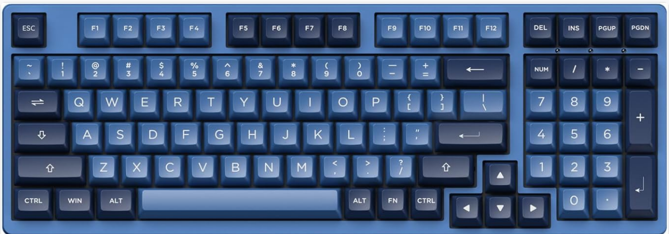
Figure 1: Akko 3098B Ocean Star Mechanical Gaming Keyboard

The Akko 3098B Ocean Star Mechanical Gaming Keyboard is a versatile and high-performance input device designed for both gaming and productivity. It features a unique Ocean Star aesthetic, multi-mode connectivity (2.4G wireless, Bluetooth 5.0, and USB-C wired), and hot-swappable switches, allowing for personalized typing experiences. This manual provides essential information for setting up, operating, and maintaining your keyboard.