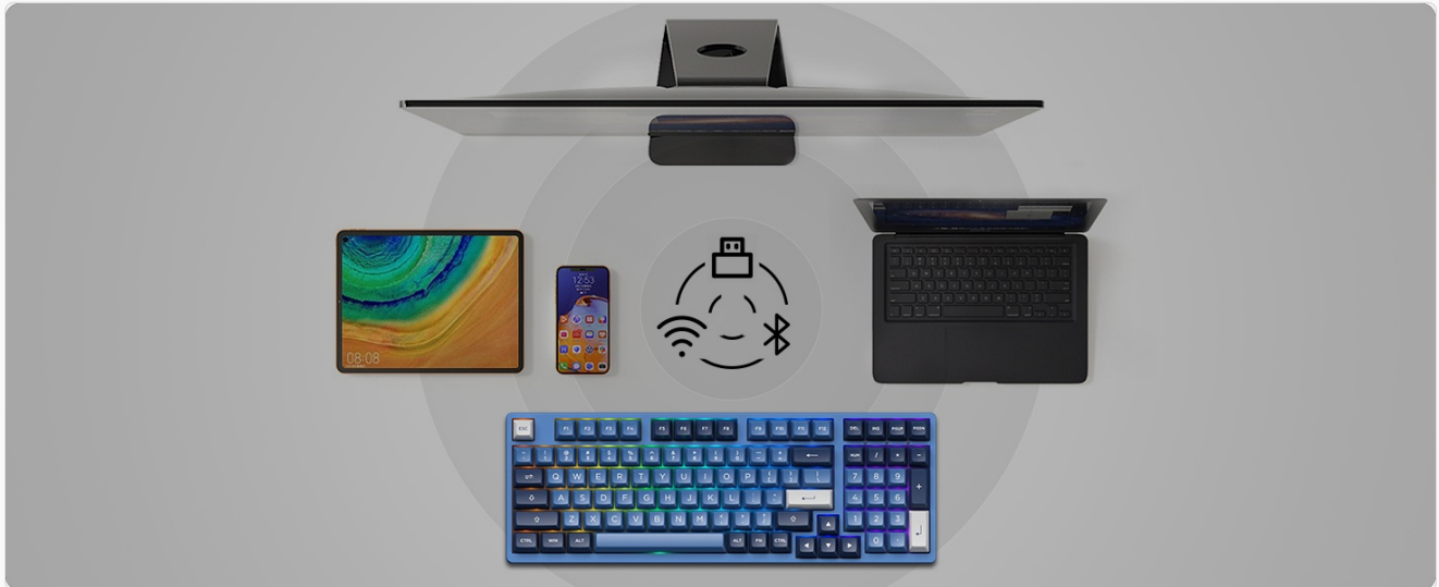
Figure 2: Multi-device connectivity options

Equipped with a Beken multi-modes controller chip, the keyboard supports three connection types: 2.4Ghz wireless, Bluetooth 5.0, and USB-C wired. This allows for seamless switching between multiple devices and operating systems.