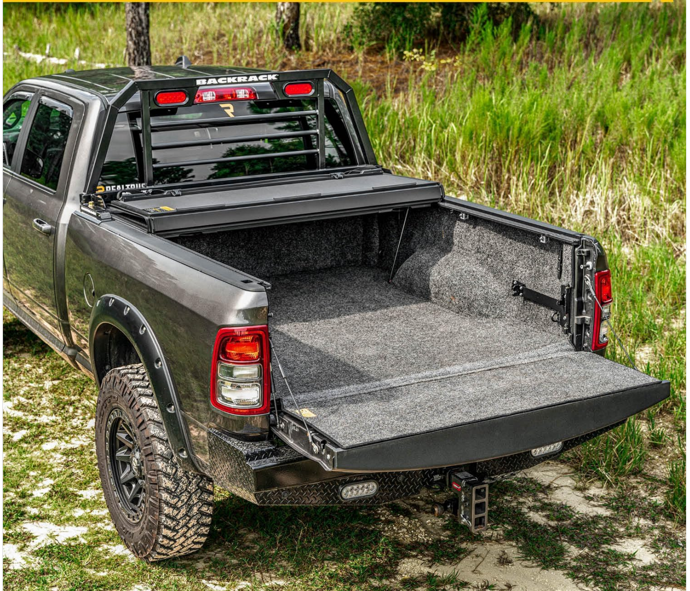
Figure 2: Tonneau cover fully extended and aligned on the truck bed.