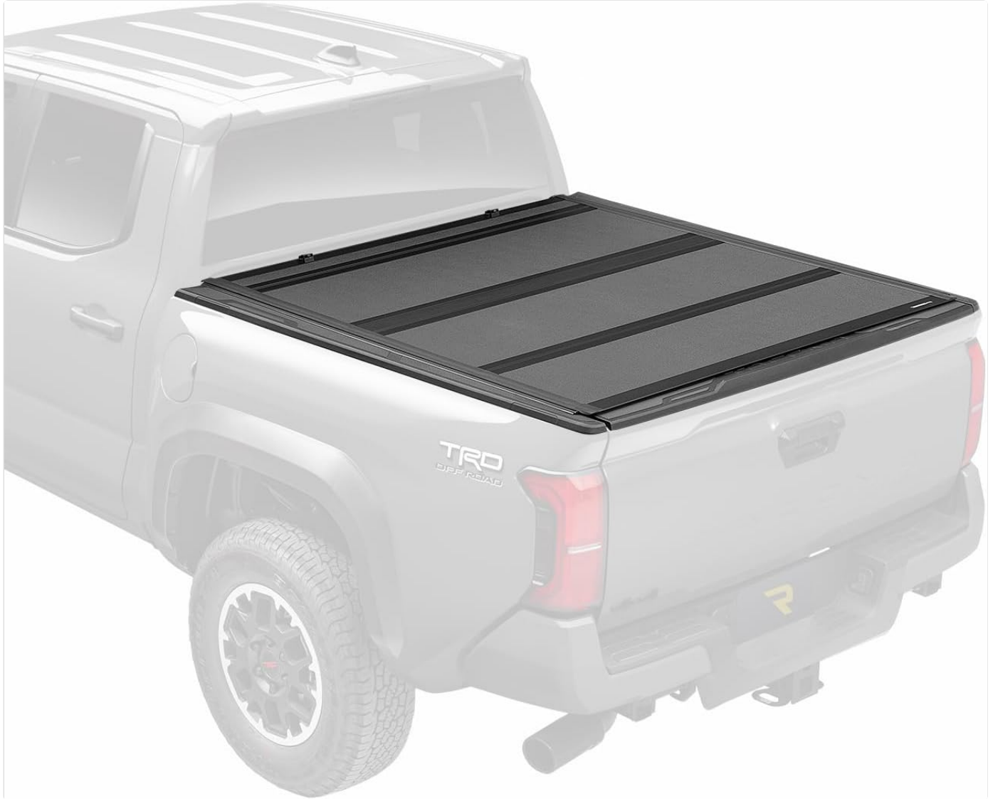
Figure 1: Extang Endure ALX Tonneau Cover positioned on a truck bed.

Carefully remove the fully assembled tonneau cover from its packaging. Place the folded cover assembly onto the truck bed rails near the cab, ensuring the buckles are facing towards the cab.