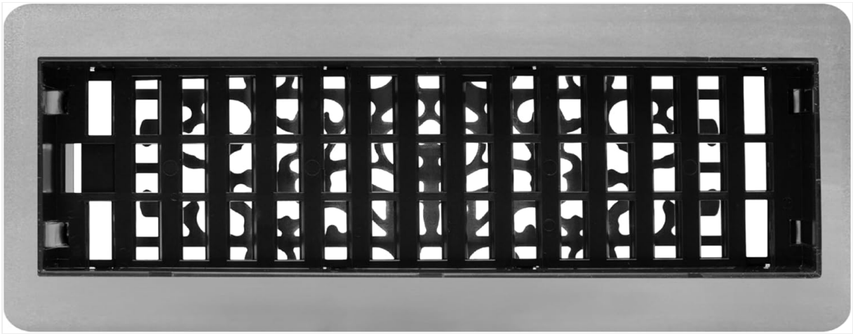
Figure 1: Top view of the Decor Grates Low Profile Floor Register installed in a wooden floor. This image illustrates how the register sits flush with the floor surface.