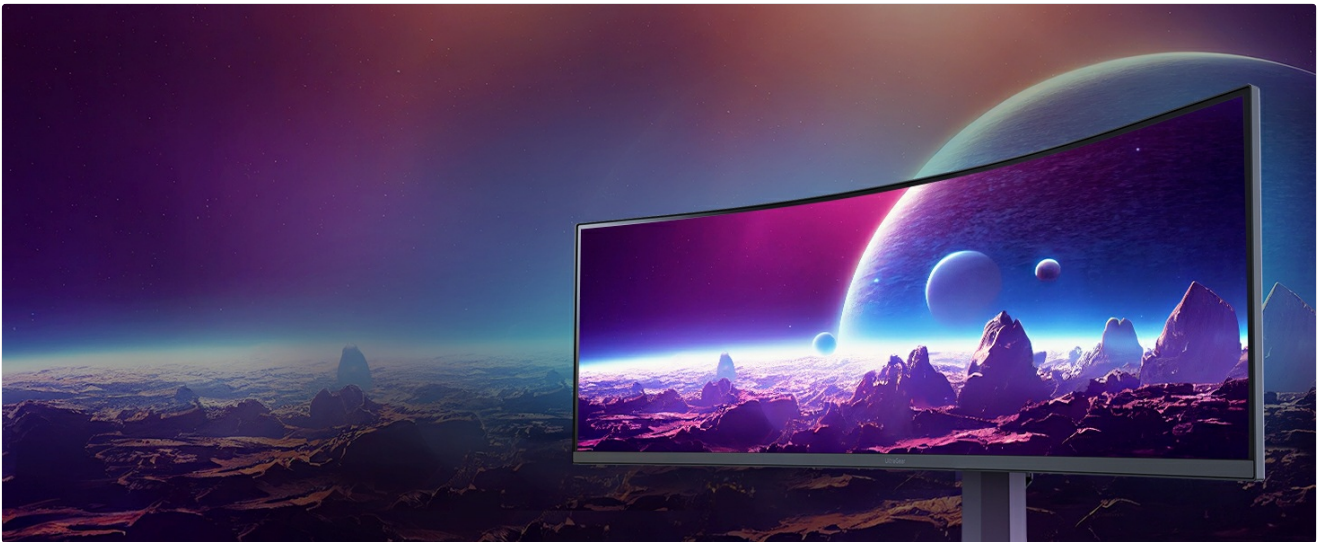
The curved panoramic display provides an immersive viewing experience.