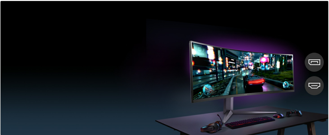
Connectivity options for DQHD at 200Hz via DisplayPort, HDMI, and USB Type-C.