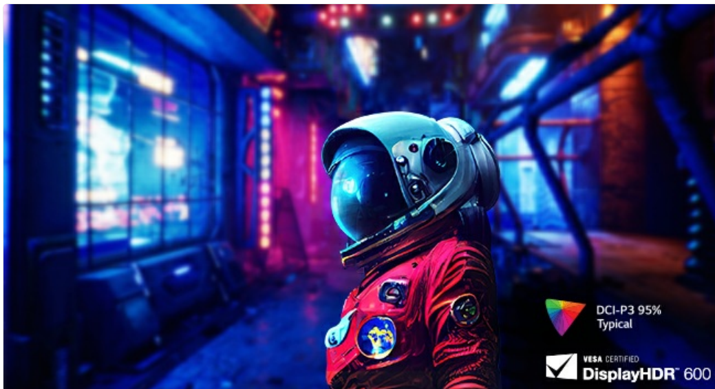
High-fidelity color and dynamic contrast with VESA DisplayHDR 600 and DCI-P3 95%.