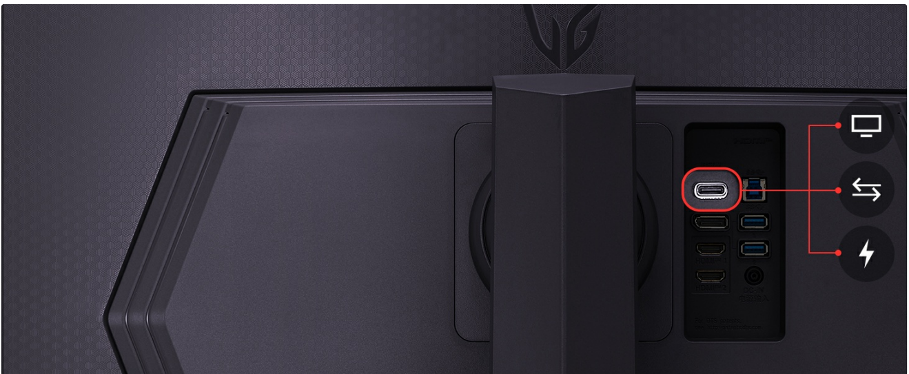
USB Type-C port supporting video, data transfer, and 90W power delivery.