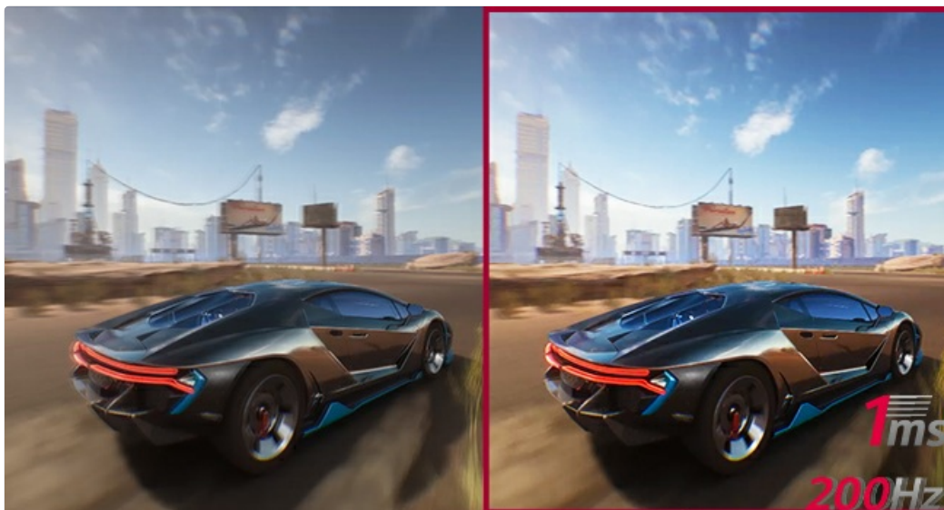
Visual comparison demonstrating the smoothness of 200Hz refresh rate and 1ms response time.

Experience smooth and responsive gameplay with a 200Hz refresh rate and a 1ms (GtG) response time. The monitor also features AMD FreeSync Premium Pro for tear-free and stutter-free gaming.