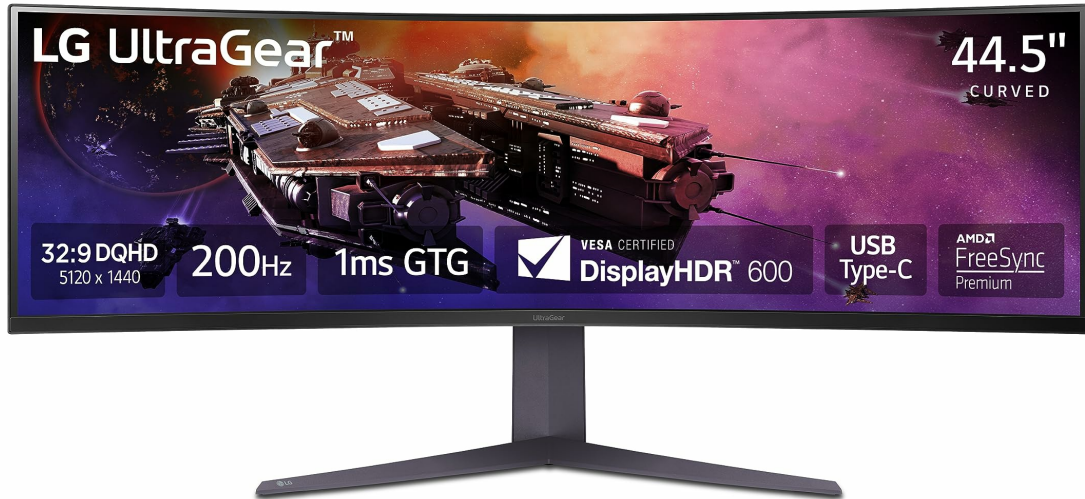
Front view of the LG 45GR75DC-B Ultragear Curved Gaming Monitor on its stand.