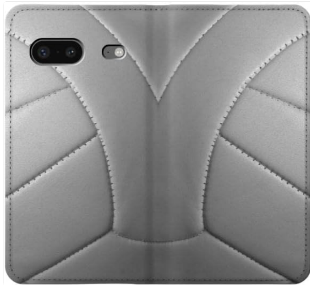
Image 2: Inside view of the RW2530 Flip Case. This image shows the interior of the case, including the clear plastic phone holder and the three integrated card slots on the left flap.