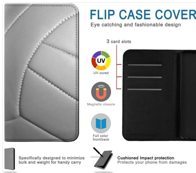
Image 4: Infographic detailing features of the flip case. This image visually summarizes key attributes such as UV cured print, magnetic closure, full color print, slim design, and cushioned impact protection.