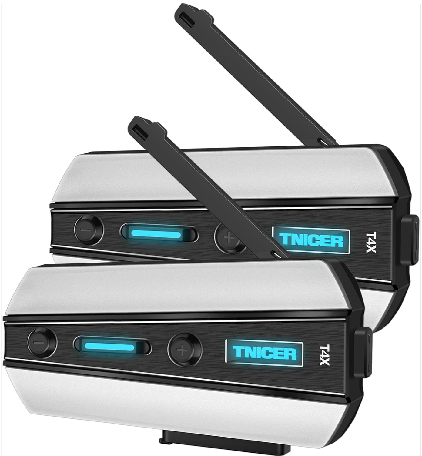
Figure 1: Two TNICER T4X intercom units, showcasing their sleek design and control buttons.