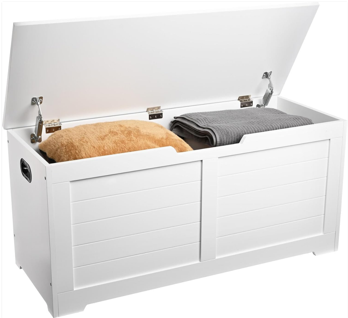
Image: The SortWise Storage Chest with its lid open, showcasing its spacious interior.