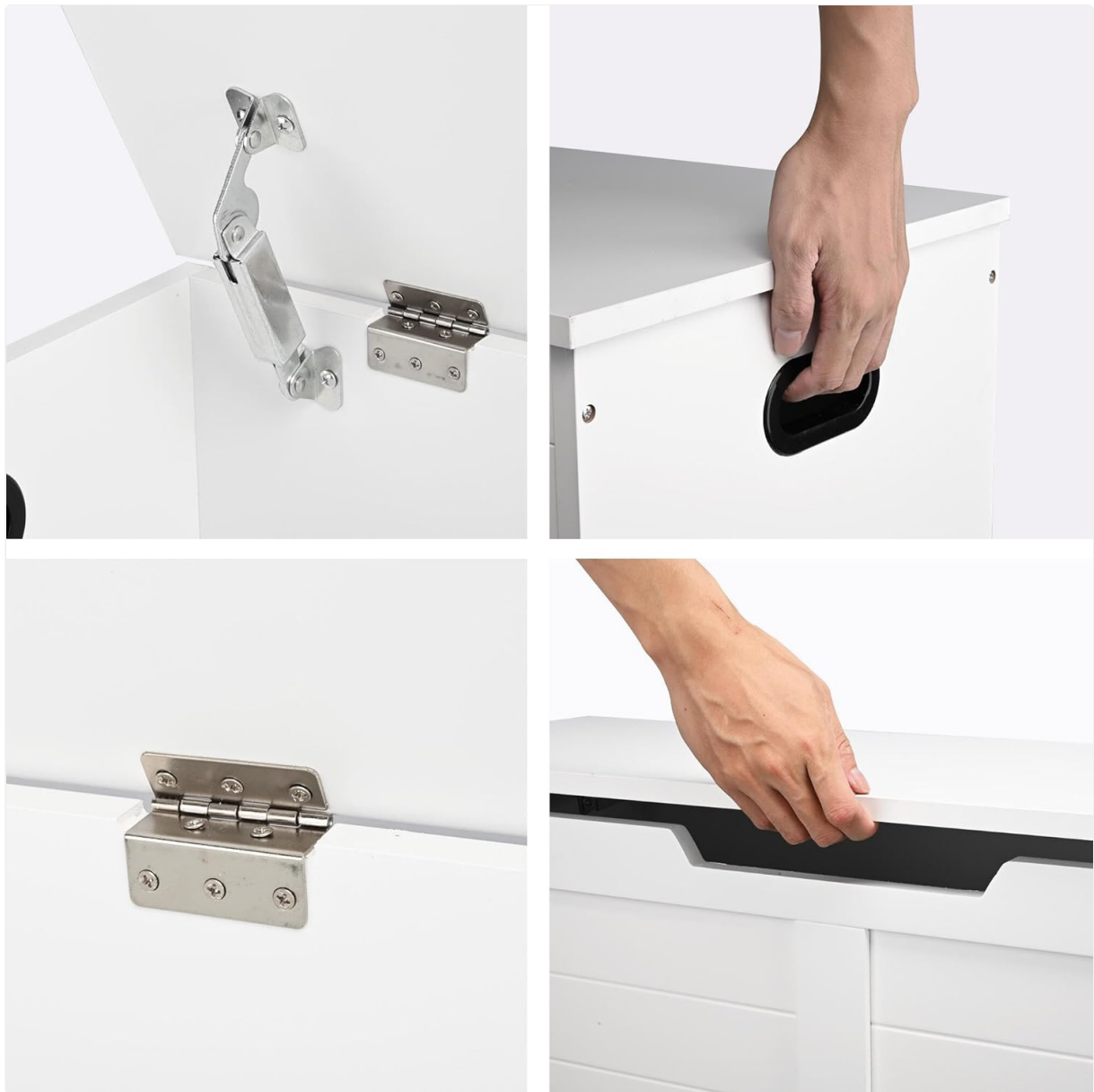
Image: Collage of detailed views of the SortWise Storage Chest, including the robust safety hinges, the ergonomic side handles, and the U-shaped lid pull.