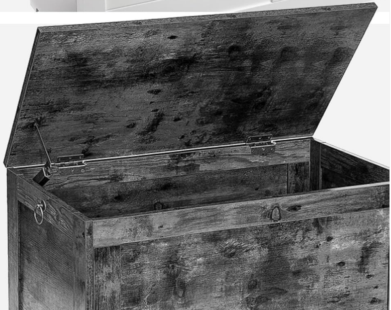
Image: Comparison image highlighting the two safety hinges of the SortWise Storage Chest, designed for stable opening and closing without pinching fingers, contrasted with a single-hinge design.