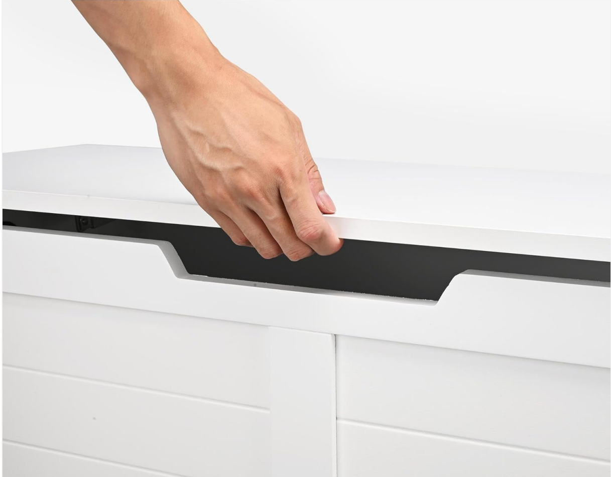
Image: Close-up image showing a hand utilizing the U-shaped cut-out pull on the lid of the SortWise Storage Chest for easy opening.