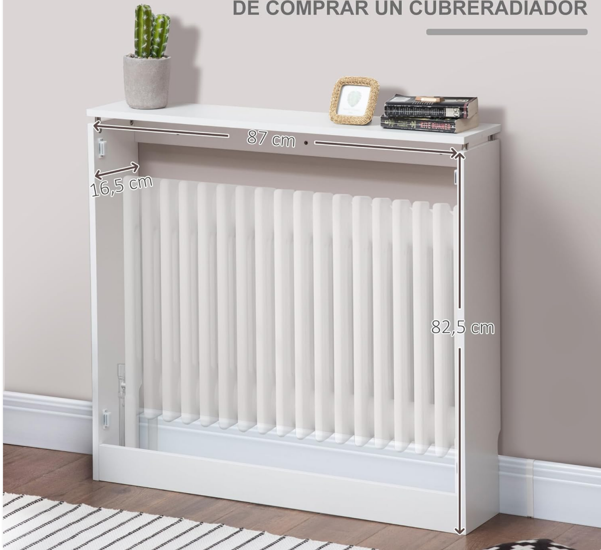
Image 4.2: Internal dimensions of the radiator cover, important for checking radiator fit.