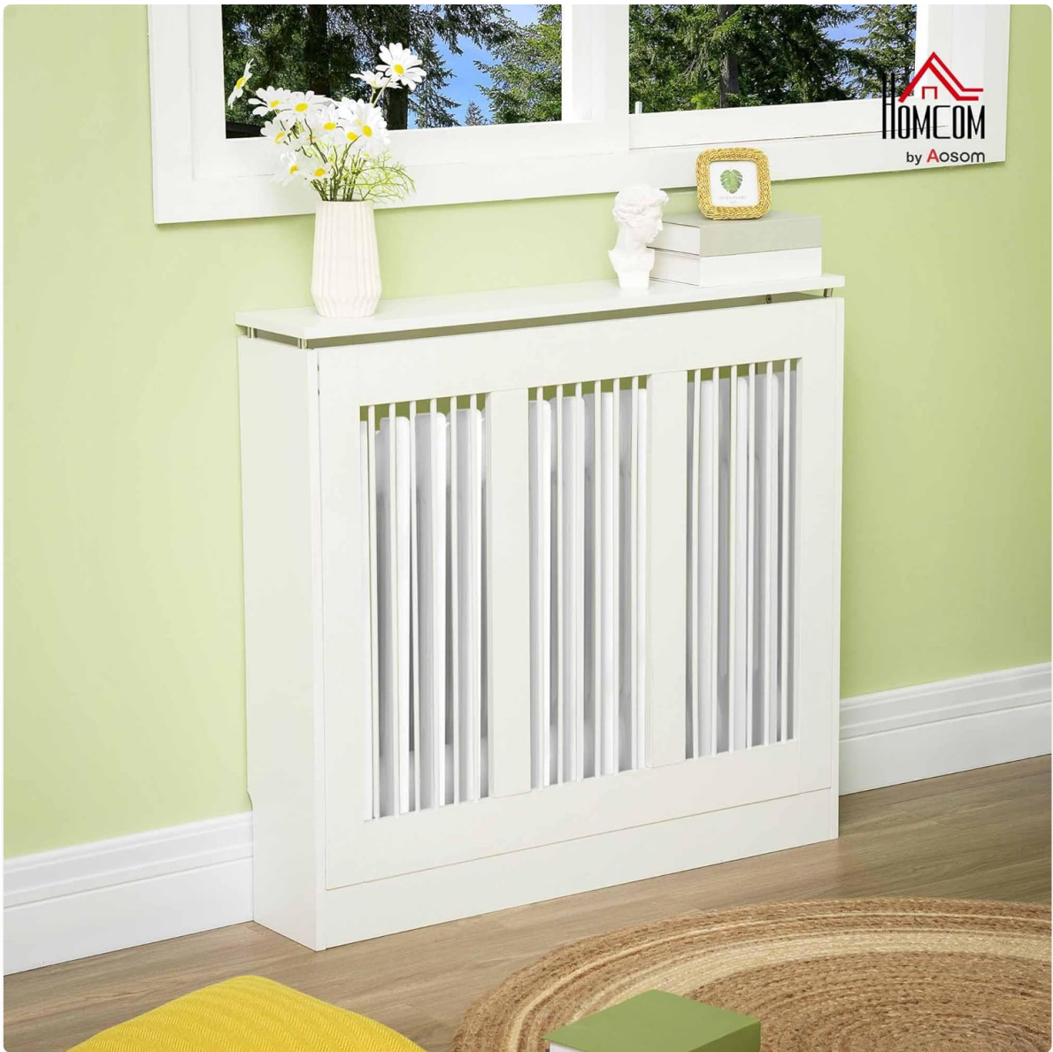
Image 1.1: The HOMCOM Radiator Cover installed in a room, showcasing its design and top shelf.