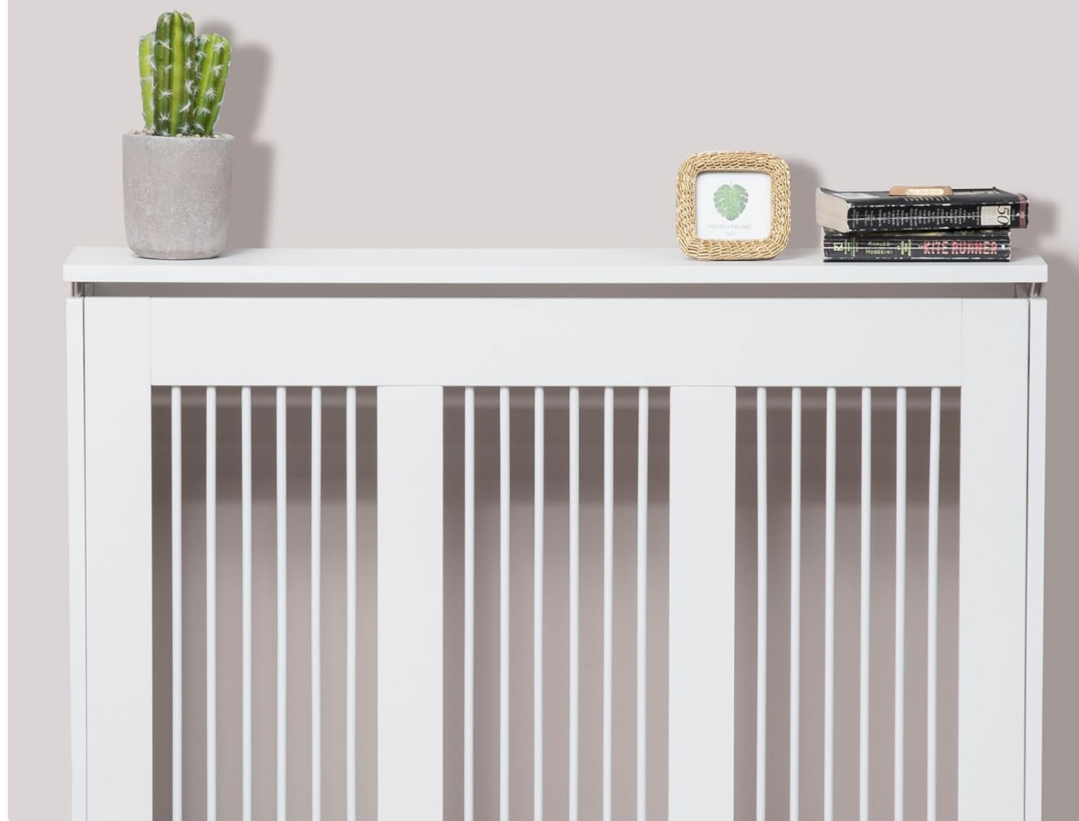
Image 6.1: The top shelf provides additional space for displaying items.

The slatted design ensures efficient heat circulation. Air flows in from the bottom and exits through the top and front slats, allowing the radiator to heat the room effectively.