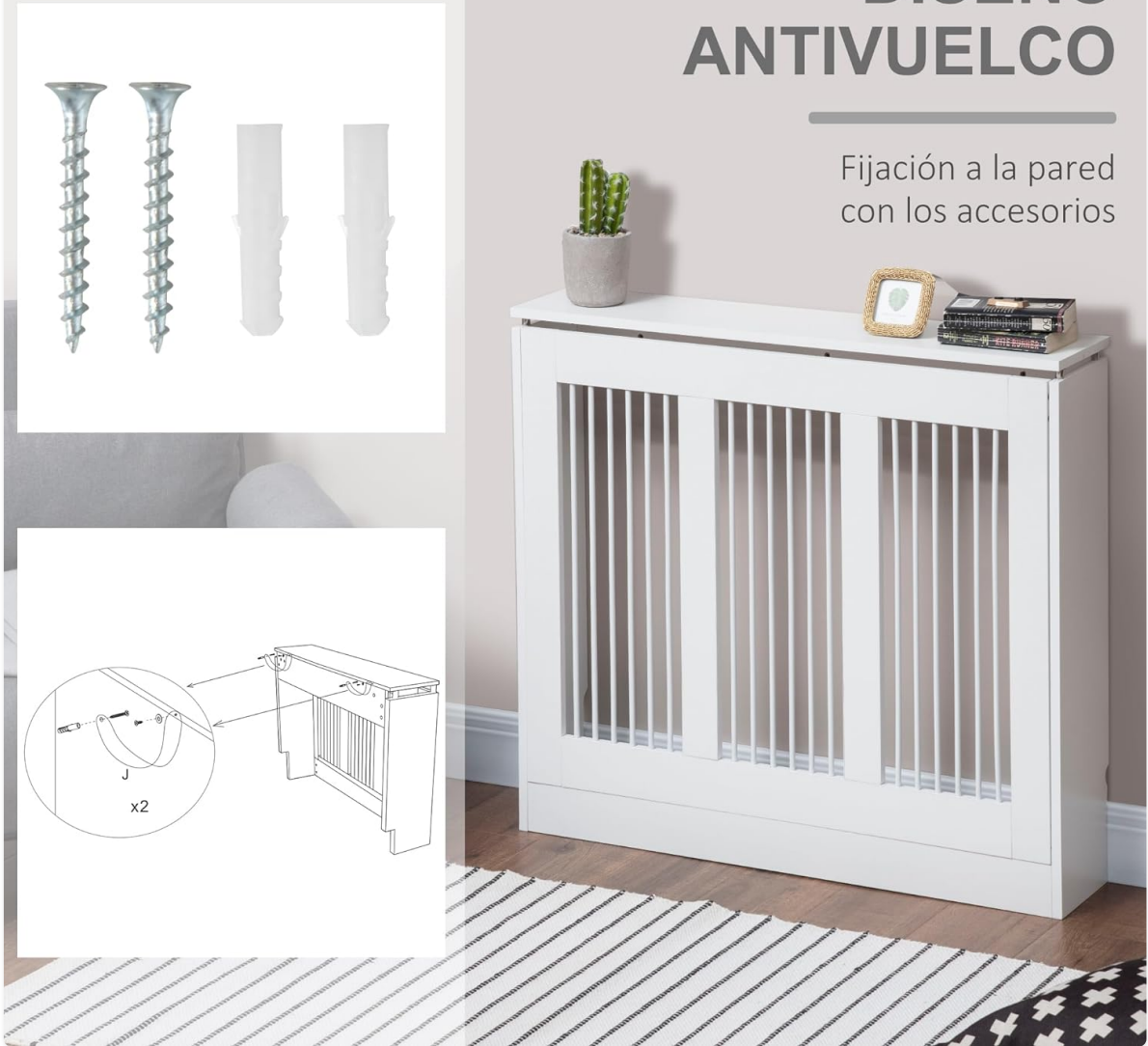
Image 5.1: Illustration of the anti-tip design and how to secure the radiator cover to the wall using the provided hardware.