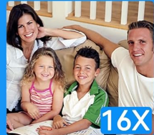
Image: This image illustrates the two photo modes available: instant print (black and white only) and color digital photo (stored on the SD card). It also shows the digital zoom feature with examples from 2x to 16x.