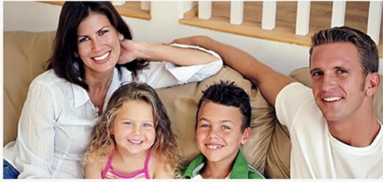
Color digital photo (stored on SD card)