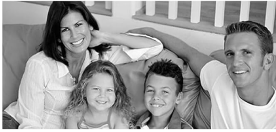
Instant print photo (black and white only)