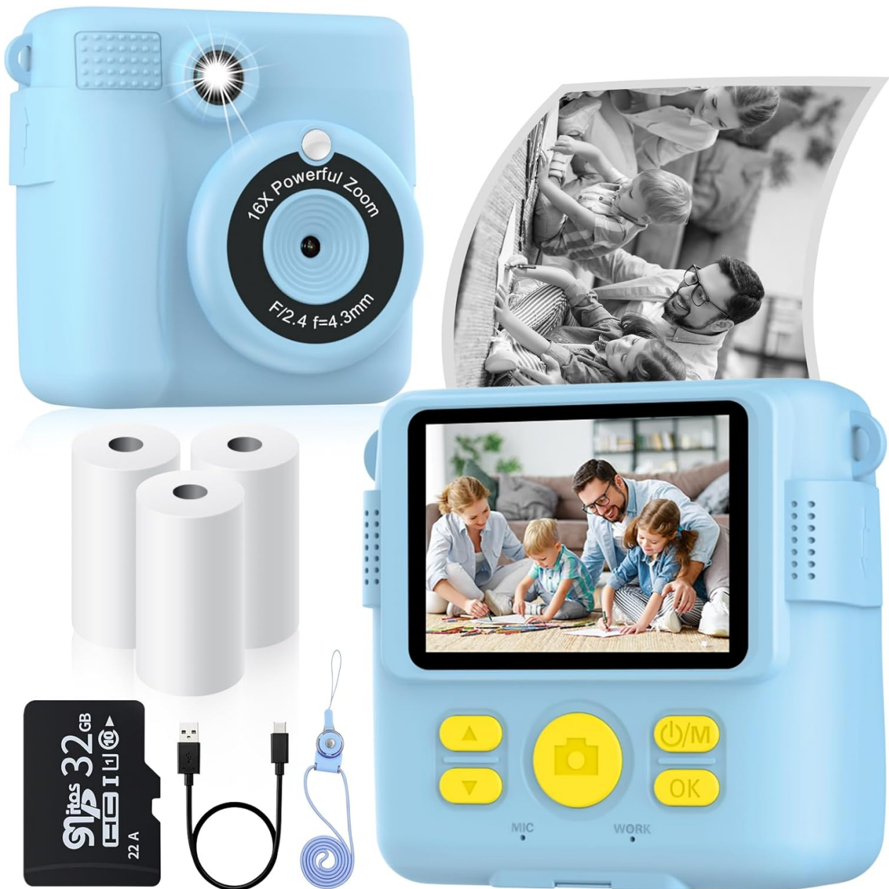
Image: The Instant Print Camera in blue, shown with its included accessories: three rolls of thermal paper, a 32GB SD card, a USB charging cable, and a lanyard.