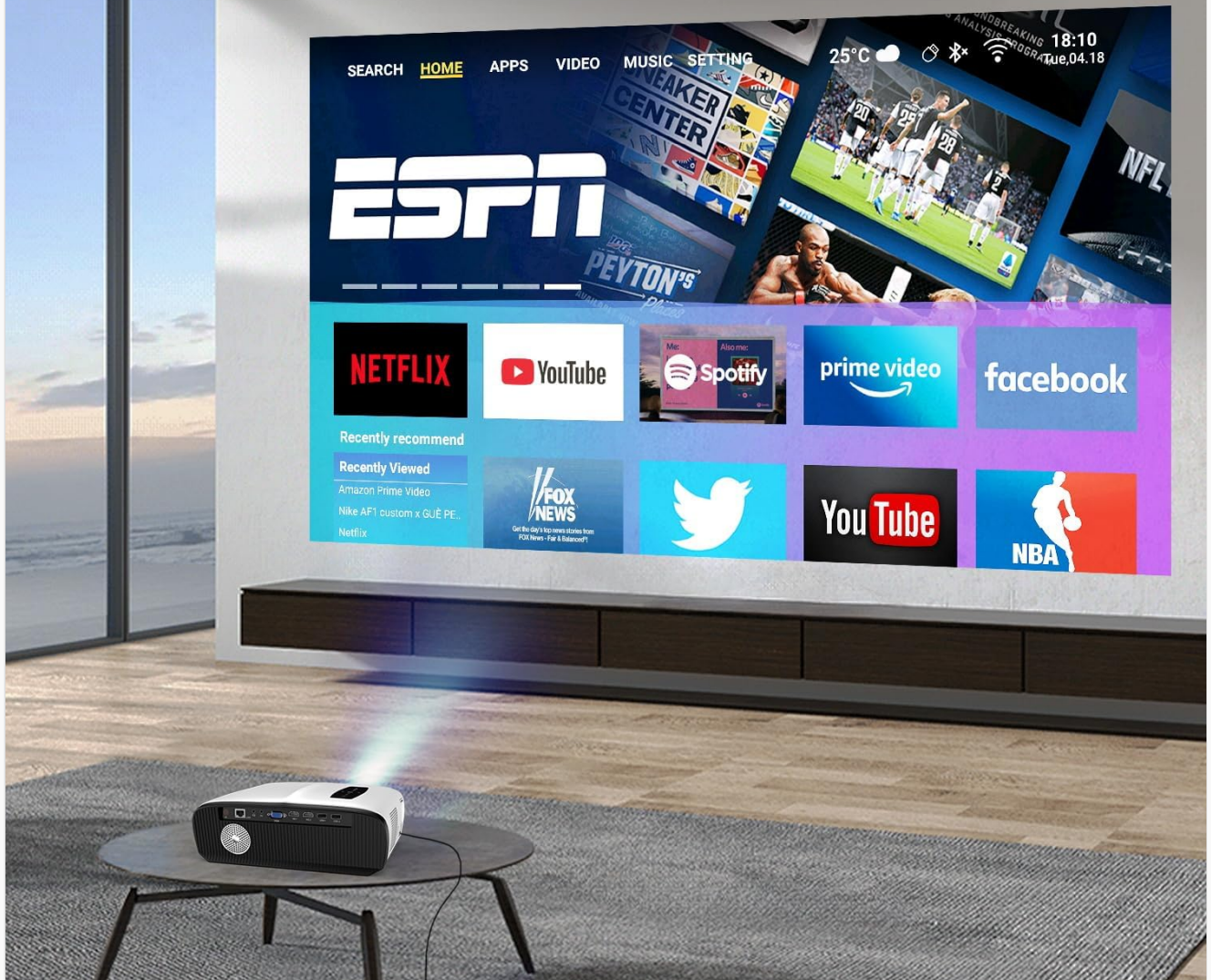
Image: A projected screen showing the Android TV OS interface with various streaming applications like Netflix, YouTube, and Prime Video.

Explore 8000+ Apps - Stream What You Want, Your Way