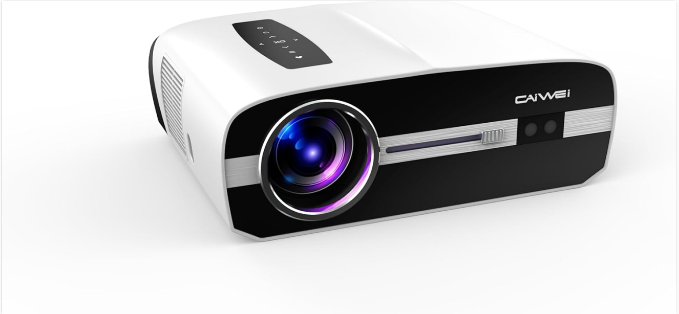
Image: Front view of the EUG US1-A9S projector, showing the lens and control panel.

Familiarize yourself with the projector's components.