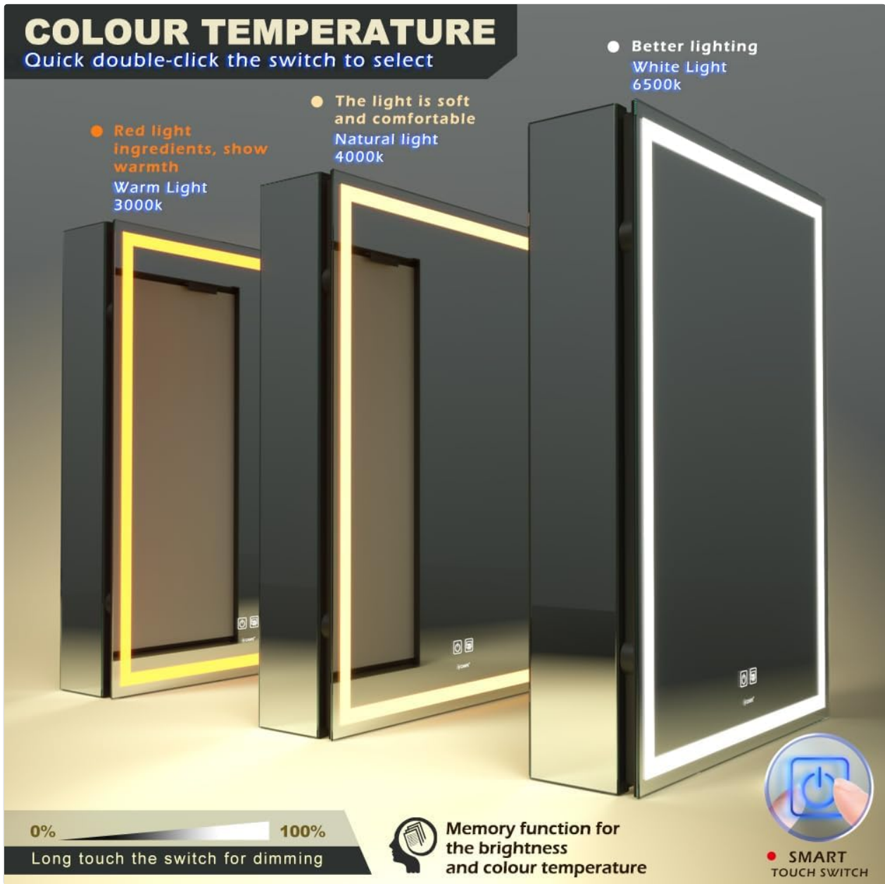
Figure 6.1: Demonstrating the color temperature and dimming features of the mirror light.