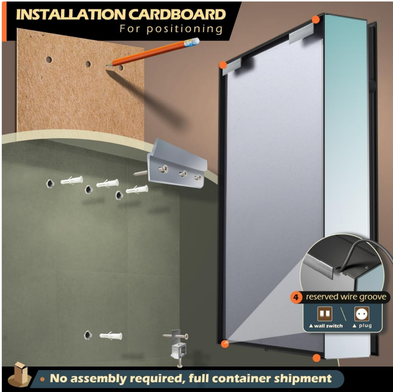
Figure 5.1: Installation steps using the provided cardboard template and mounting hardware.