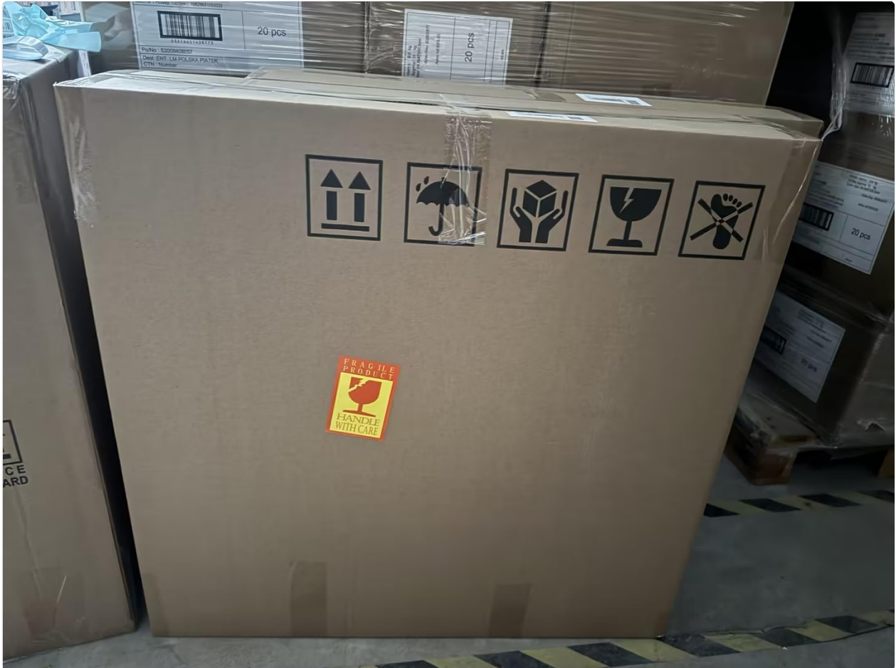
Figure 3.1: Product packaging, ensuring safe delivery of the mirror cabinet.