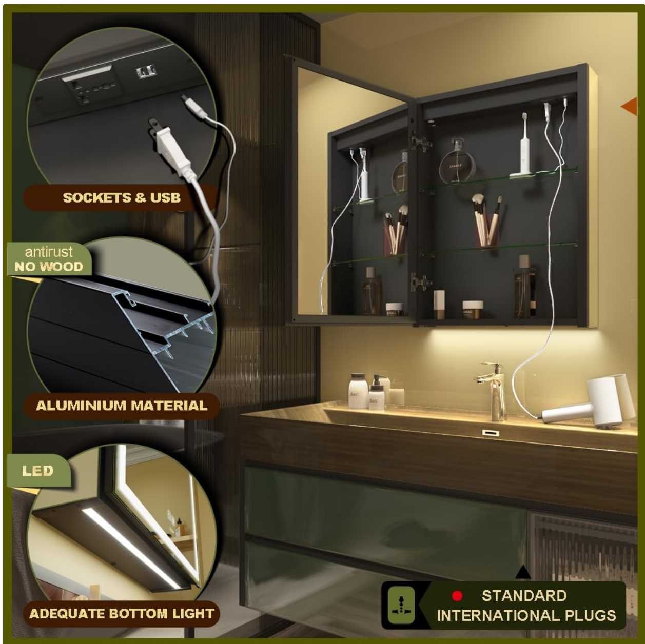
Figure 6.3: Internal sockets and USB ports for convenient charging of small devices.