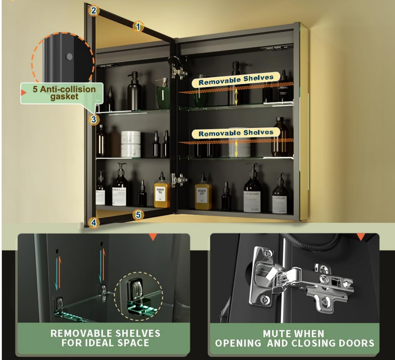
Figure 5.2: Interior view highlighting removable shelves and other cabinet details.