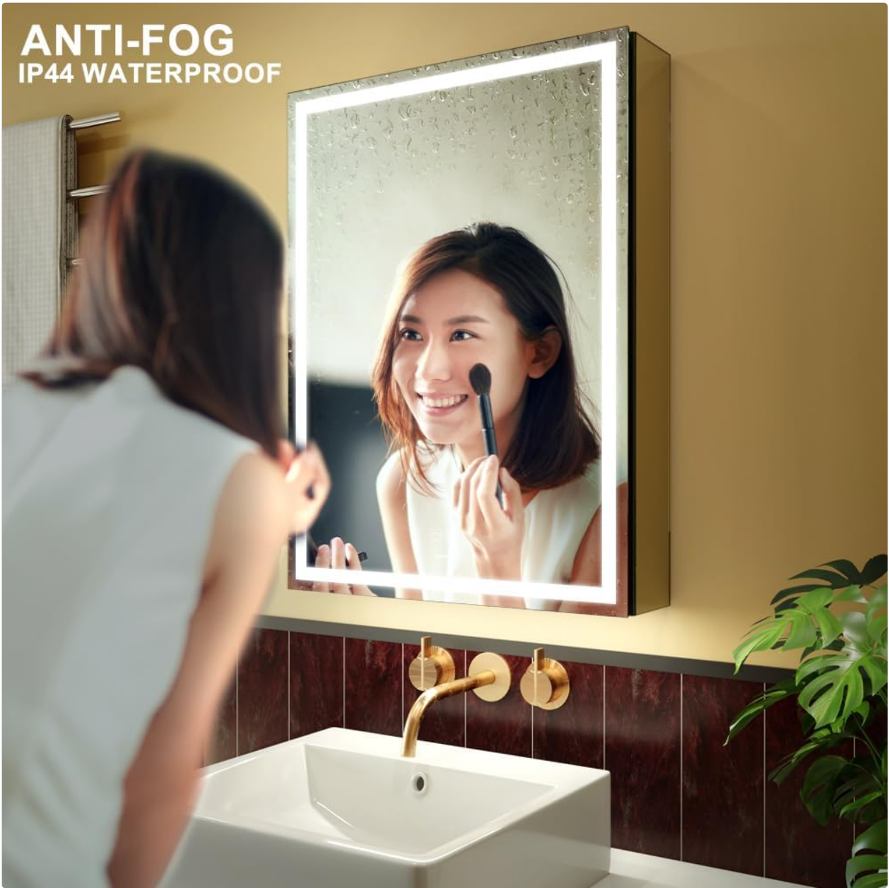
Figure 6.2: The anti-fog feature ensures a clear reflection even in humid conditions.