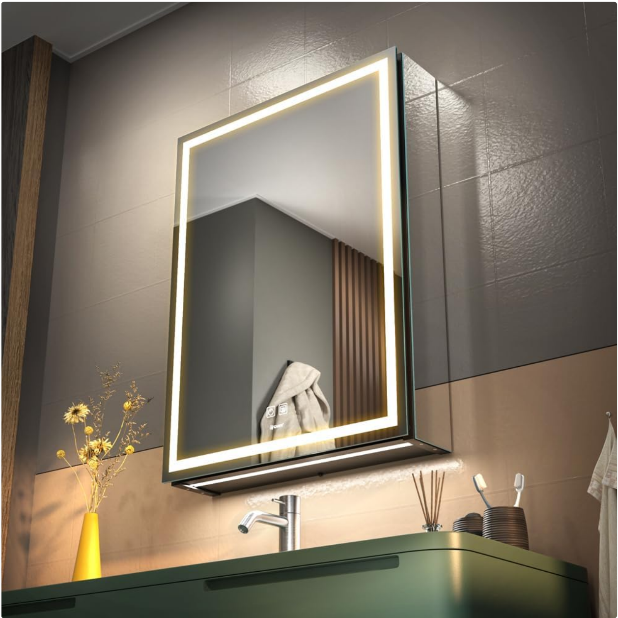
Figure 1.1: Overview of the GANPE LED Lighted Bathroom Medicine Mirror Cabinet installed in a bathroom setting.