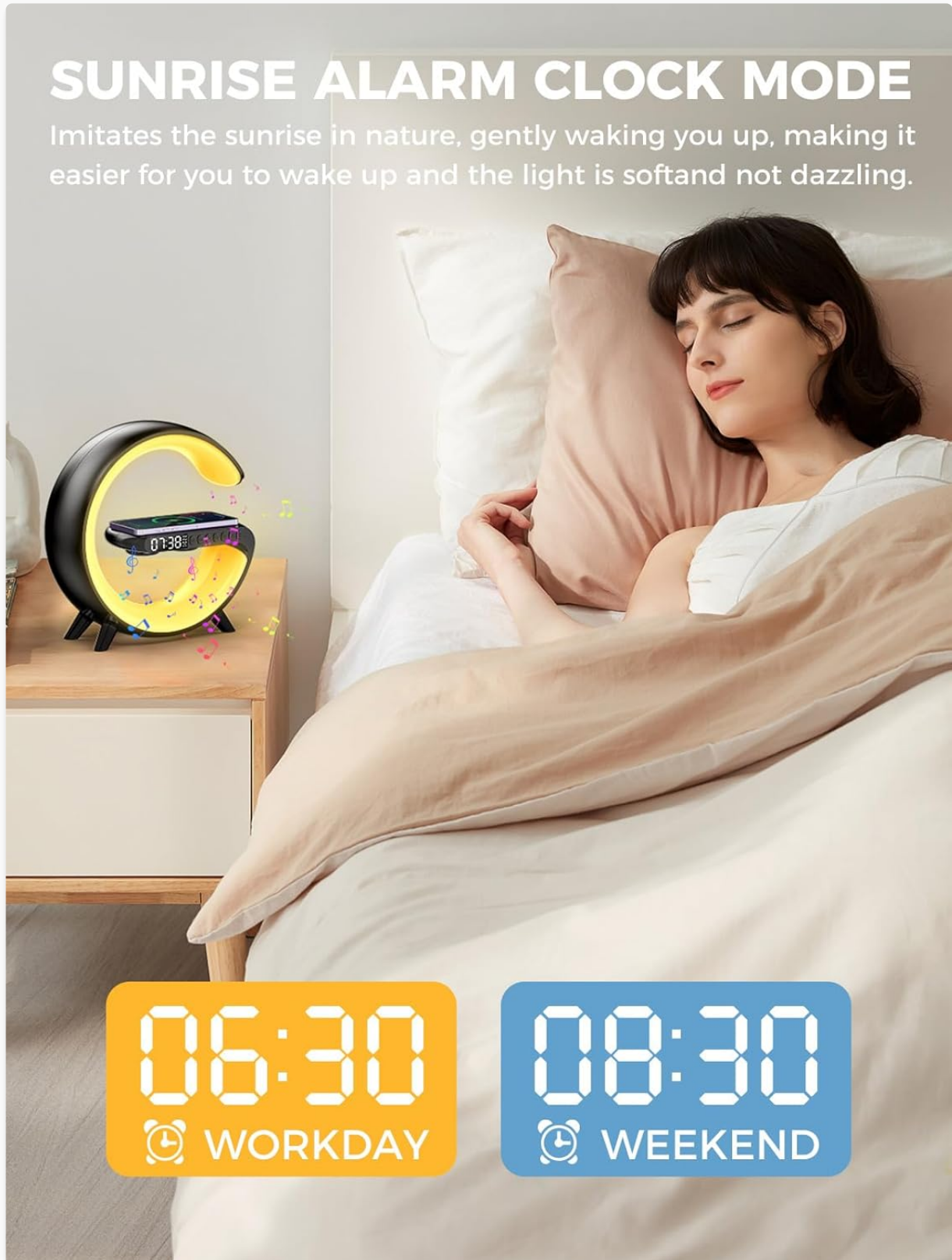
Image 6.4: The Smart Wake-Up Light displaying the time, with an illustration of its sunrise alarm clock mode gently waking a user.

Imitates the sunrise in nature, gently waking you up, making it easier for you to wake up and the light is soft and not dazzling.