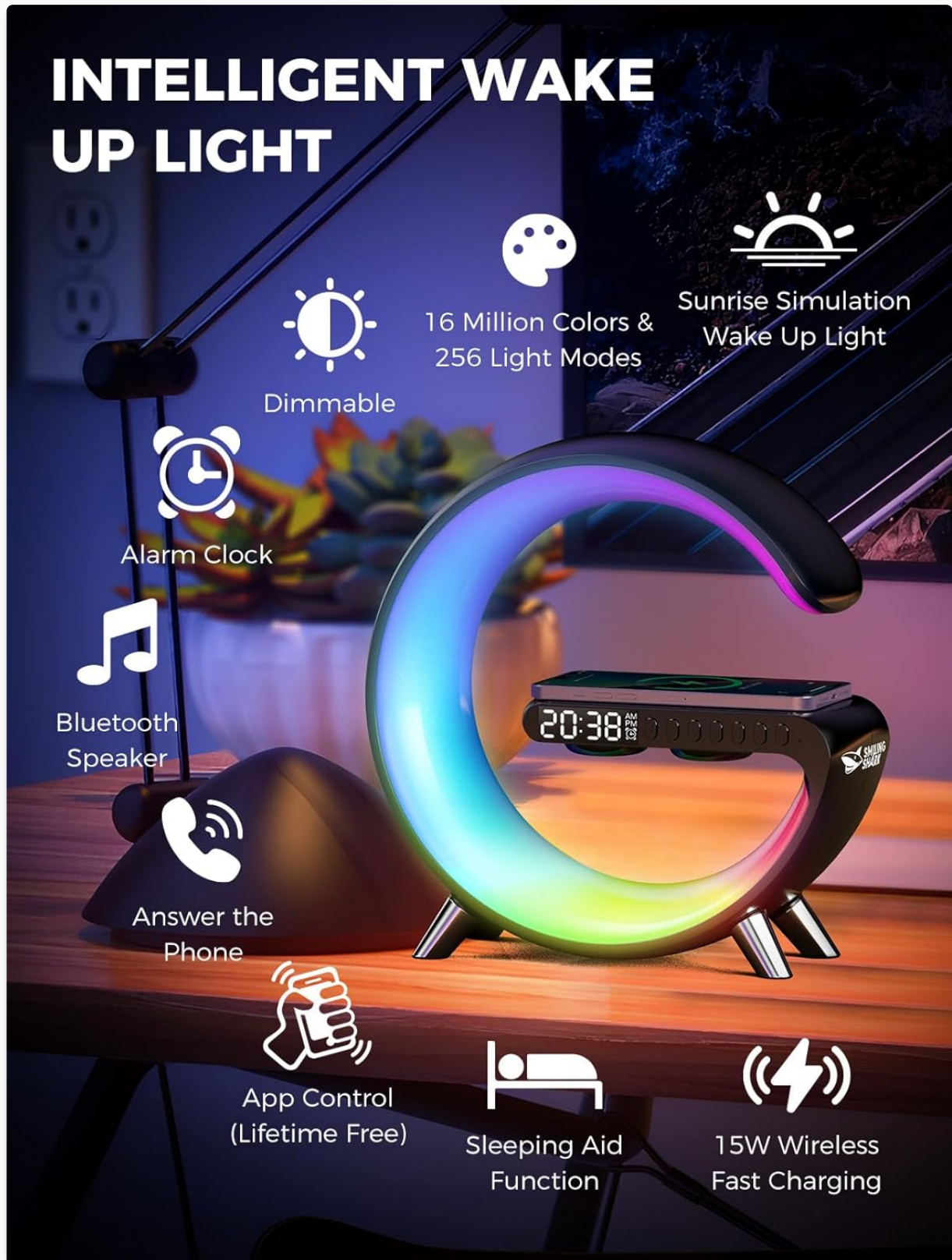
Image 4.1: Diagram illustrating the key features of the Smart Wake-Up Light, including dimmable light, alarm clock, Bluetooth speaker, app control, sleep aid, and wireless charging.