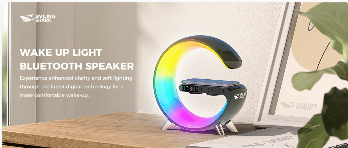
Image 1.1: Smiling Shark Smart Wake-Up Light with Bluetooth Speaker and Wireless Charger.

Thank you for choosing the Smiling Shark Smart Wake-Up Light. This device combines a multi-functional ambient light, a Bluetooth speaker, a wireless fast charger, and an alarm clock, all controllable via a dedicated application. This manual provides detailed instructions to help you understand and operate your new device effectively.