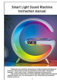
User Manual *1

Image 6.1: A smartphone displaying the control application interface, showing color selection and various light modes for the device.