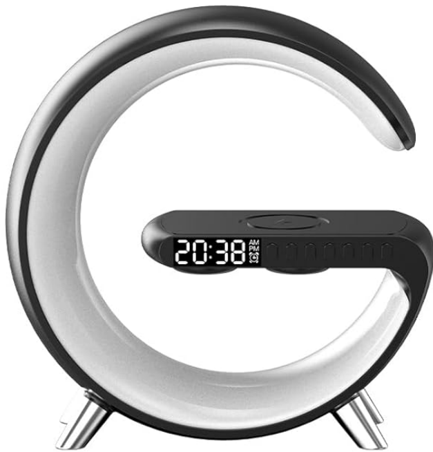
Wake Up Light *1

Smiley Shark Lighting Technology Co., Ltd. was established on December 29, 2011. The company's business scope includes: lighting fixtures, flashlights, electronic batteries, outdoor camping equipment, etc.