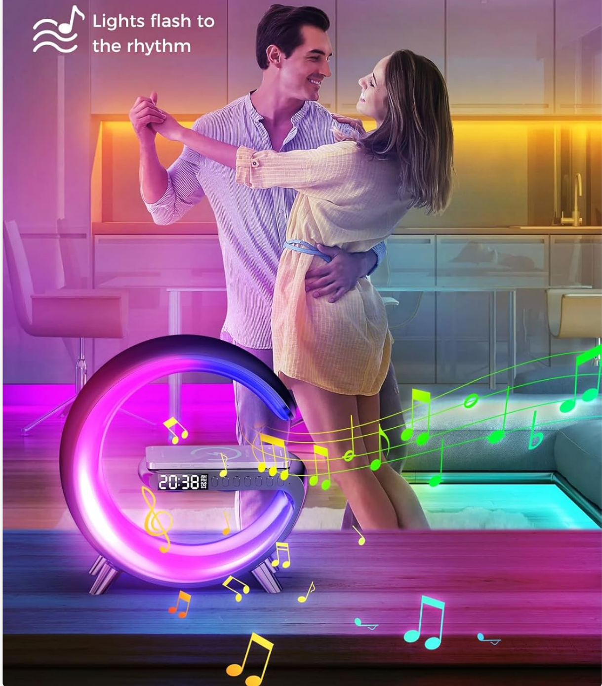
Image 6.2: The Smart Wake-Up Light playing music through its Bluetooth speaker, with ambient lights synchronizing to the rhythm.