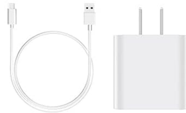
Type-C Power Cable *1