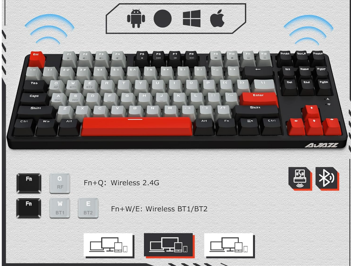
Diagram showing the Ajazz AK871's ability to connect to up to three devices simultaneously via 2.4GHz wireless and Bluetooth.