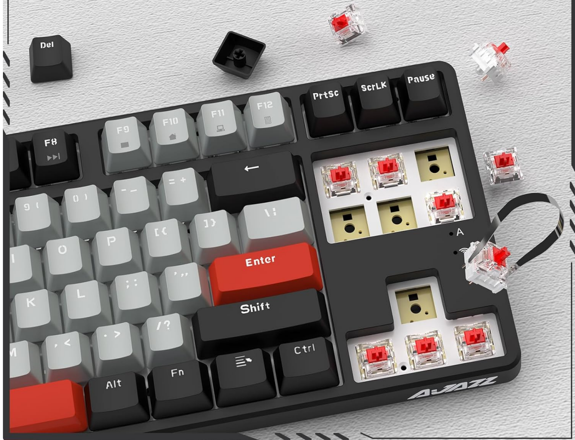
Close-up view demonstrating the hot-swappable switch feature of the Ajazz AK871 keyboard, showing switches being removed and inserted.

Support 90% 3-Pin Switches, Not For-5 Pin Switches.