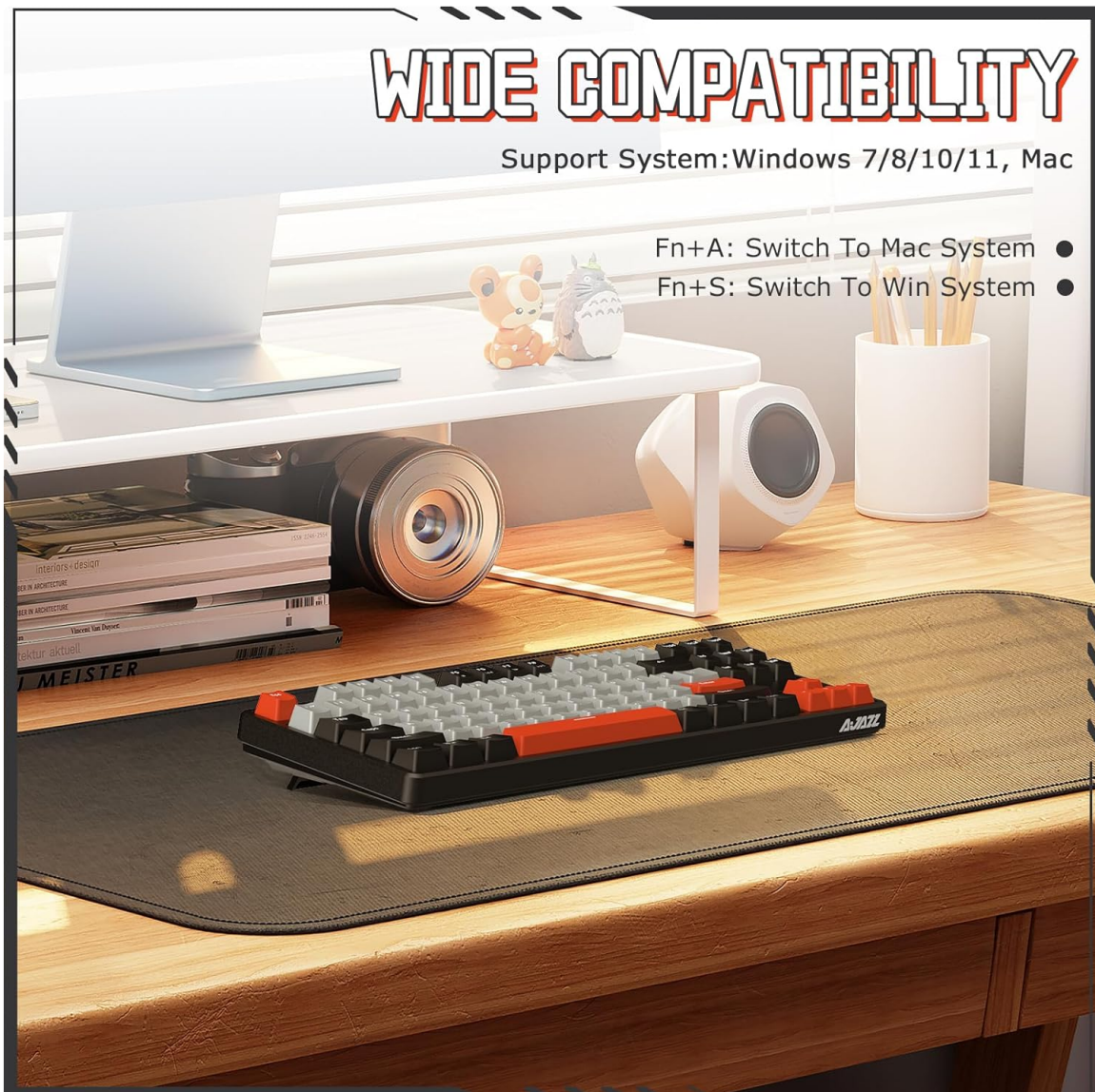
Image showing the Ajazz AK871 keyboard in a desktop setup, illustrating its wide compatibility with Windows and Mac systems.