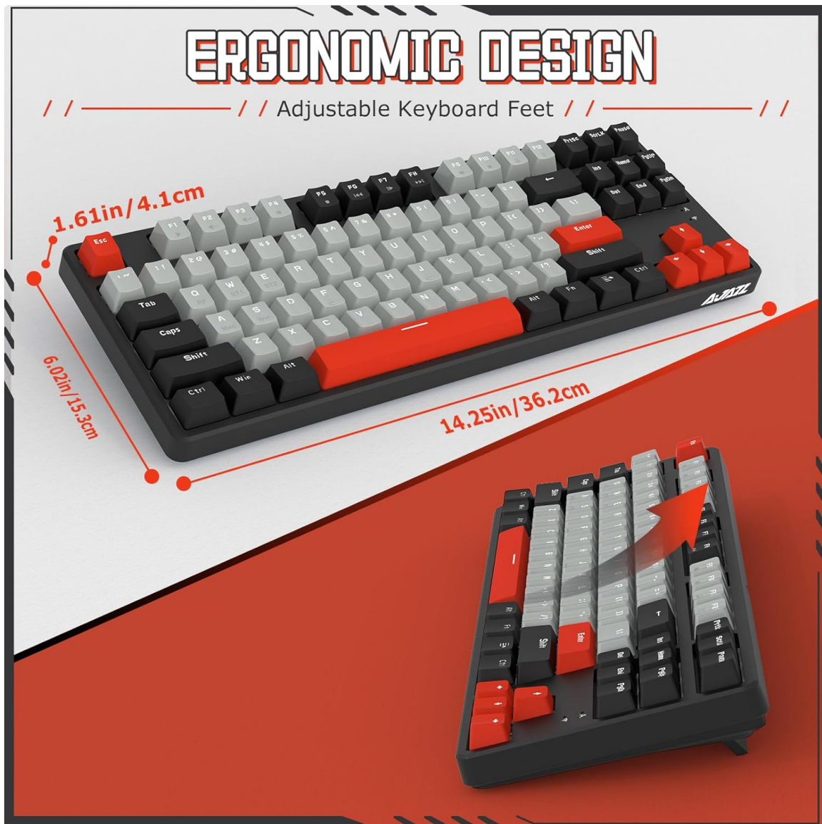
Diagram showing the ergonomic design and adjustable keyboard feet of the Ajazz AK871, with dimensions indicating its compact size.