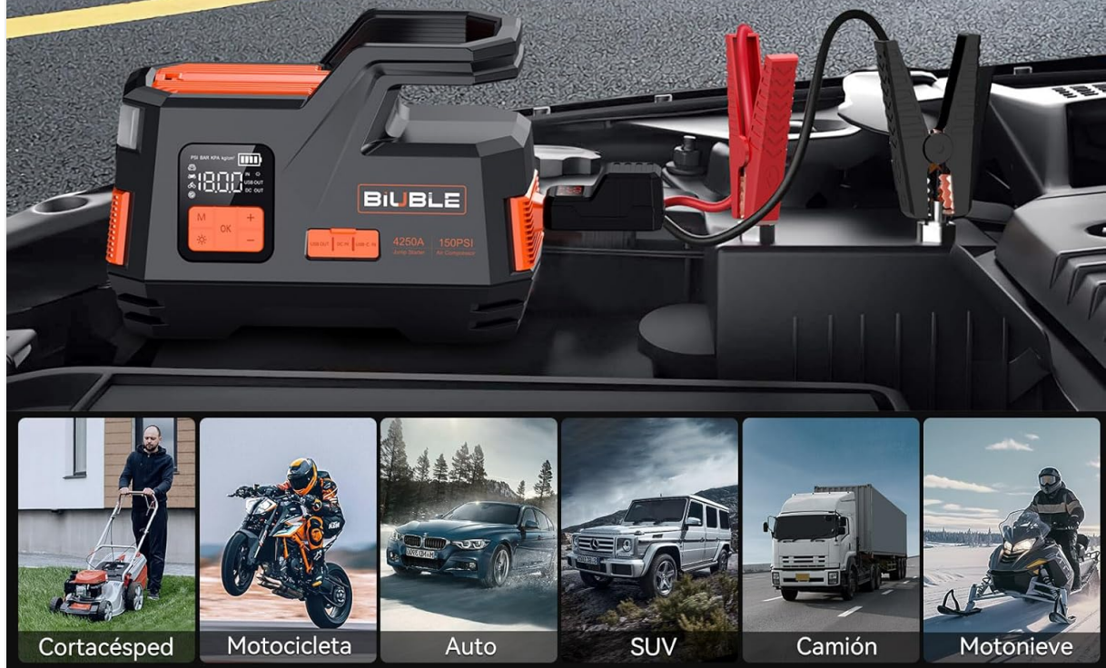
Image 1.1: The BIUBLE JS006 Jump Starter connected to a car battery, illustrating its capability to jump-start various vehicle types including cars, trucks, motorcycles, and snowmobiles, and highlighting its 4250A peak current and 26800mAh battery capacity.