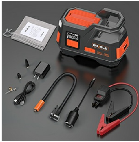
Image 3.1: A visual representation of all items included in the BIUBLE JS006 product package.