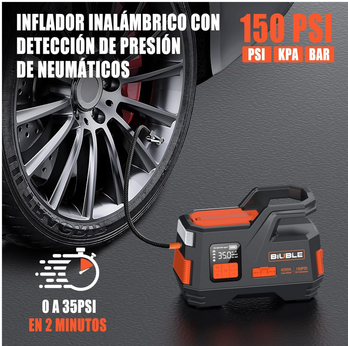
Image 6.1: The BIUBLE JS006 in use, inflating a car tire, demonstrating its 150 PSI wireless air compressor function and digital pressure detection.

7. Disconnect the hose from the tire valve and the device.