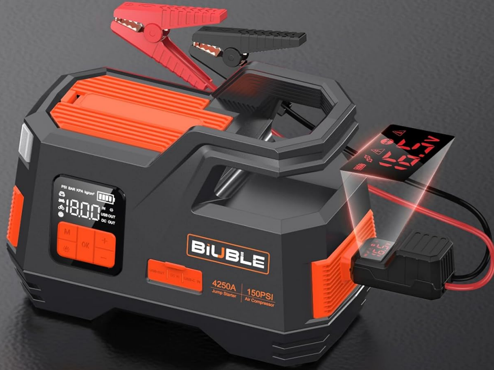
Image 2.1: The BIUBLE JS006 Jump Starter with its smart clip cable, illustrating the integrated 8 safety protections and the display for error indications.