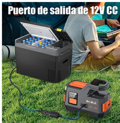
Image 6.3: The BIUBLE JS006 providing power to a portable car refrigerator through its 12V DC output.