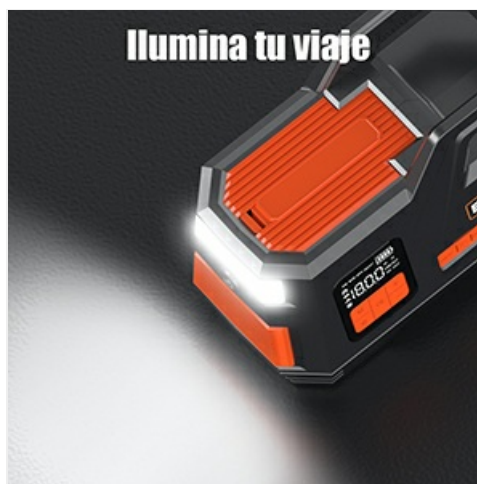
Image 6.4: The BIUBLE JS006 with its LED flashlight active, illustrating its 400 lumen brightness and multiple modes for emergency and utility lighting.