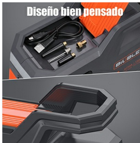
Image 4.2: The integrated storage compartment for accessories, demonstrating the thoughtful design of the BIUBLE JS006.