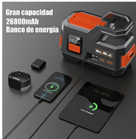
Image 6.2: The BIUBLE JS006 functioning as a power bank, charging multiple electronic devices simultaneously.