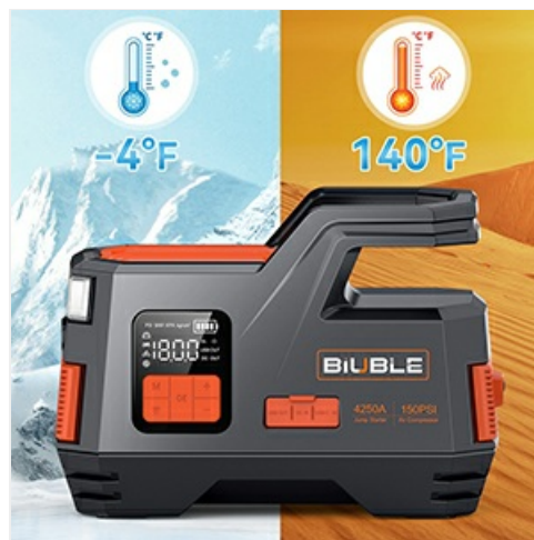
Image 9.1: The BIUBLE JS006 demonstrating its wide operating temperature range, from cold to hot environments.