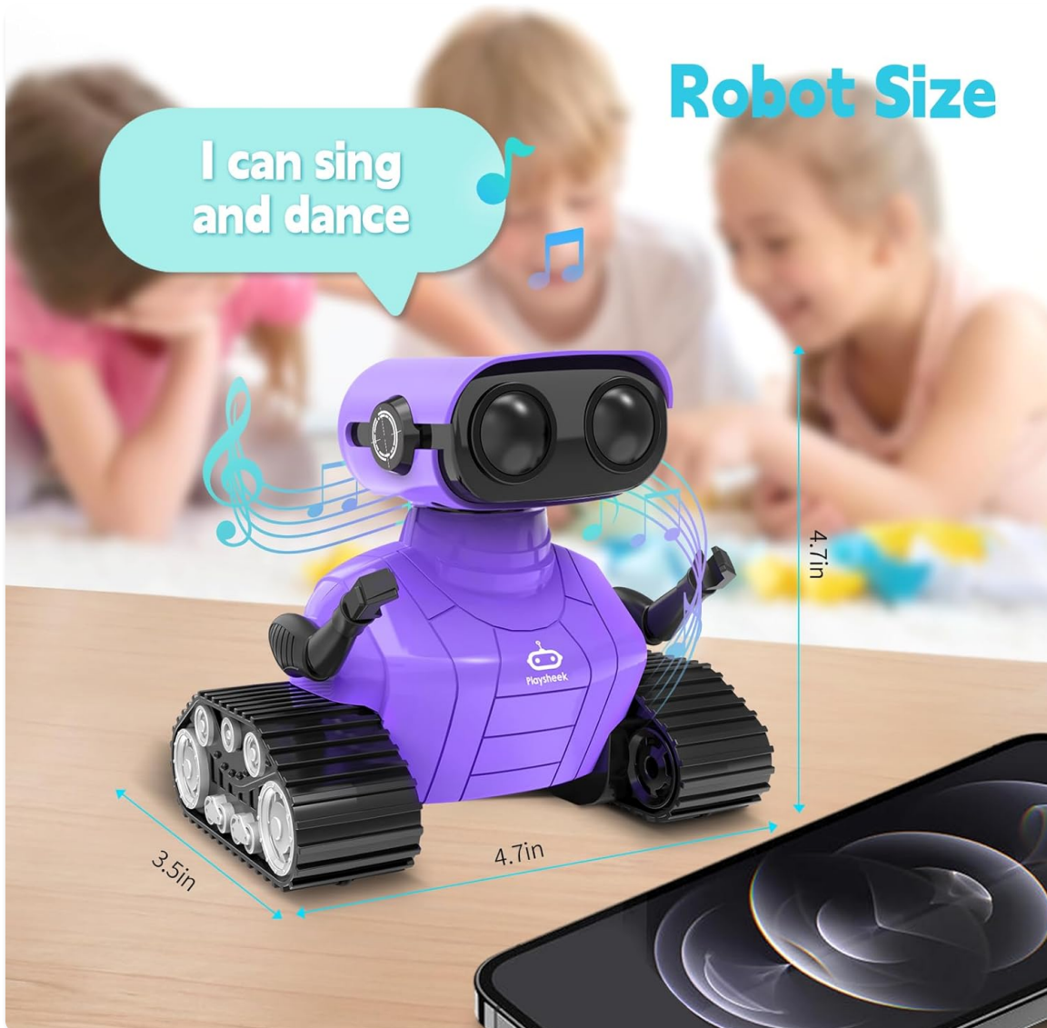
Image: Visual representation of the robot's physical dimensions, indicating its height, width, and length.