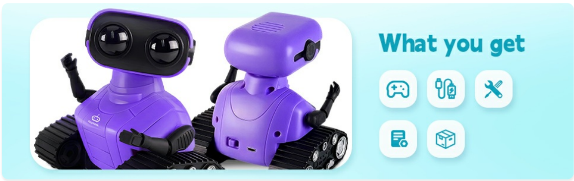
Image: Visual representation of the robot's capabilities, including 360-degree rotation, music and dance functions, and its stable, movable design.