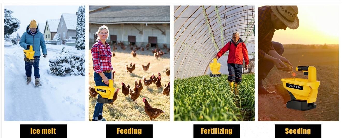
Figure 4: The spreader in action, demonstrating its wide spreading capability.