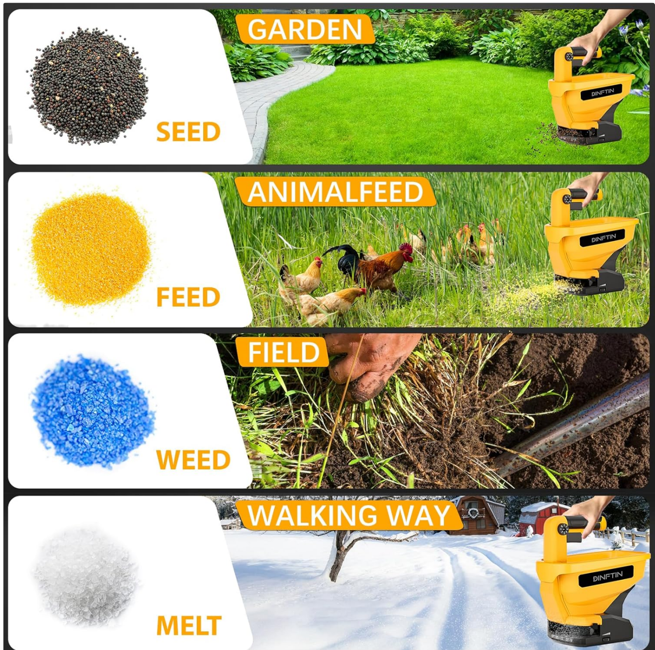
Figure 5: Versatile applications of the Dinfthin spreader throughout the year.

Your browser does not support the video tag.