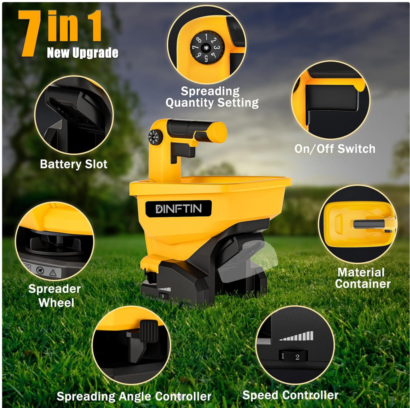
Figure 1: Key components and controls of the Dinftin Battery Operated Spreader.