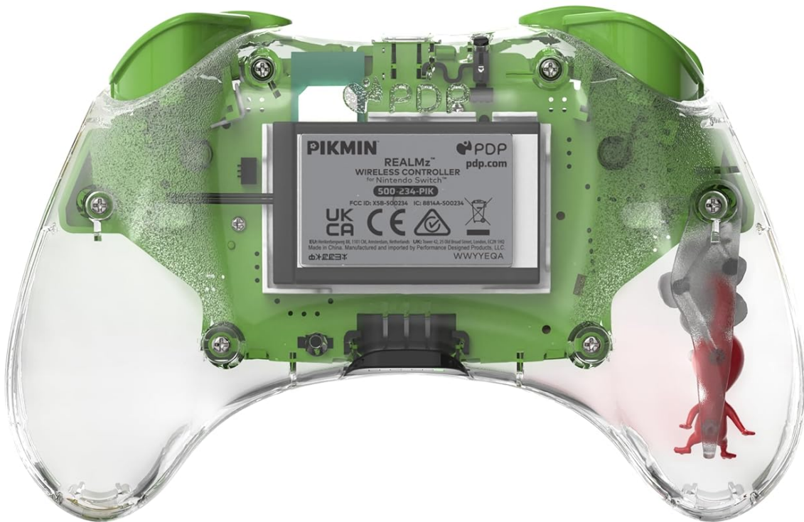
Image: A detailed view of the controller's clear casing, revealing a Pikmin figurine and multi-layered artwork.