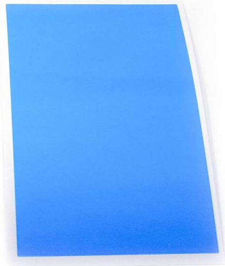
Dust Removing Sticker

Image: The included accessories for screen protector installation: an applicator card, a microfiber cleaning cloth, and a dust removing sticker.