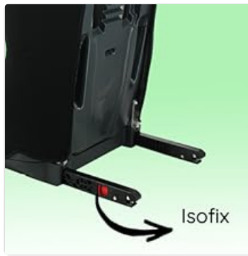
Close-up view of the ISOFIX connector mechanism.