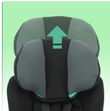
Close-up view of the headrest adjustment mechanism.