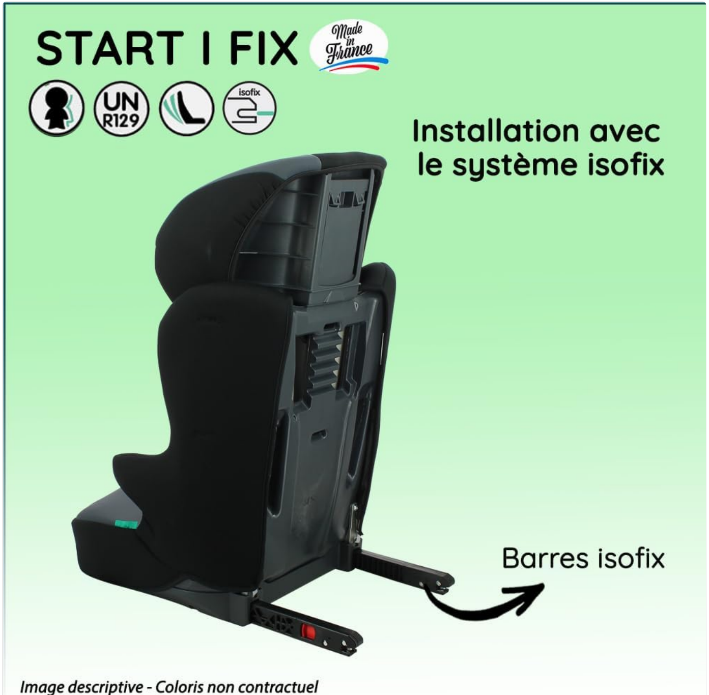
Illustration showing the ISOFIX bars extended for installation.