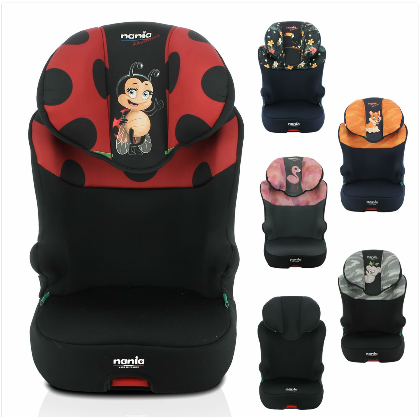
Front view of the Nania Start I FIX i-Size Booster Car Seat in ladybug design.