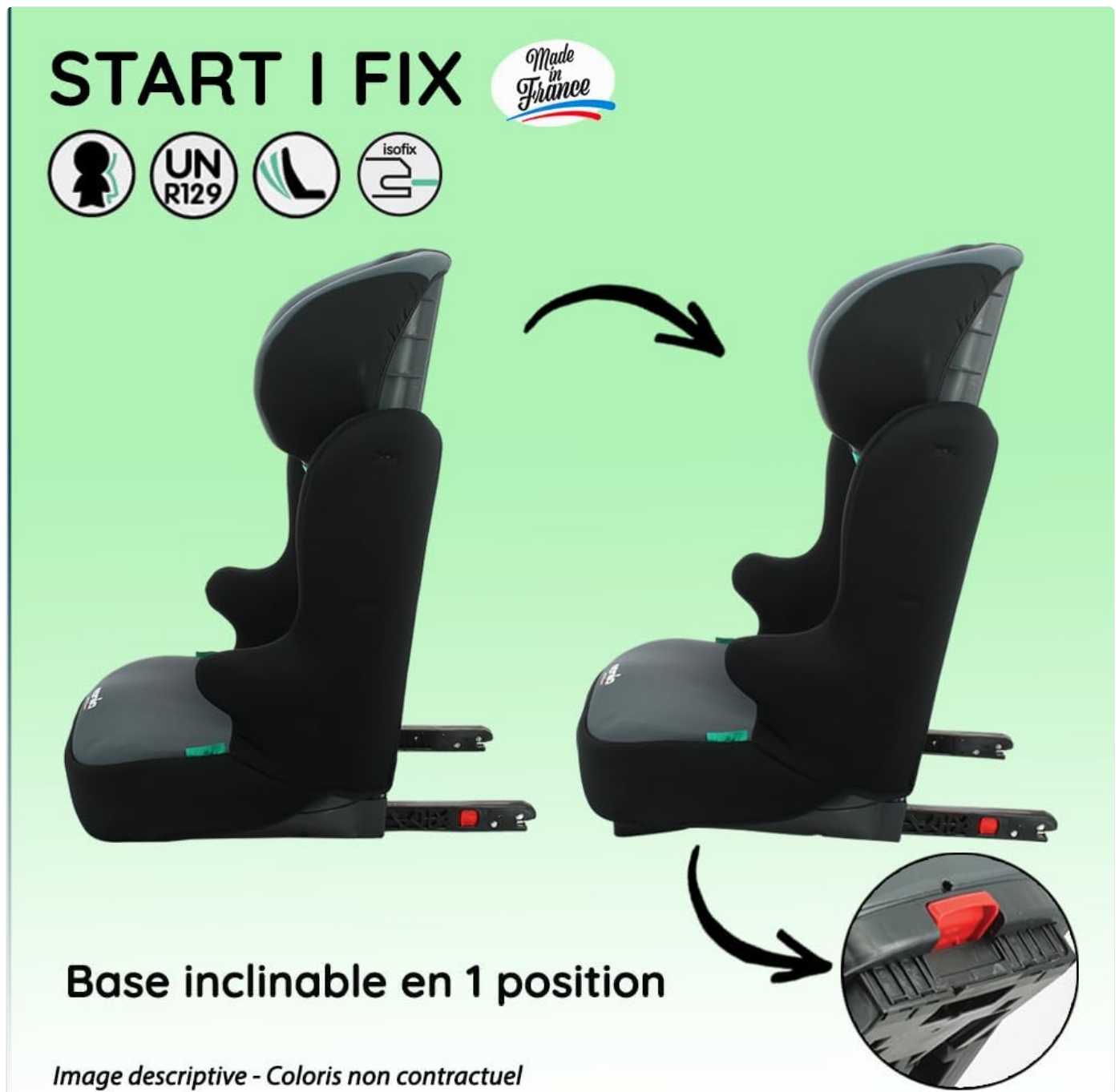
Illustration showing the car seat's reclining base in one position.