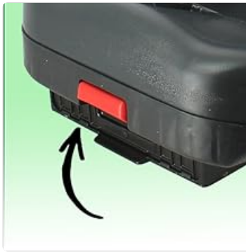
Close-up view of the reclining base adjustment mechanism.