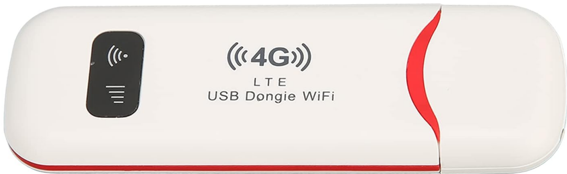
Figure 5: The Zunate 4G USB Portable WiFi device, emphasizing its WPA/WPA2 WiFi encryption for secure internet access.

WPA/WPA2 WiFi encryption, multiple protection, more secure