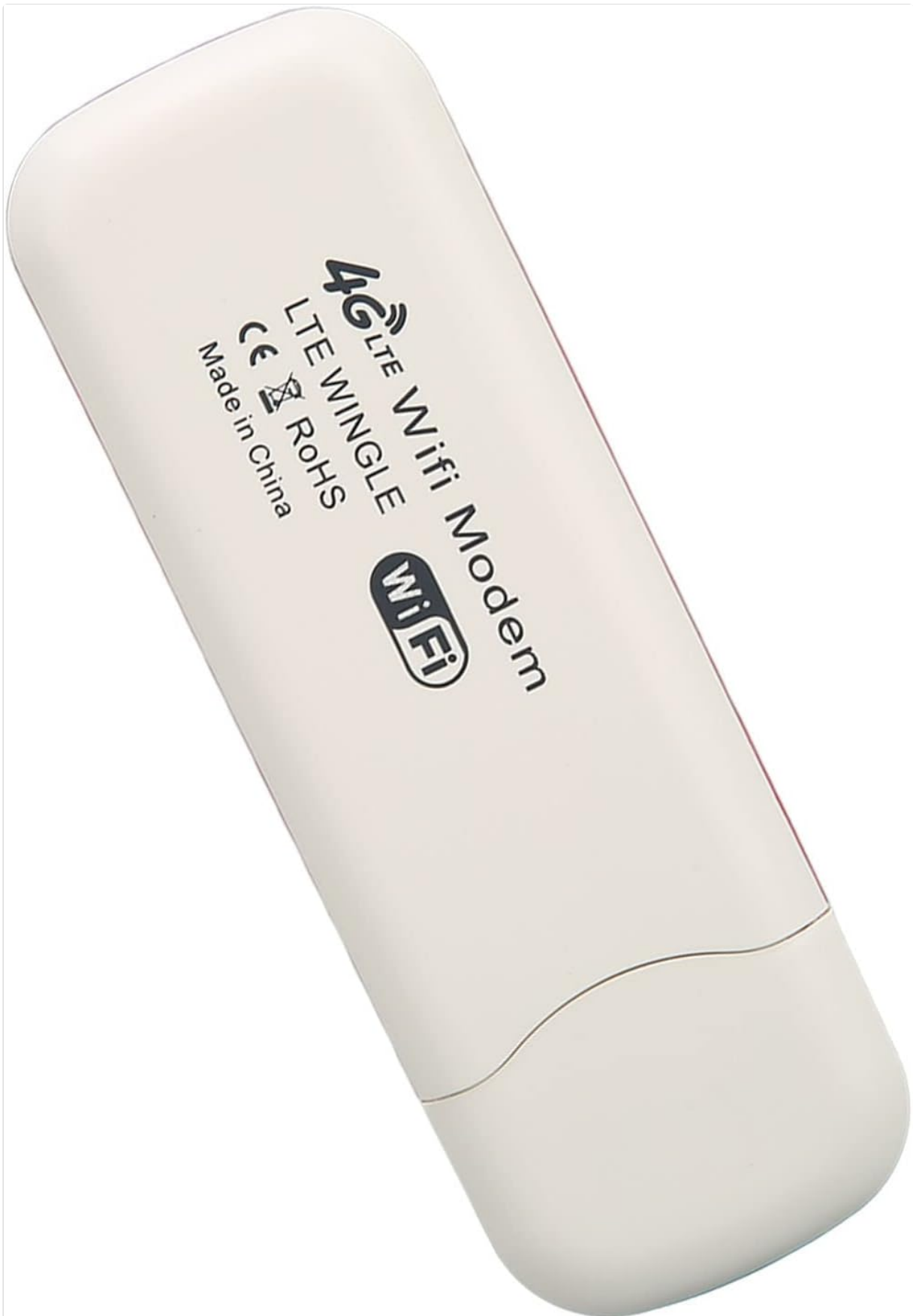
Figure 2: Back view of the Zunate 4G LTE Wifi Modem, showing regulatory markings like CE and RoHS, and indicating it is 'Made in China'.