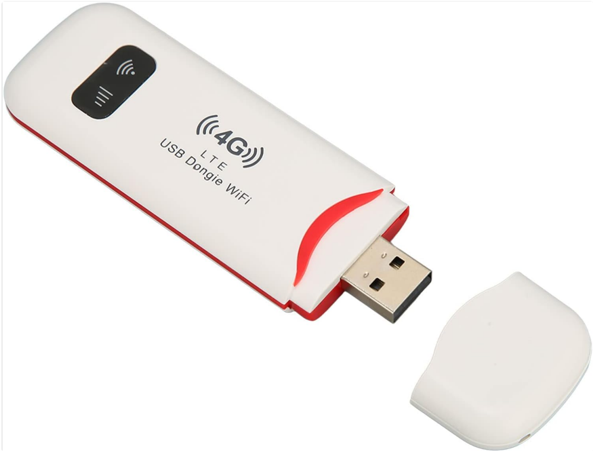
Figure 3: The Zunate Portable 4G USB Network Adapter with its protective cap removed, revealing the standard USB-A connector. The SIM card slot is typically located under a removable cover on the device body.