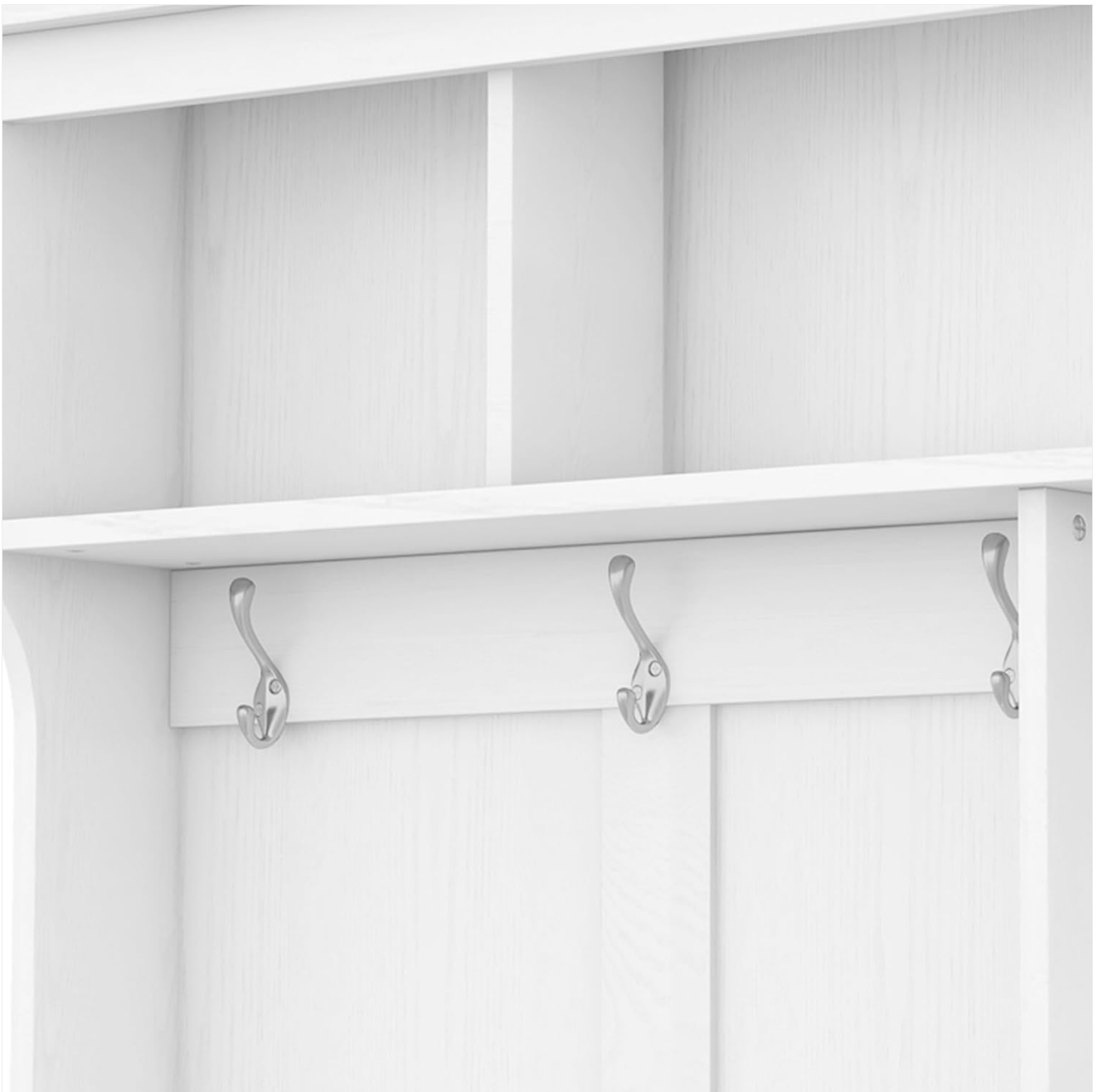
Figure 4.5: Close-up of the installed coat hooks.