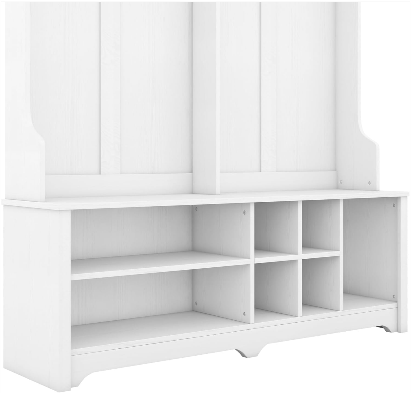
Figure 4.2: Detailed view of the assembled shoe cubbies and bench area. This shows the structure of the base unit.