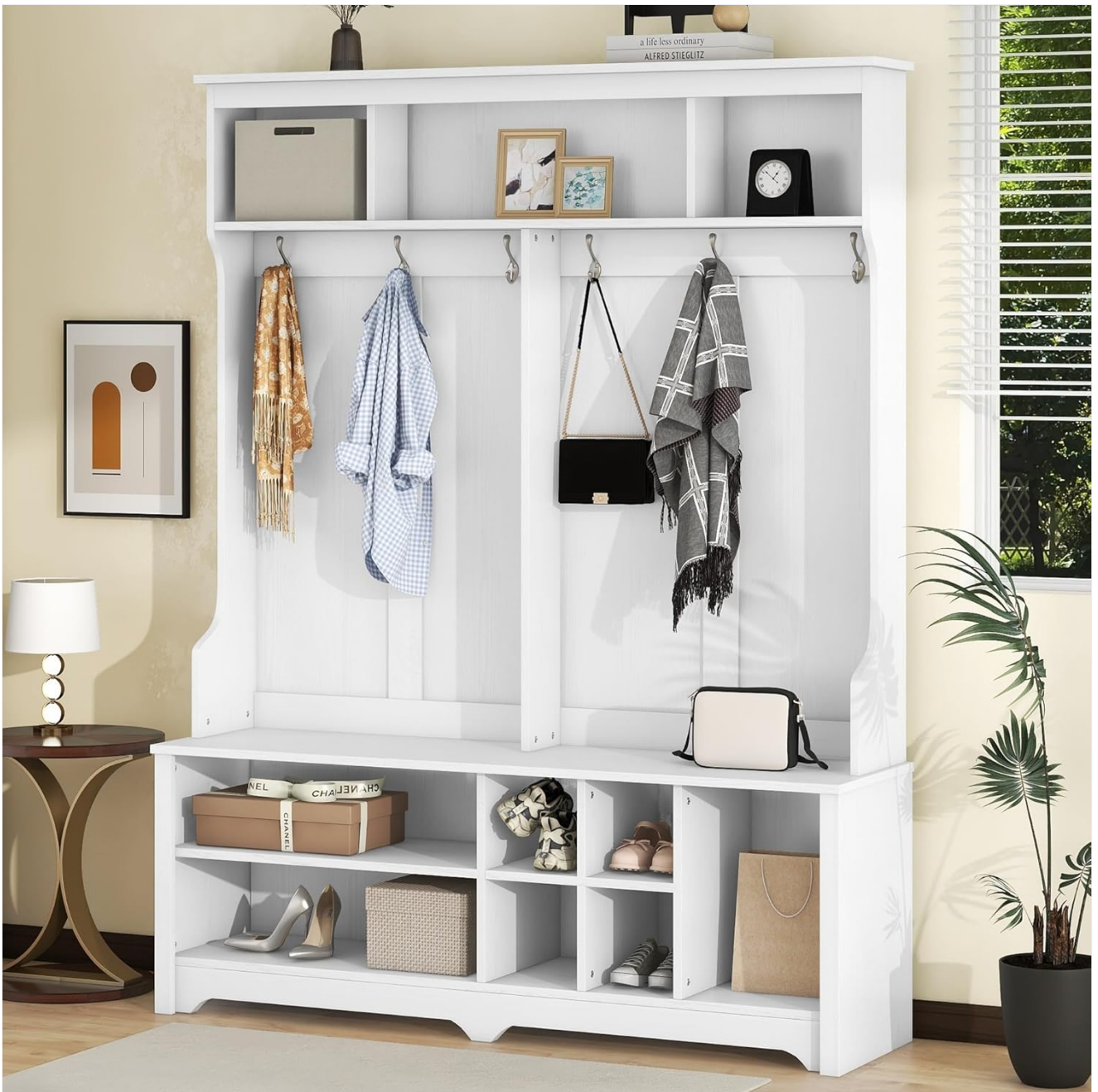
Figure 4.4: The hall tree with the top shelf unit installed, showing the complete structure.