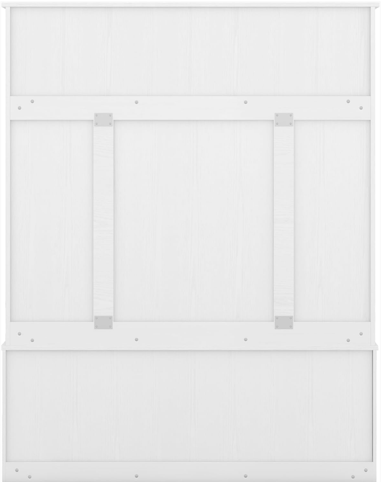
Figure 4.3: Rear view illustrating the back panel installation and support structure.