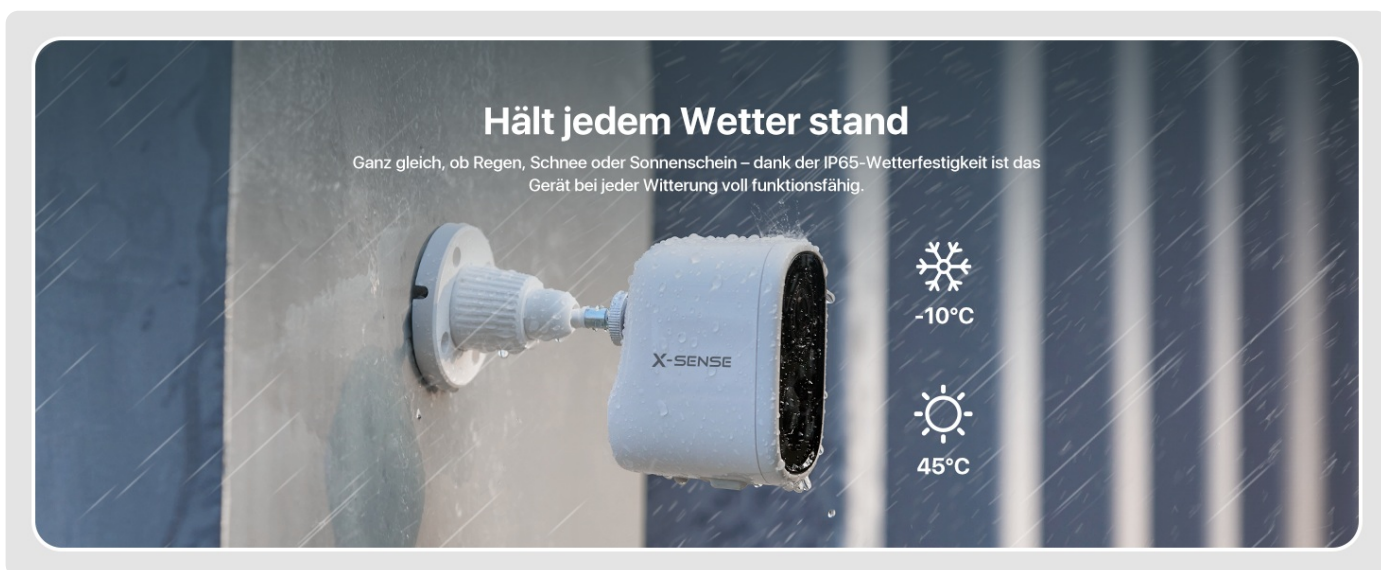
Image: The camera enduring rain, demonstrating its IP65 weatherproof design and operational temperature range (-10°C to 45°C).