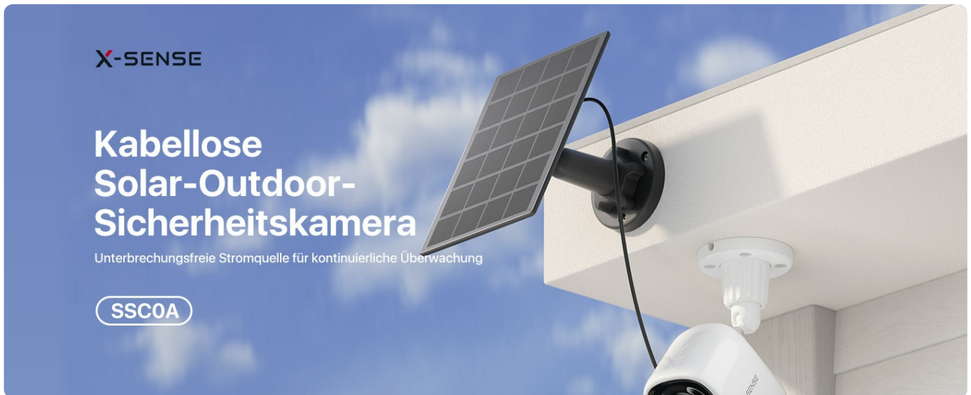
Image: The X-Sense SSC0A camera connected to its solar panel, highlighting its solar charging capability and wireless setup.