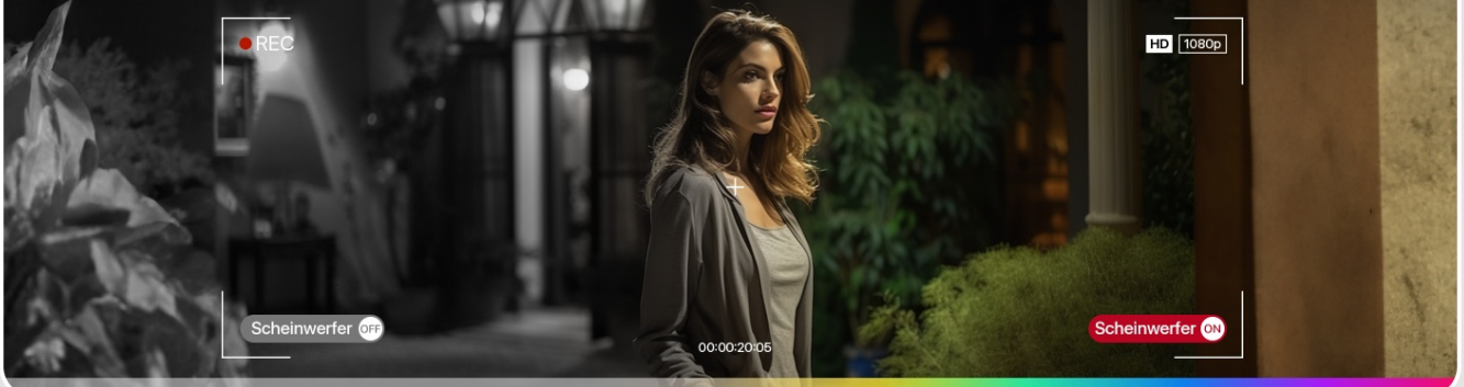
Image: A visual comparison demonstrating the camera's 1080p HD color night vision with spotlights on versus standard black and white night vision.

Diese Kamera erstellt dank eines ultrahellen LED-Strahler auch nachts detaillierte, vollfarbige Videos von Ihrem Haus und Garten.