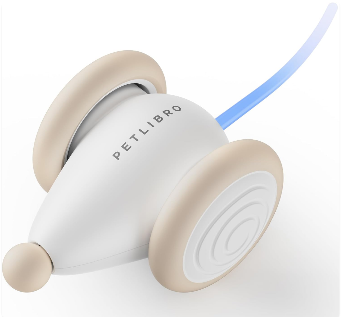
The PETLIBRO Interactive Cat Toy in Bisque, designed to resemble a small mouse with a glowing tail.