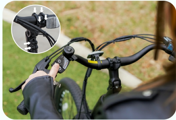
Figure 6: Utilizing Boost Mode for easier uphill travel.

Customize Your Ride with Adjustable Handlebars.