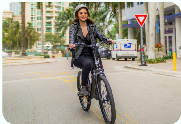
Figure 7: The 7-speed gear system for versatile riding.

Provides a Fast and Smooth Riding Experience.