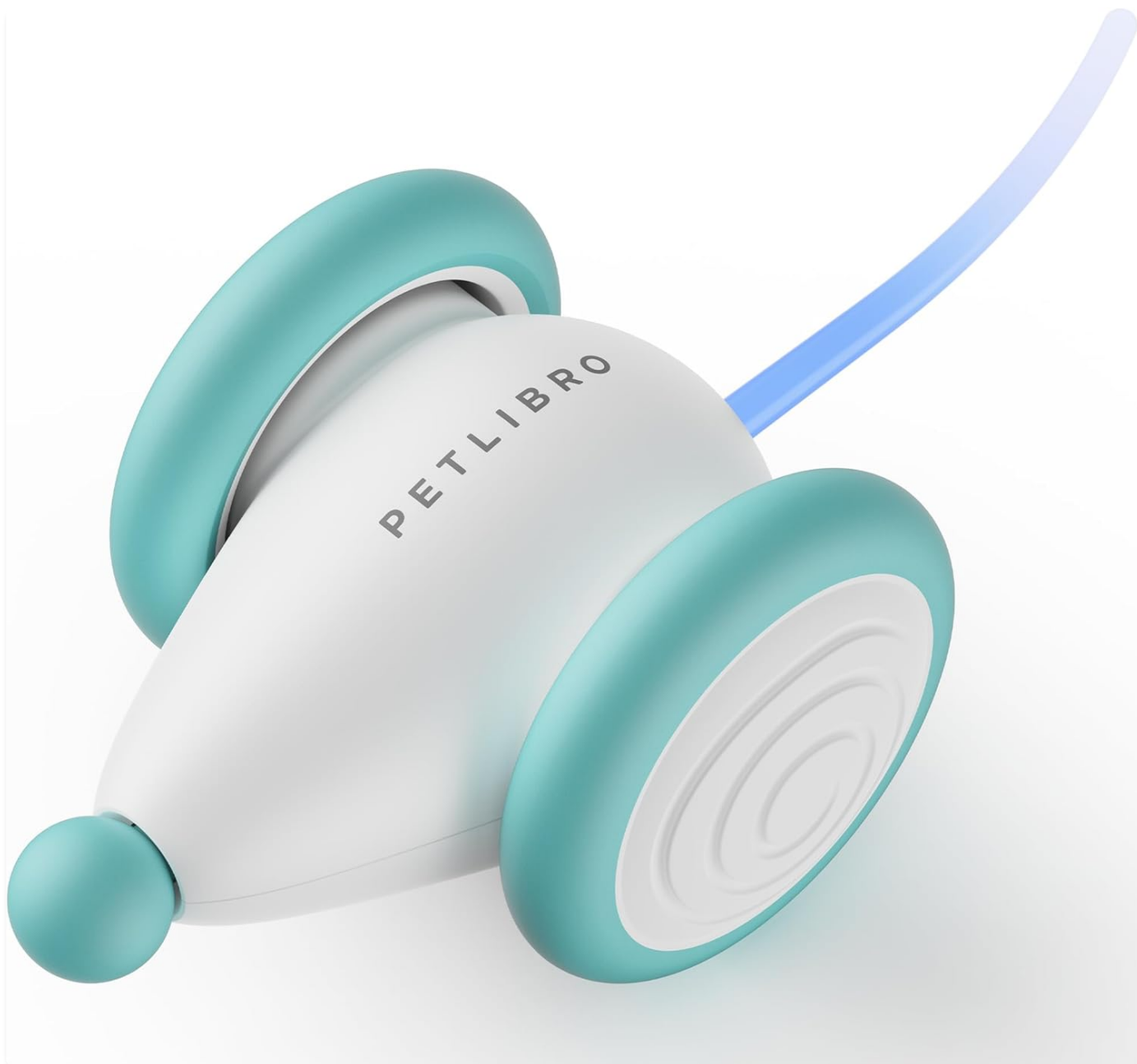
Image: The PETLIBRO Interactive Cat Toy, a white and teal mouse-shaped device with large wheels and a glowing tail.