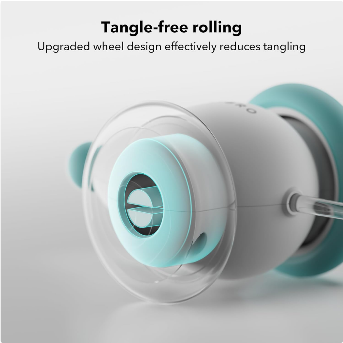
Image: A close-up view of the toy's wheel, highlighting its design for easy cleaning and tangle reduction.

Upgraded wheel design effectively reduces tangling