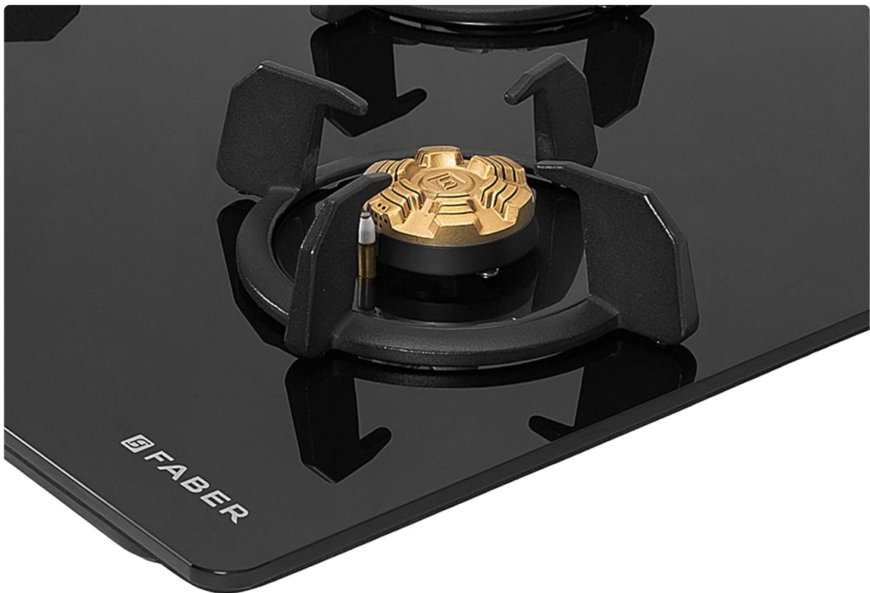
Image: Close-up of a brass burner, highlighting its design for easy maintenance.