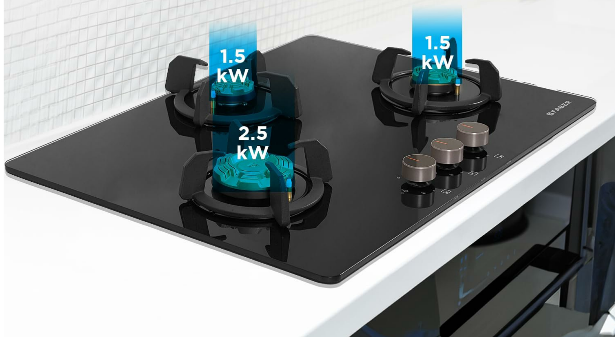
Image: Detailed illustration of the in-built auto electric ignition system.