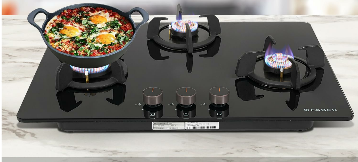
Image: Overview of key features including cast iron pan support, auto electric ignition, metal knobs, and multi-flame burner.