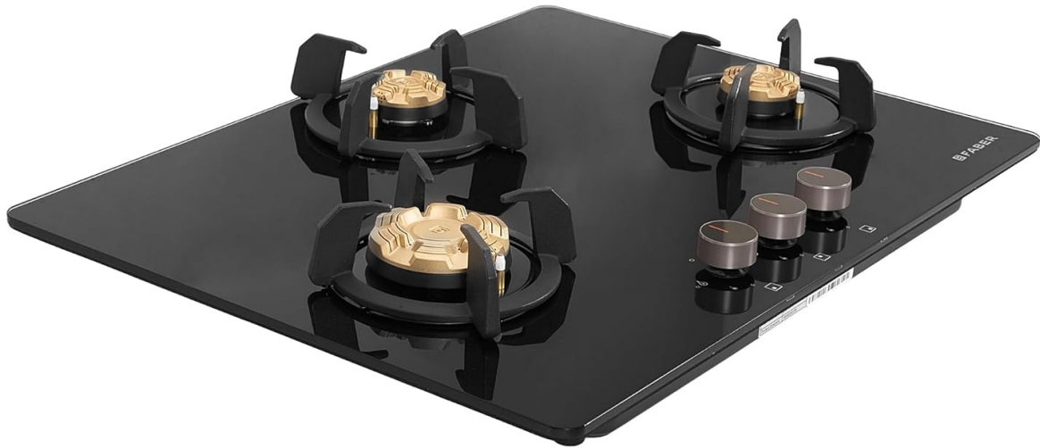
Image: Brass burners with indicated power ratings of 1.5kW and 2.5kW.